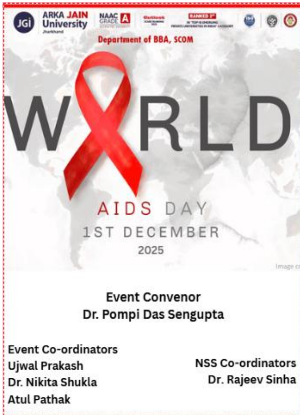
Figure 1: Poster of the event