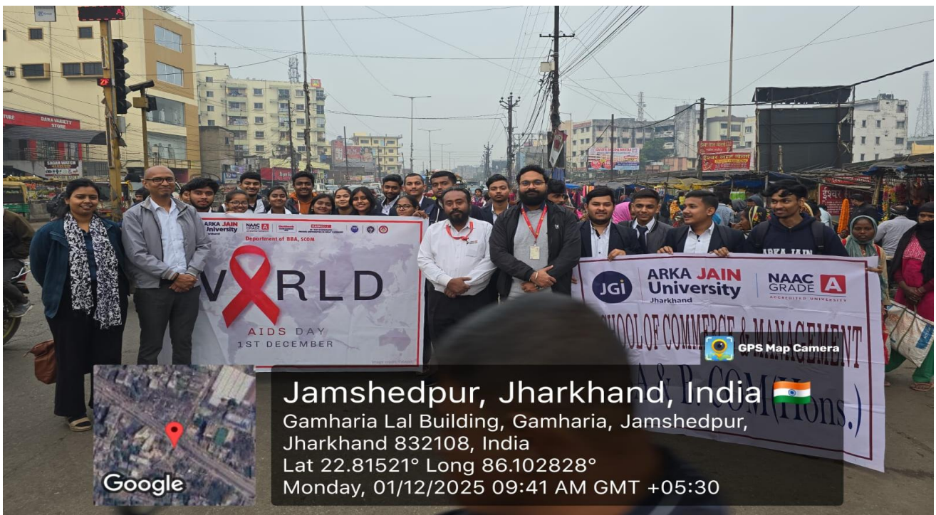
Figure 2: Photos of the event