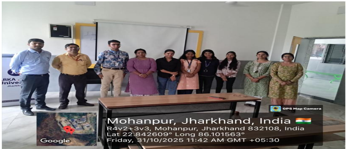
Figure 1- Students and Faculties attending the Event