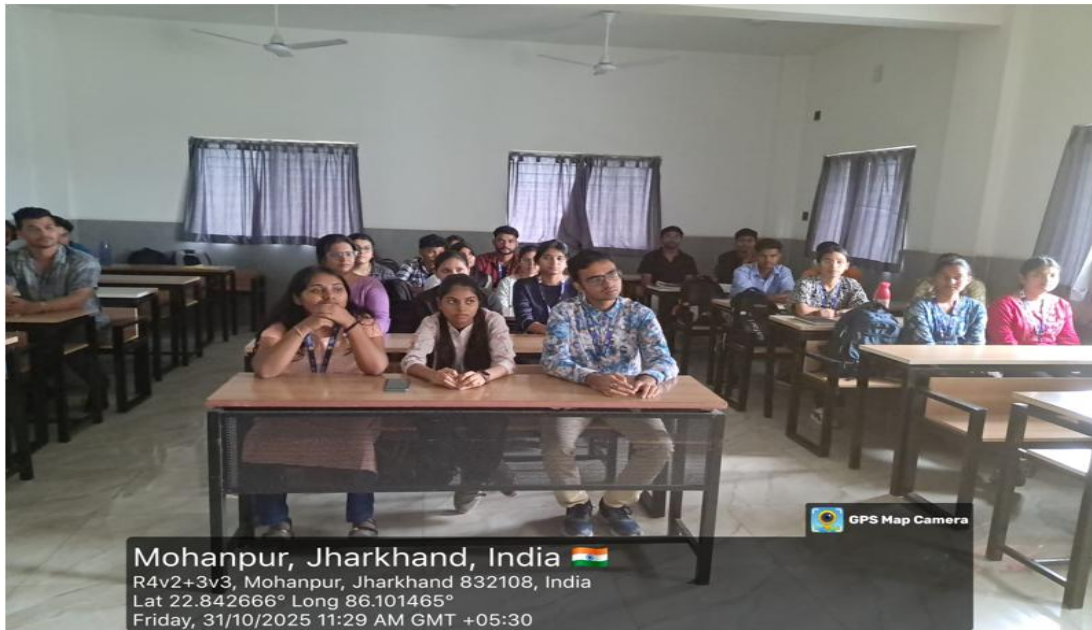
Figure-3 The Central Vigilance Commission (CVC) is India’s apex body that promotes integrity, transparency, and fights corruption in public administration.