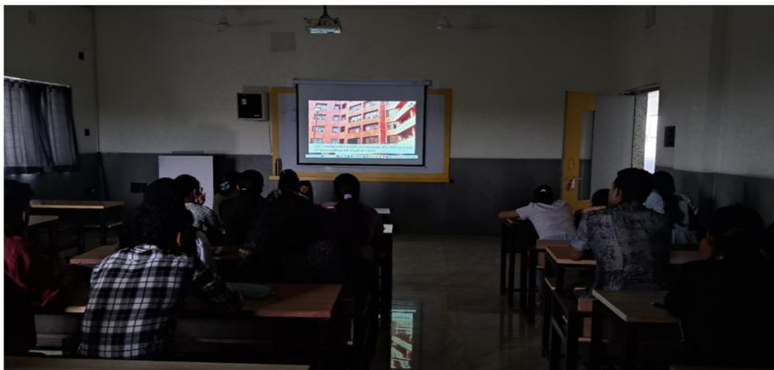
Figure -4The Central Vigilance Commission (CVC) is an independent body that supervises and guides vigilance activities to prevent corruption in the central government and public organizations.