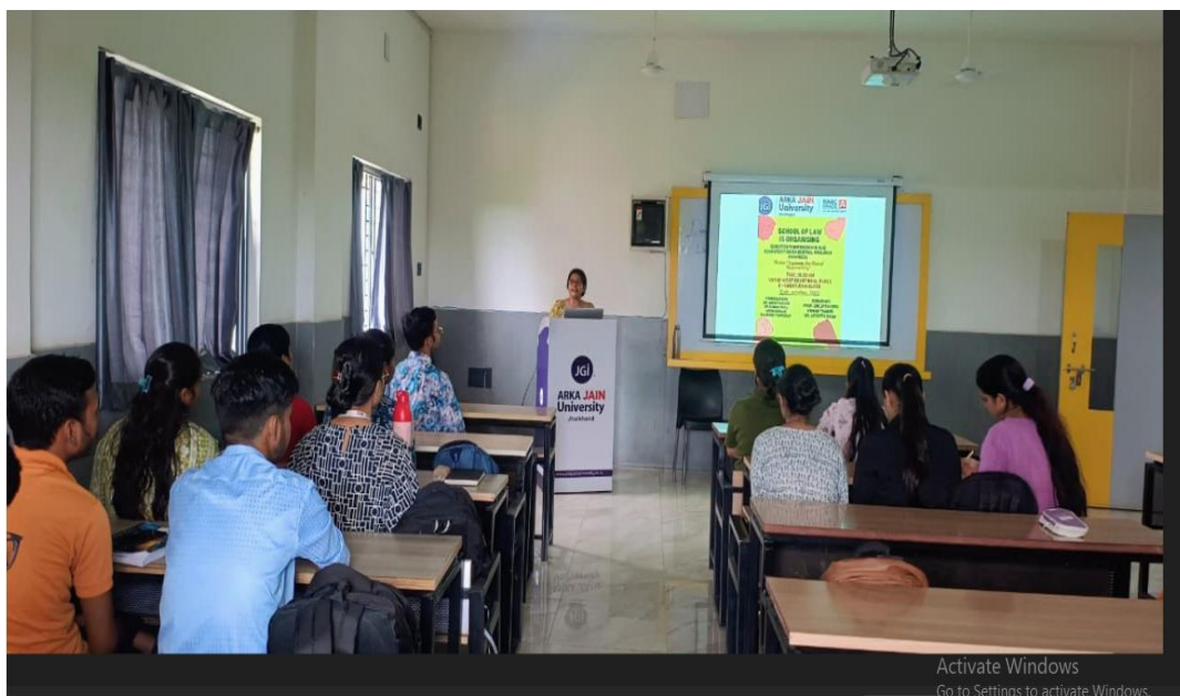
Figure 2- Explaining the Role of Central Vigilance Commission.