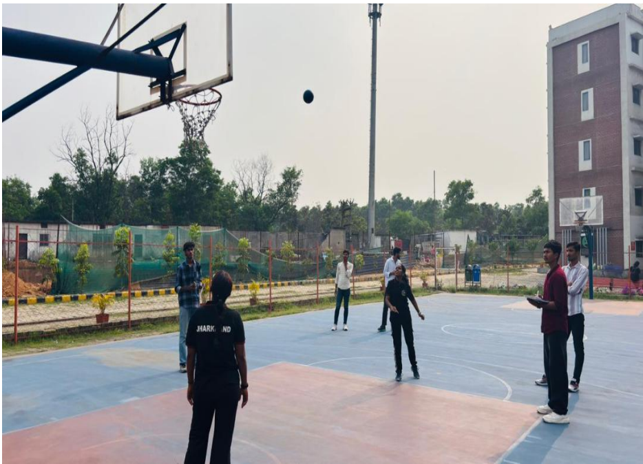
Figure 5. Students Actively Participating: "Women Sports Carnival-2026"