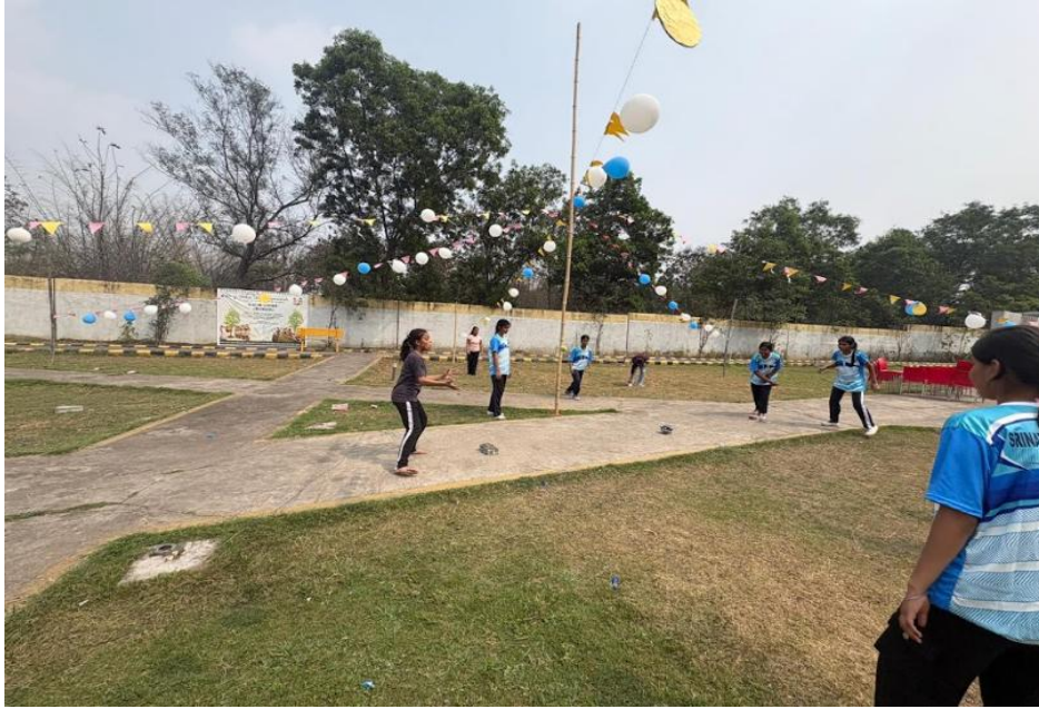
Figure 4. Students Actively Participating: "Women Sports Carnival-2026"