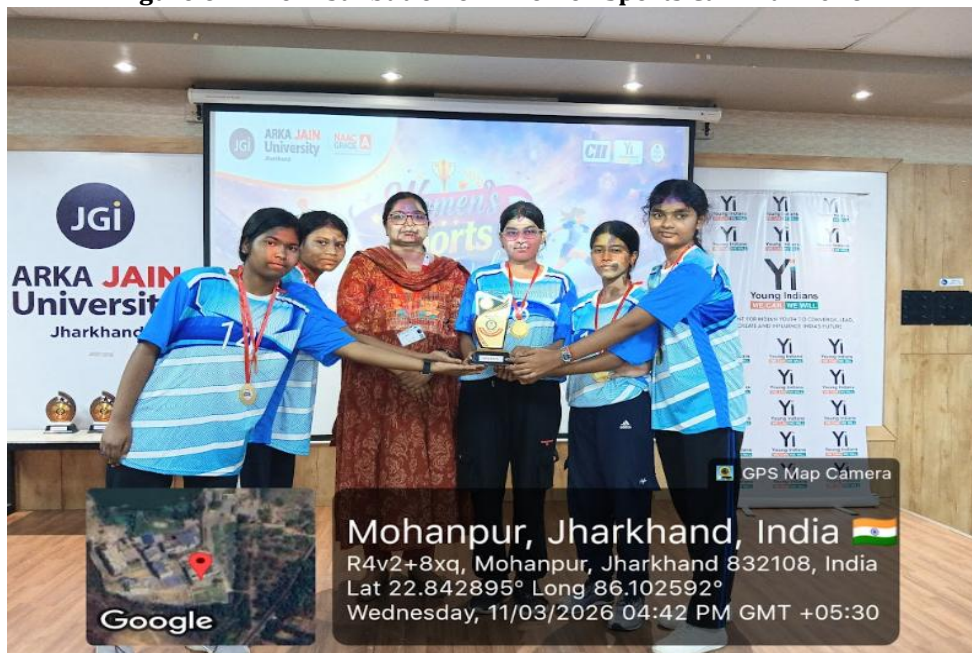
Figure 7. Prize Distribution on "Women Sports Carnival-2026"