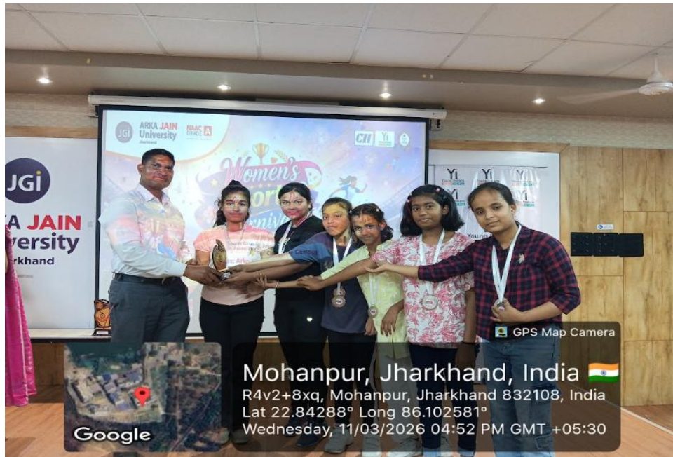
Figure 6. Prize Distribution on "Women Sports Carnival-2026"