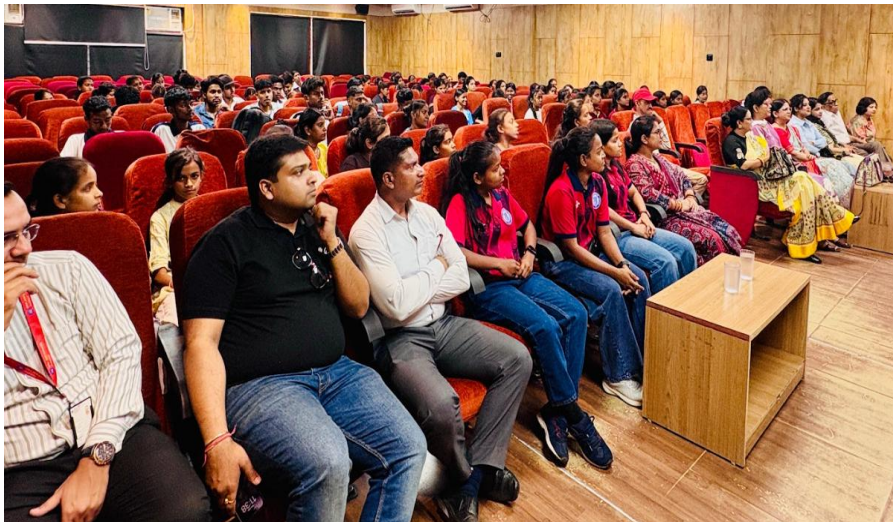
Figure 3. Inauguration of the Event: "Women Sports Carnival-2026"