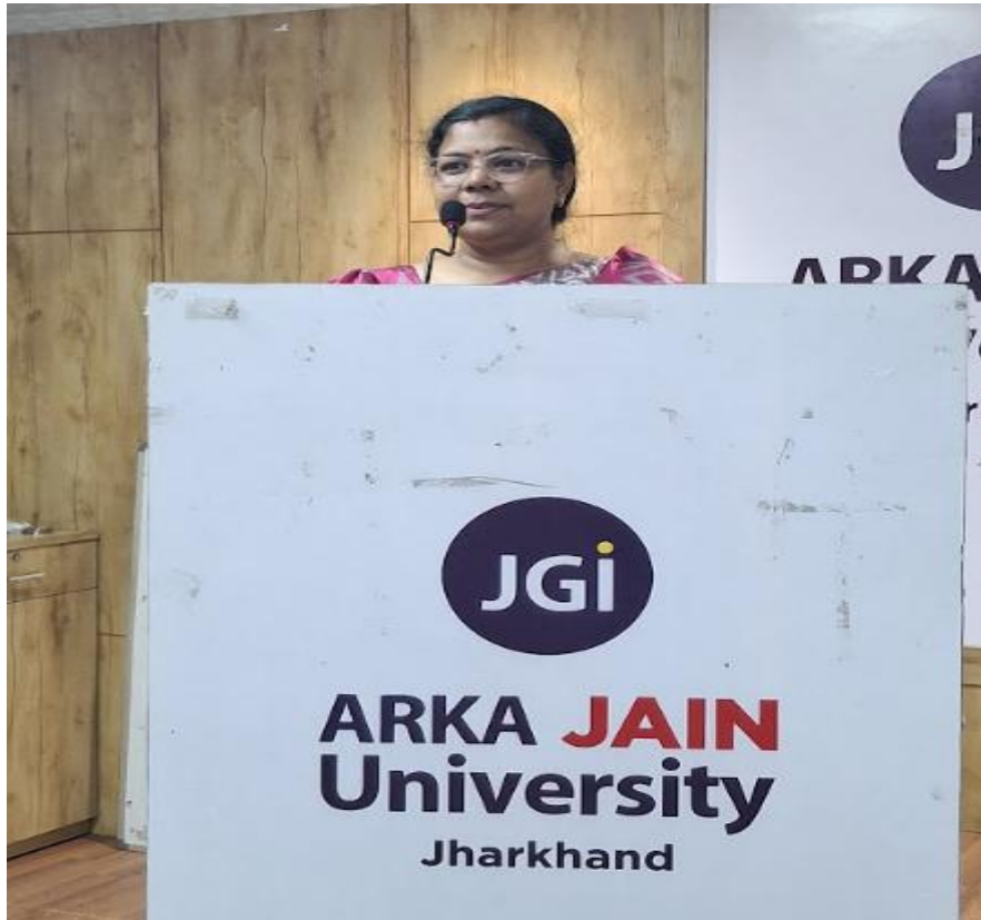
Figure 2. Hosting the Crowd for Event: "Women Sports Carnival-2026"