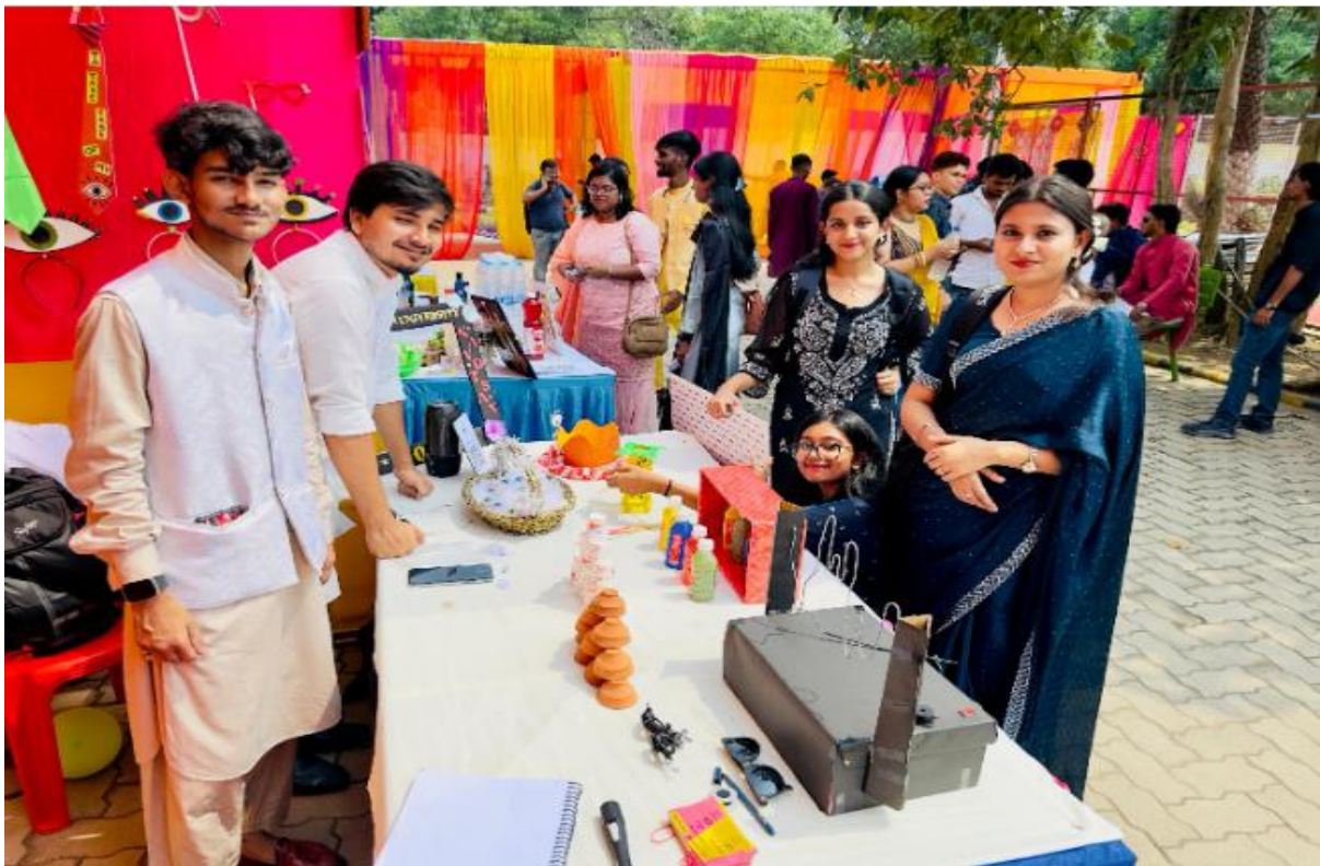
Figure 05: Photos of Stalls