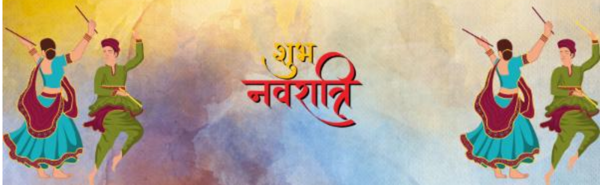
Figure 02: Brochure of the Event: NAVOTSAV 2024