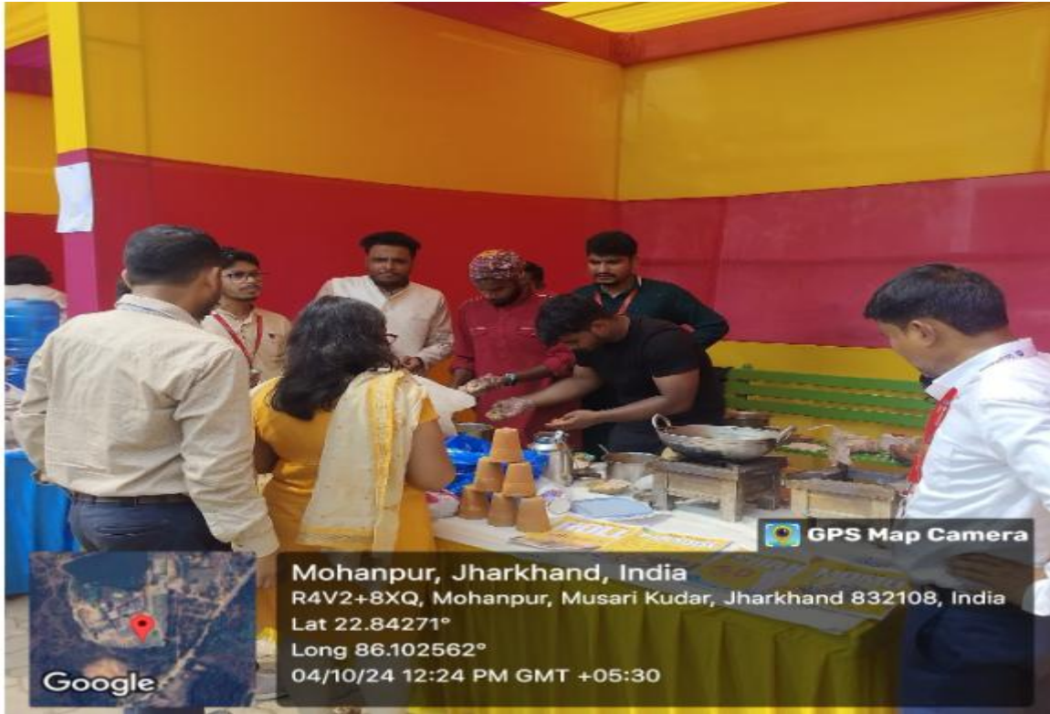
Figure 04: Geo Tagged Photo of Stalls