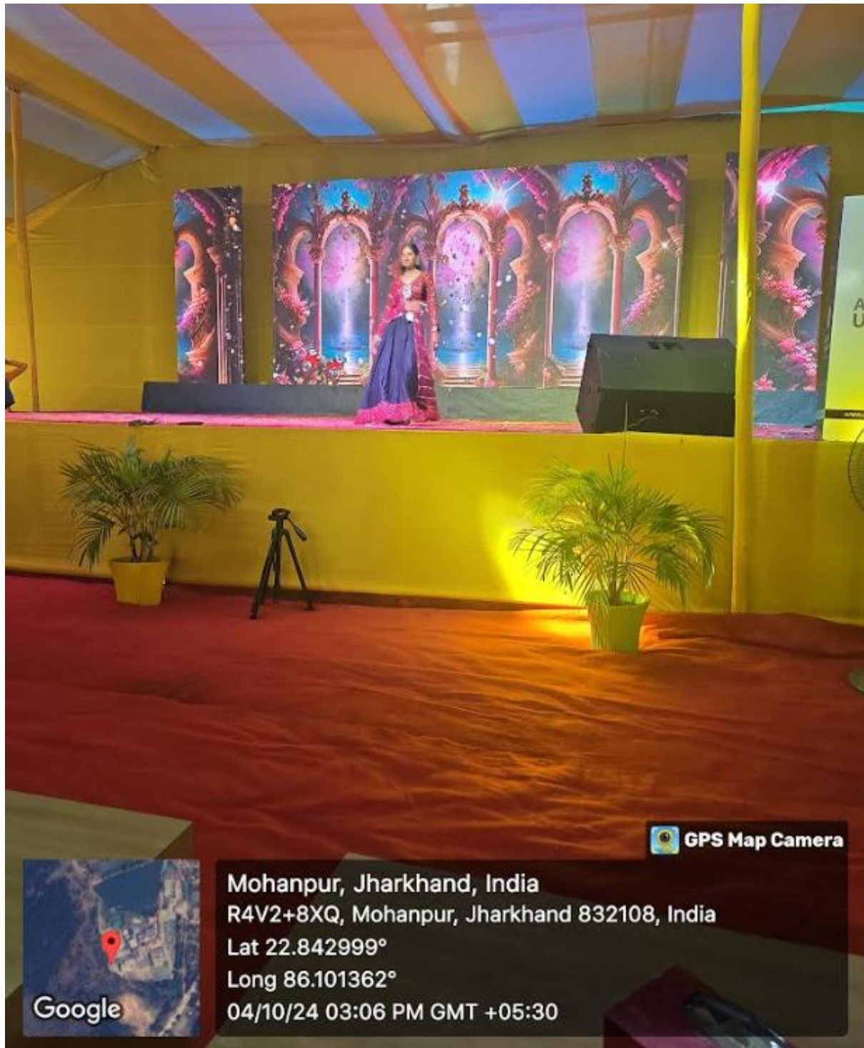
Figure 03: Geo Tagged Photo of Fashion Show of a student