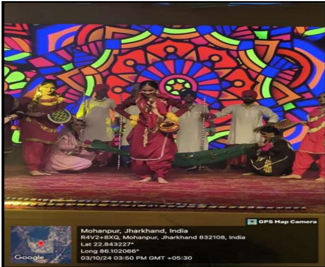
Figure 06: GPS Tagged Photo of Dance Competition