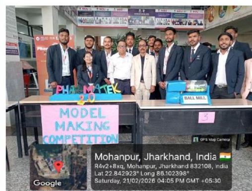
Fig. 24- Models Presented by the Students