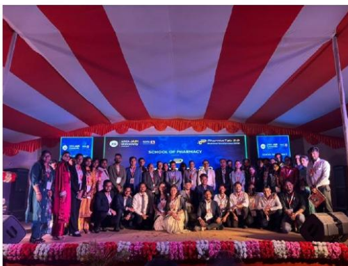
Fig. 21- All Committees in One Frame