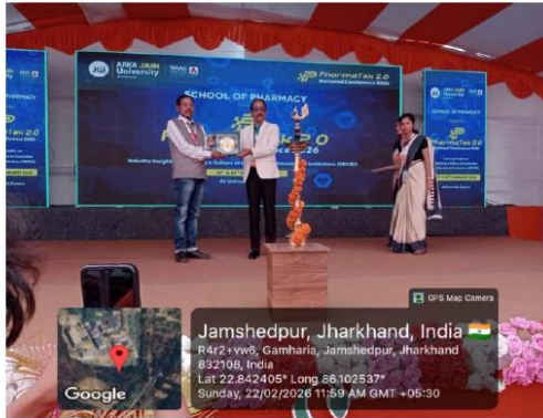
Fig. 13-Dean SOP, AJU felicitating Eminent Speaker