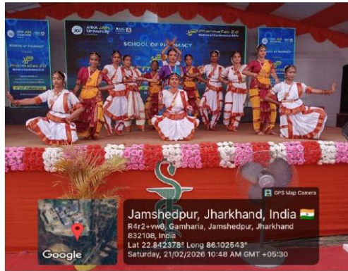
Fig. 17-Students Presenting Cultural Performance