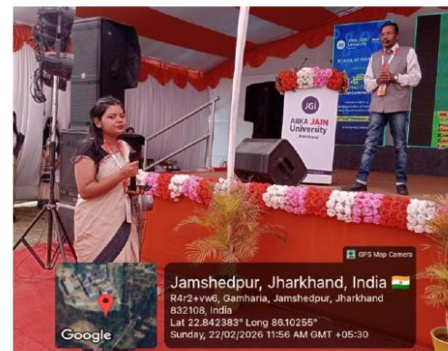
Fig. 16-Students Interacting During Plenary Session