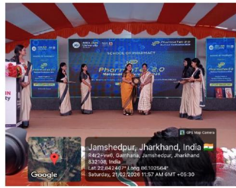
Fig. 10-Dean SCOM AJU felicitating Guest of Eminence