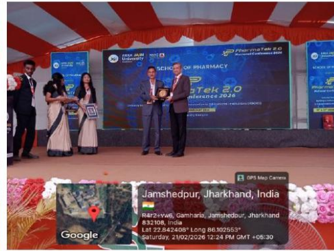
Fig. 8-Pro-VC felicitating the Principal Guest