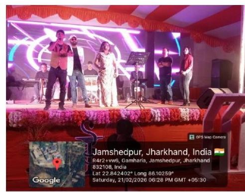
Fig. 18-Professional Singers Presenting Musical Evening