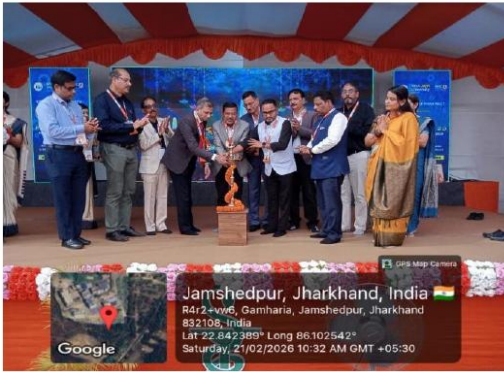
Fig. 7-Lamp lighting by the Dignitaries