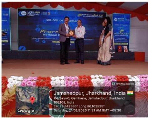
Fig. 9-Chairman AJU felicitating the Registrar of JSPC