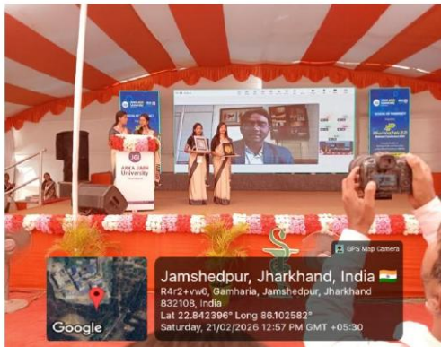
Fig. 15-Virtual Felicitation of Chief Guest