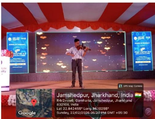
Fig. 23- Student Showcasing his Talent