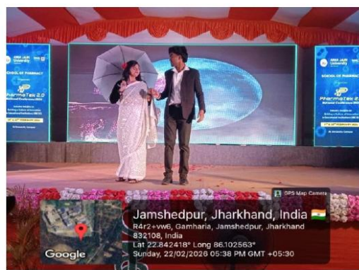
Fig. 22- Ramp Walk by the Student Performers