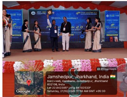
Fig. 14-Jt Registrar felicitating Guest of Eminence