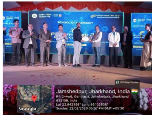
Fig. 20- Winners Felicitated with Certification