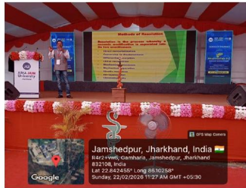
Fig. 12- Eminent Speaker Presenting Plenary Session