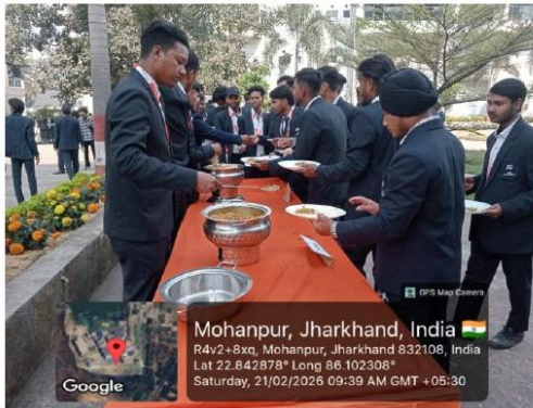
Fig. 19- Participants Enjoying Lunch Break