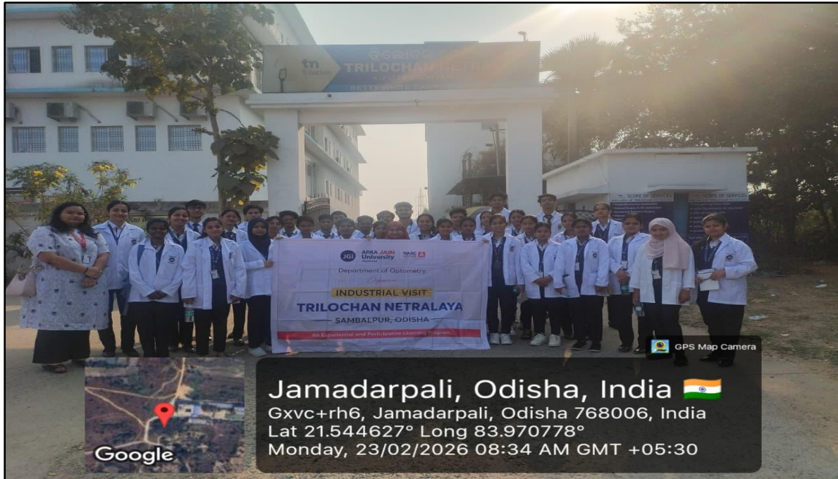
Fig 1: The Department of Optometry organised Industrial visit to Trilochan Netralaya, Sambalpur