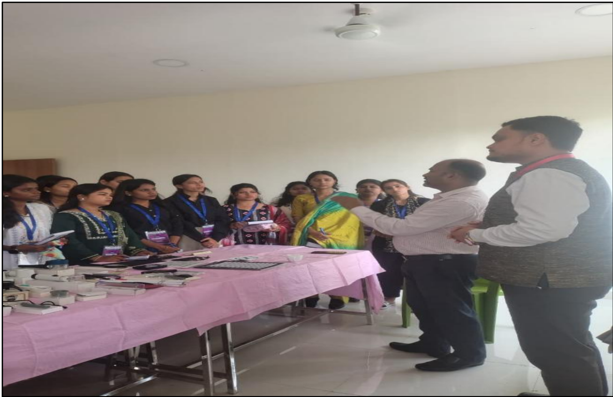
Fig 5: Students attending the workshops and getting knowledge on Low Vision Aids by eminent speaker at TRICON SUMMIT 3.0