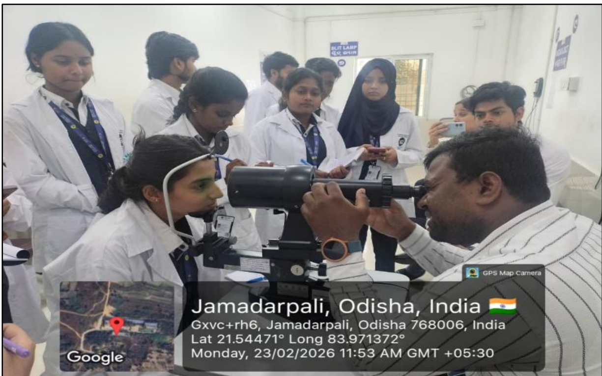
Fig 6: Students getting hands on practice on instruments at hospital during industrial visit.