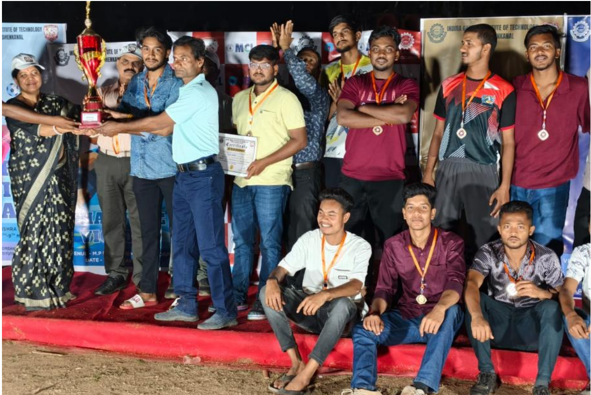
FIG. 03:Volleyball team receiving gold medals and trophy