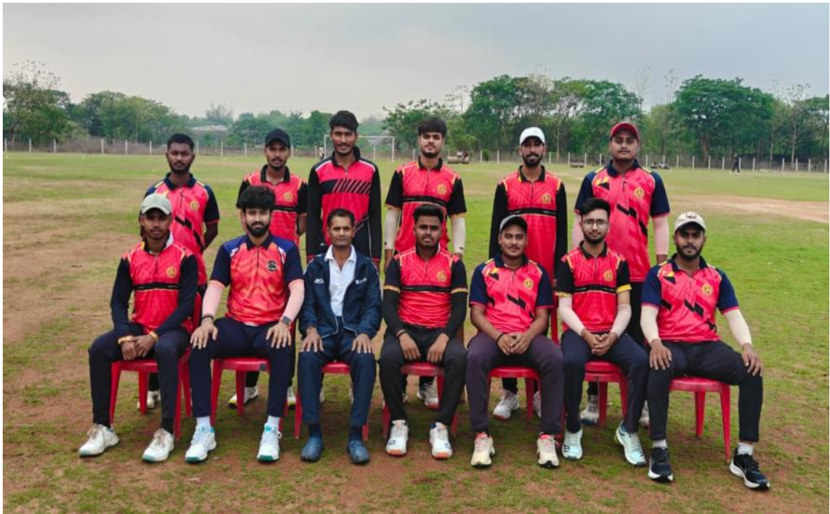
FIG. 04: Cricket team gathered with faculty coordinator after the semi final match