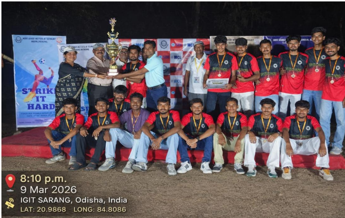
FIG. 01: Football team receiving championship trophy from Dignitaries