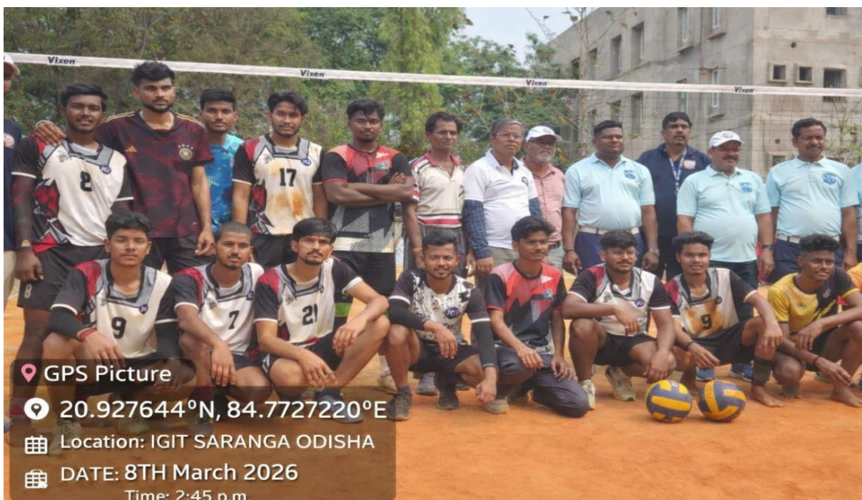
FIG. 02: Both finalist and organising team gathered before Final