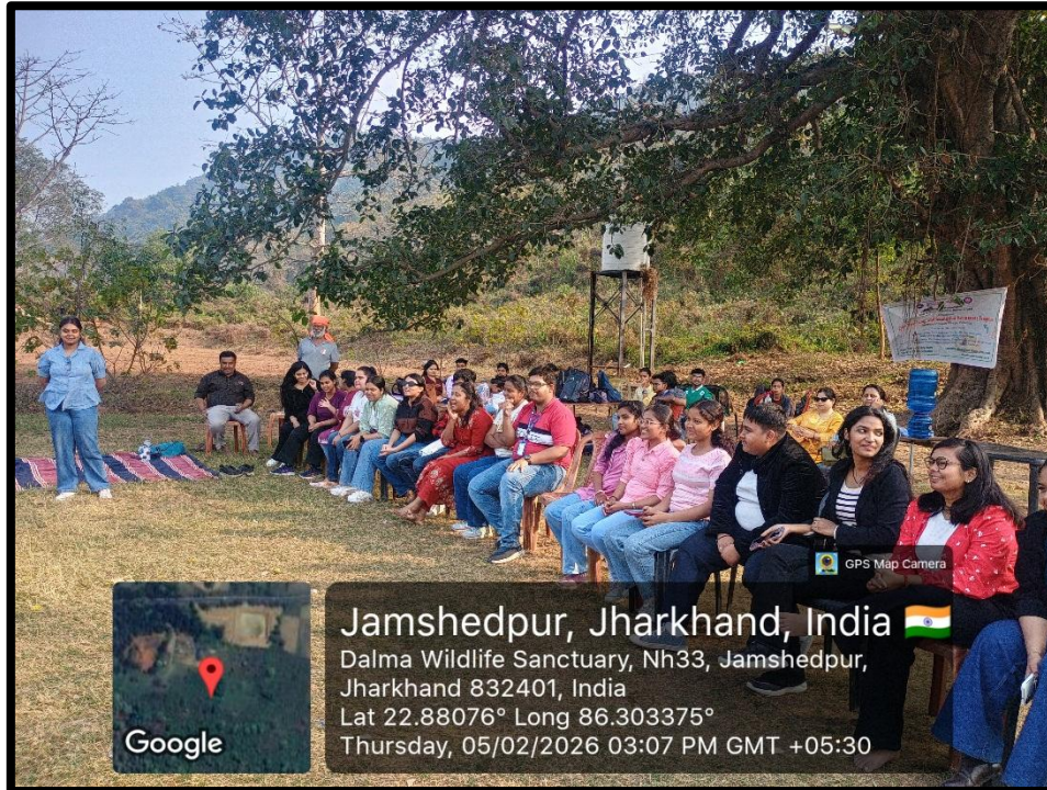
Fig.12- Students expressing their views regarding the camp