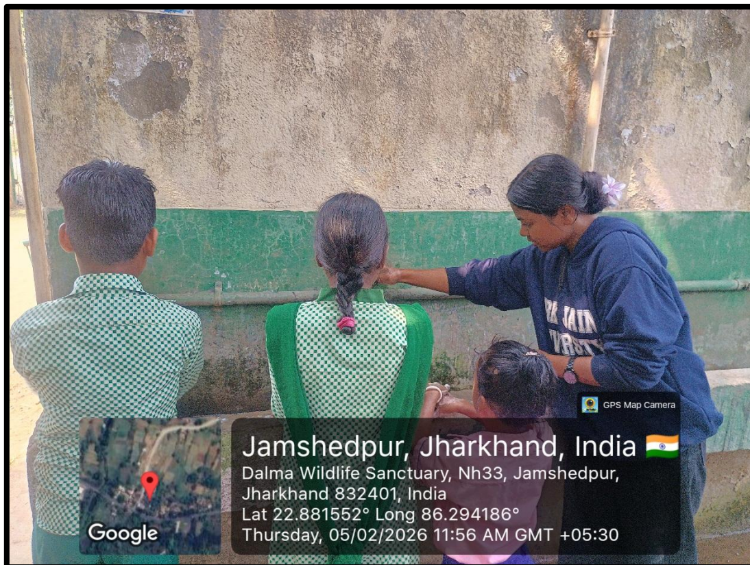
Fig.5 NSS Volunteers getting the hand washed