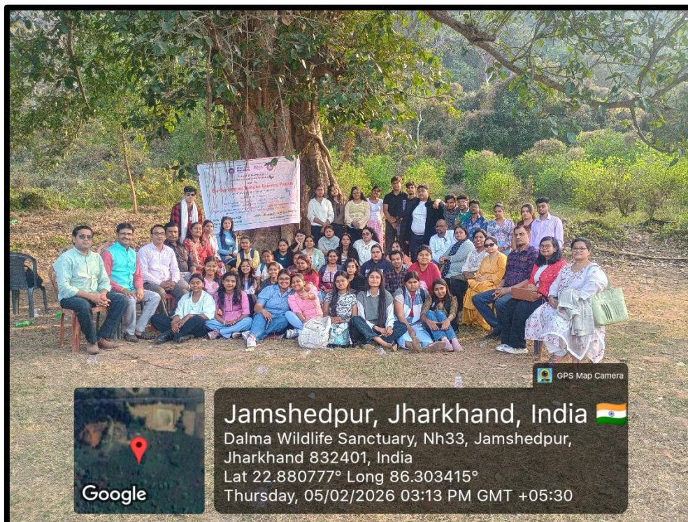
Fig.13- All participants in a frame at the end