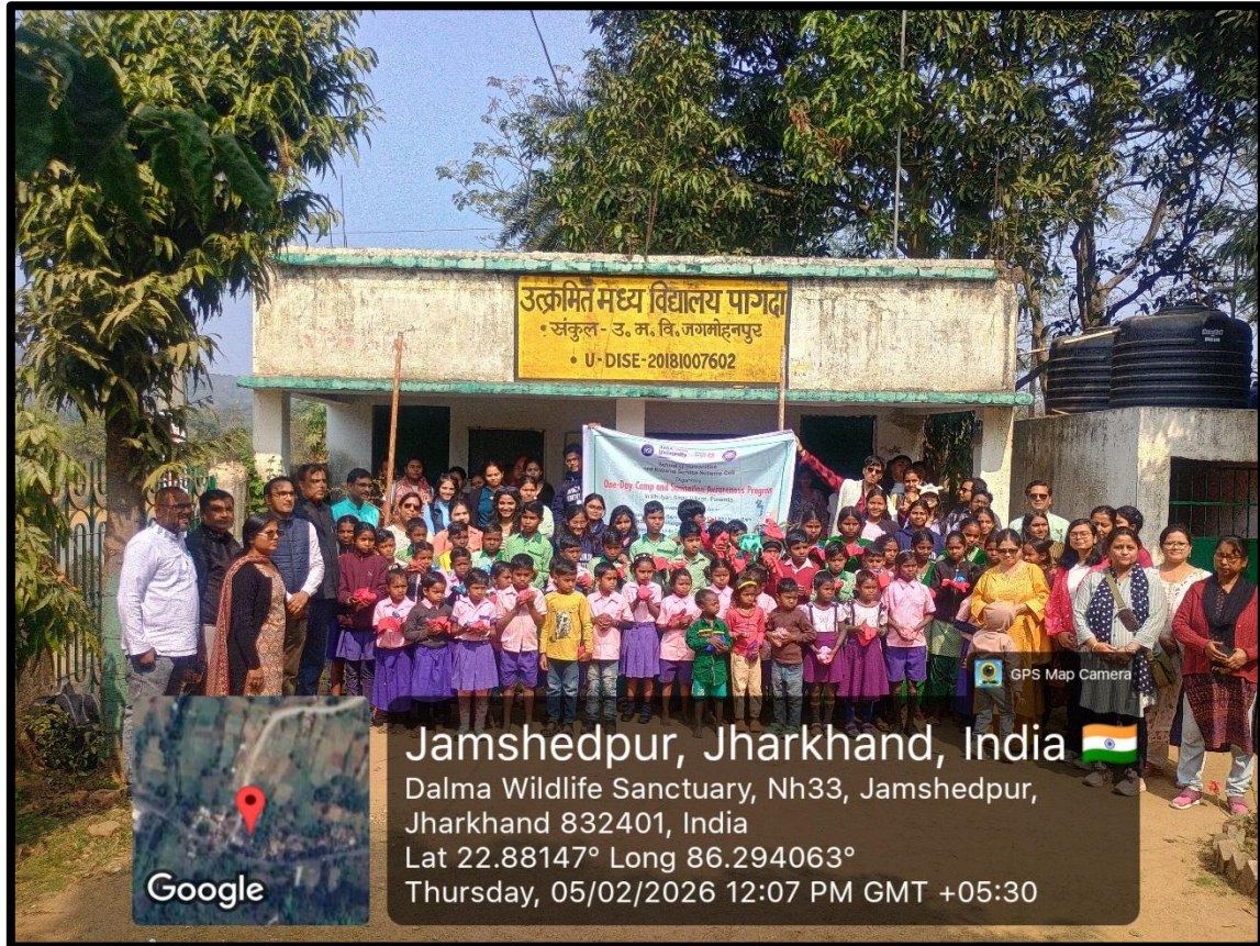
Fig.10 School students of Primary School, Pagda in a frame during One-Day camp and Sanitation Awareness Program