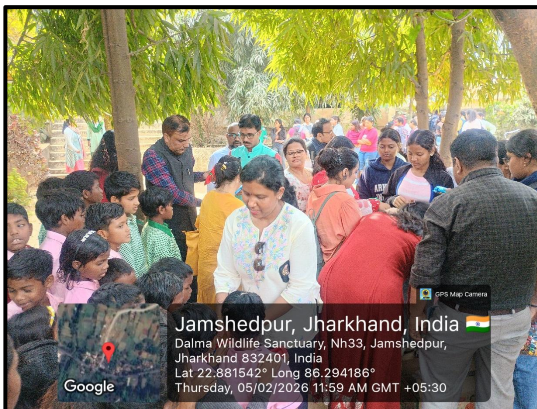
Fig.9 All faculty members and NSS volunteers-students of SoH distributing soap, napkins and sanitation kit to the school students