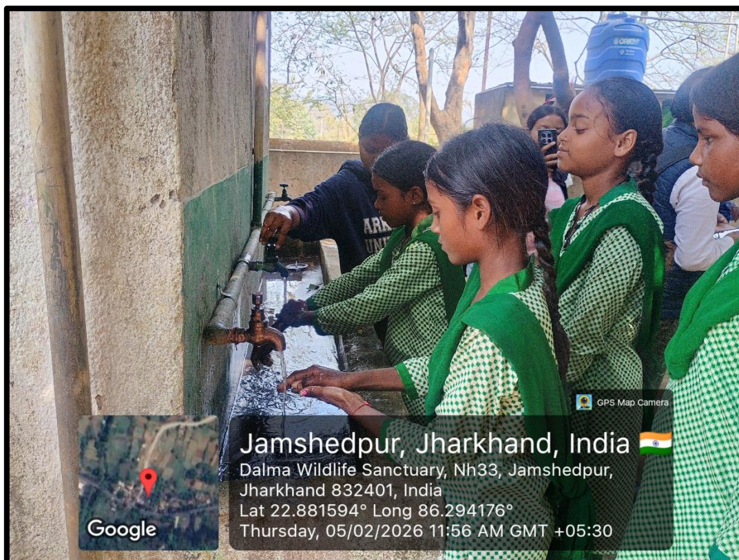
Fig.8 Girl students washing hands after the sanitation session