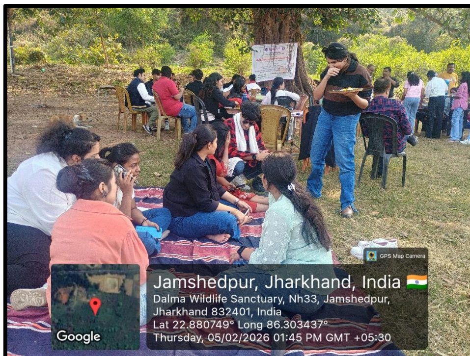
Fig.11- One-Day camp activities in progress at Bhuiyan Sinan