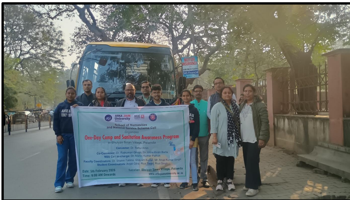
Fig.2 The students and faculty members leaving from Jamshedpur to the venue