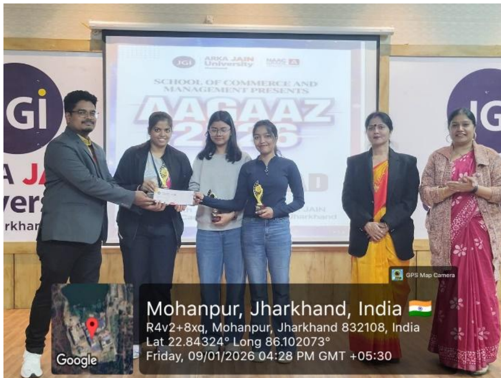
Fig. 4- Winners being felicitated by the Judge.