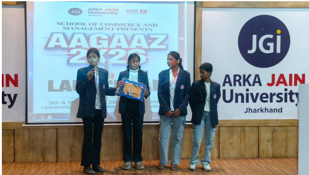
Fig. 3- Participants presenting their Product Idea