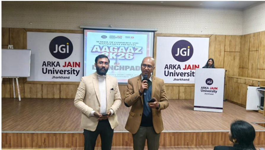
Fig.1- Faculty Coordinators Briefing the Gathering