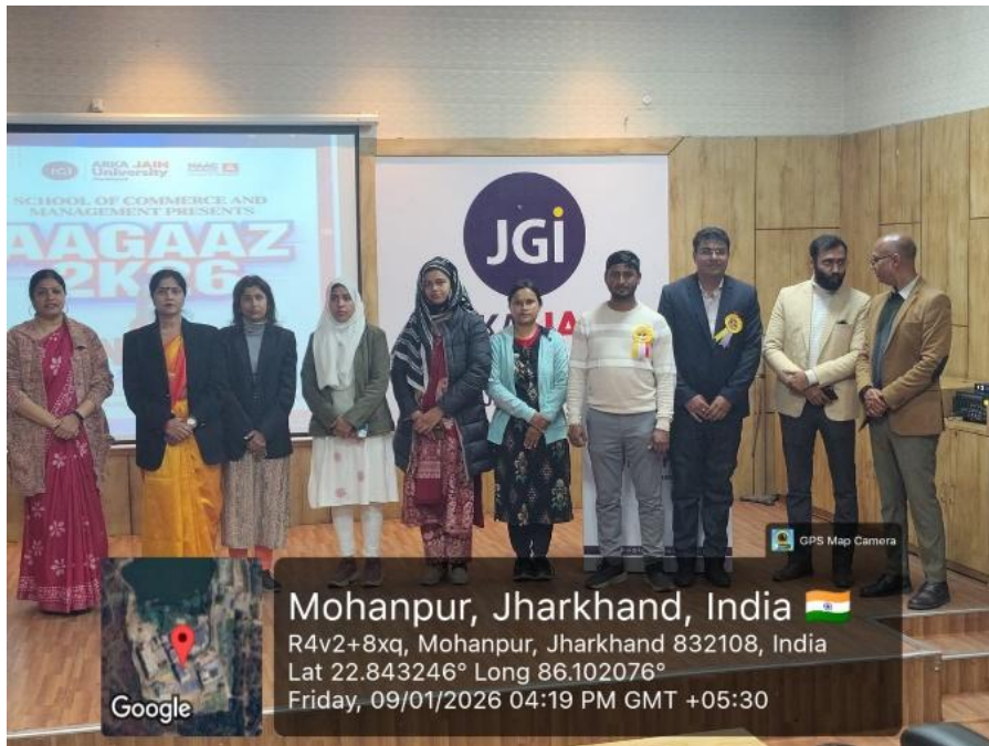
Fig. 2- Group Photograph with the School and College Faculty Coordinators