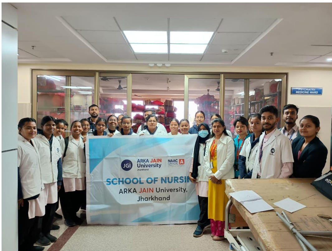
Fig.2-Visit of Psychiatric department of MGH hospital.