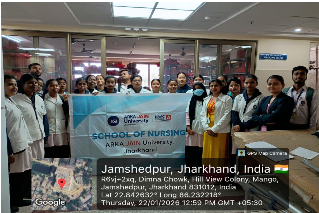
Fig. 4- Group photo of the visit to MGM Hospital.