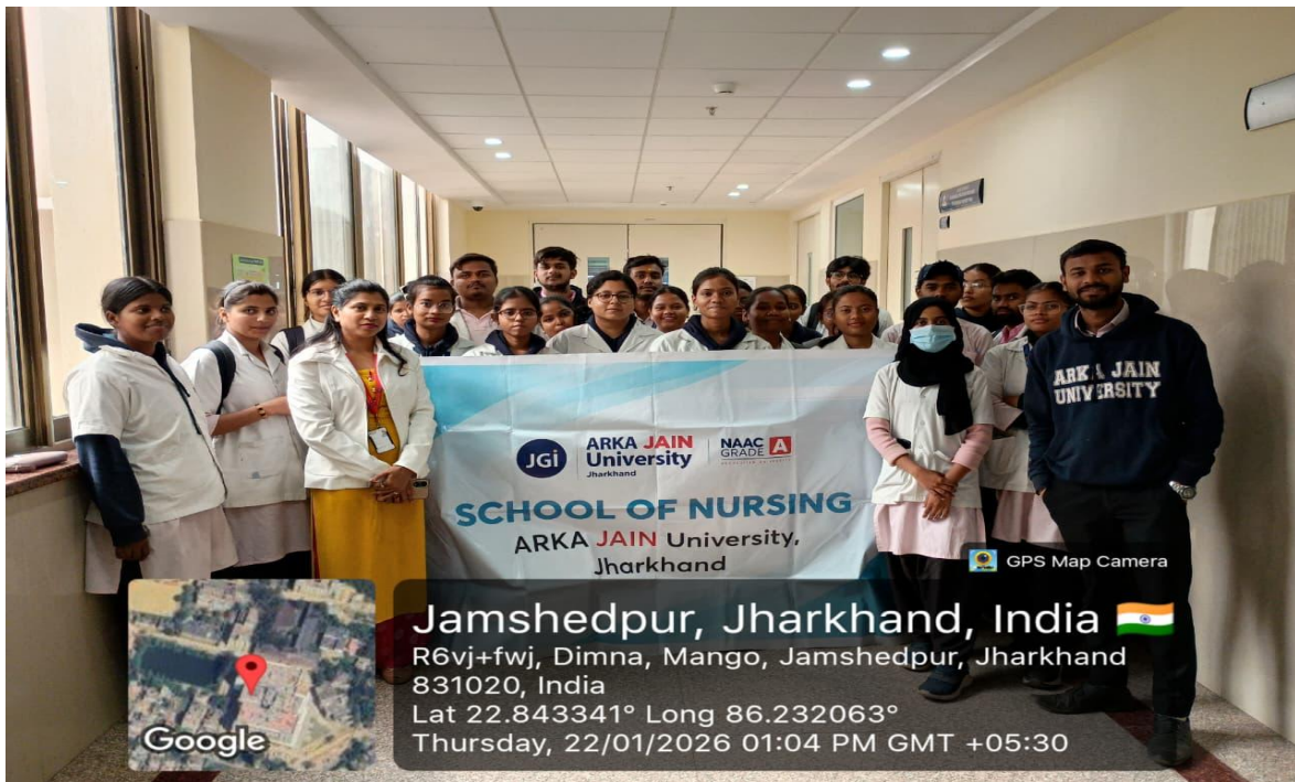
Fig.1-Visit of Management department of MGH hospital.