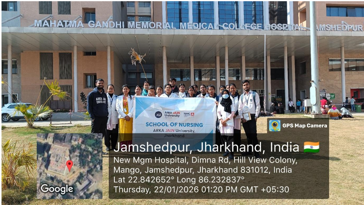
Fig. 3- Group photo of the visit.