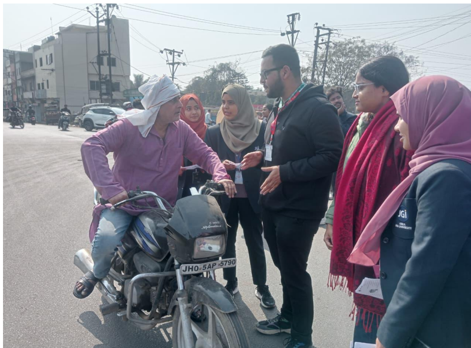
Figure 4: Students and Faculties briefing the importance of wearing helmets to bikers.