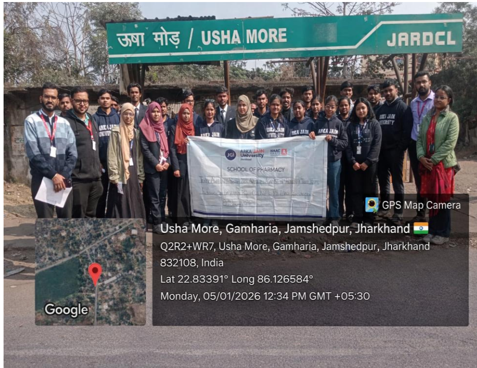
Figure 1: Students ready for The Traffic Awareness Program at Usha More, Gamharia, Jamshedpur.