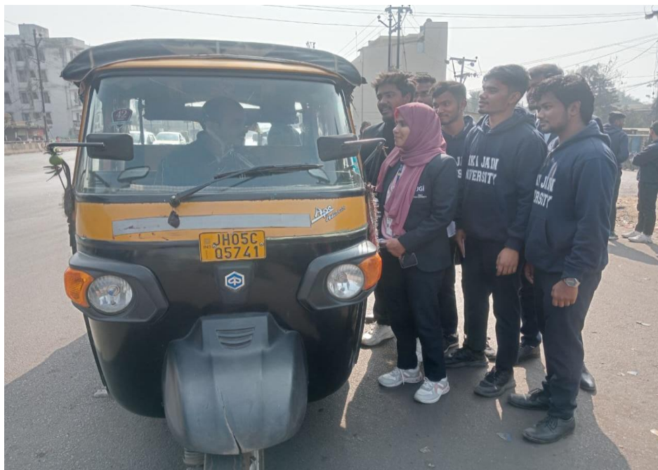
Figure 2: Students spreading Traffic Awareness to Auto rickshaw drivers.