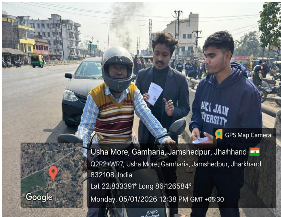
Figure 3: Students gathered together for spreading Traffic awareness.