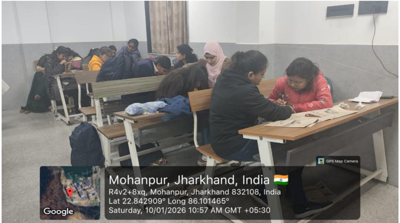
Figure 2: Participants of the Event