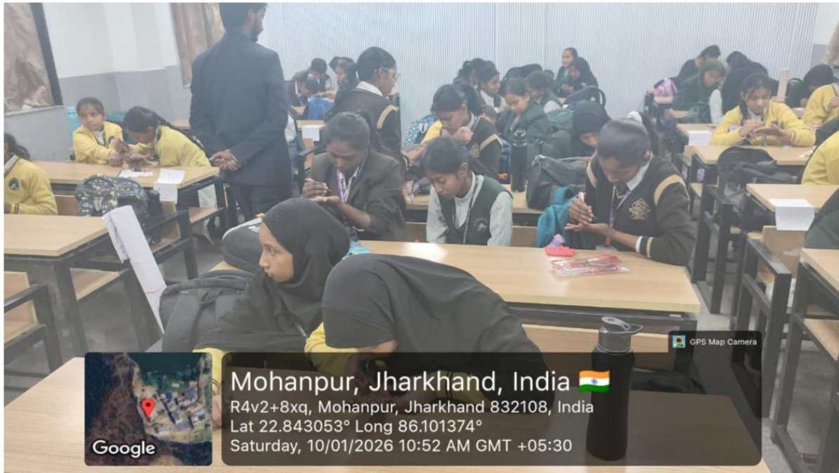
Figure 1: Participants participating in Mehendi competition