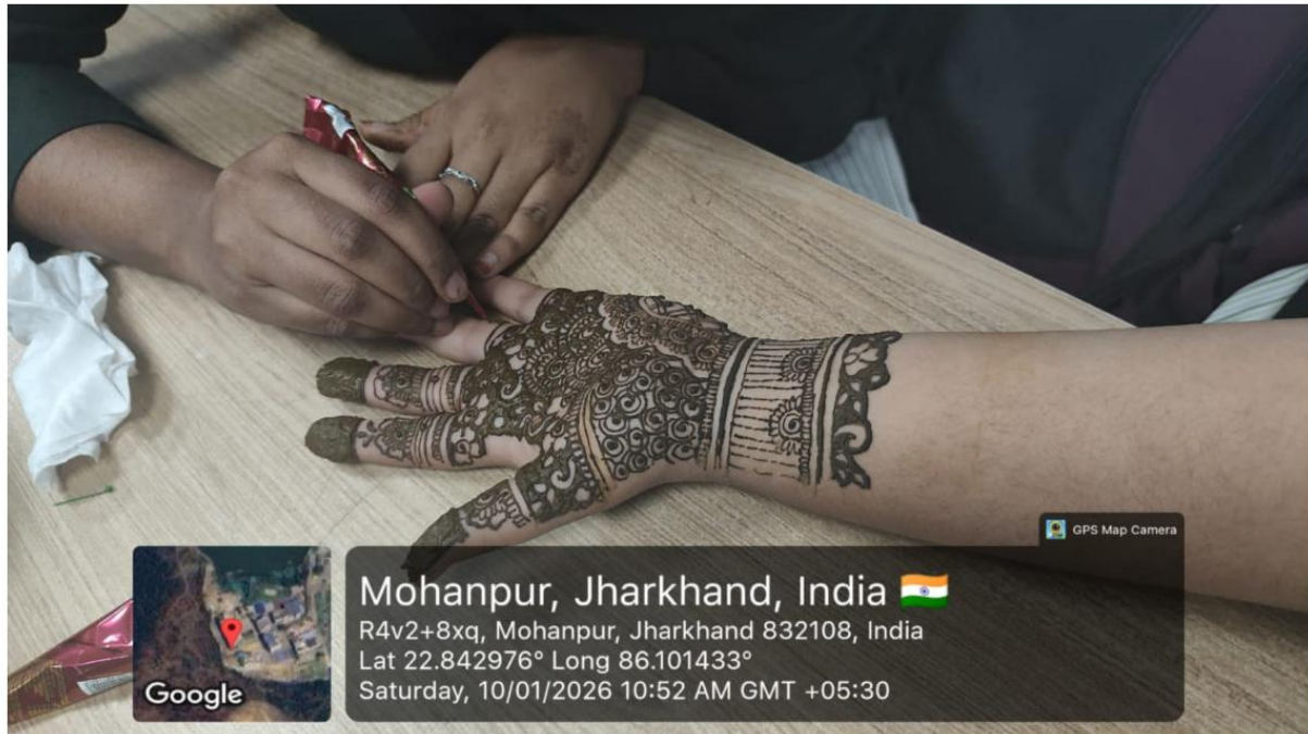
Figure 3: Students participants of the event