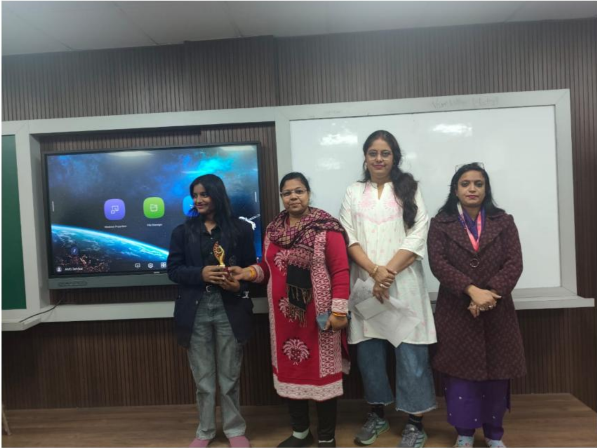
Figure 4: Winner with Judge