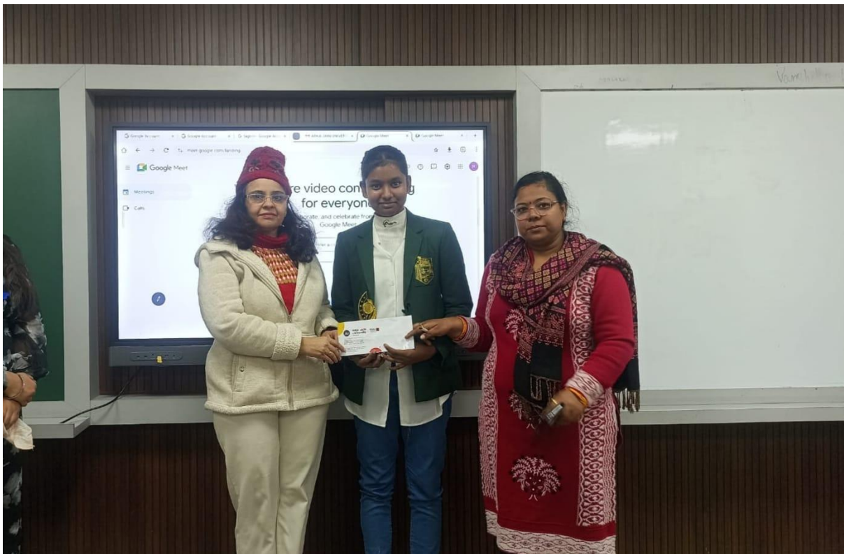
Fig.5- Winner of the event