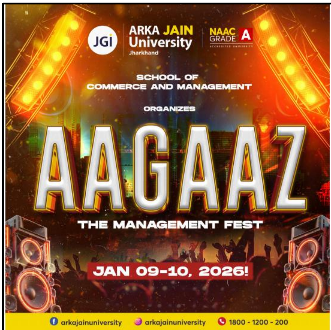
Fig. 1- Poster of the event