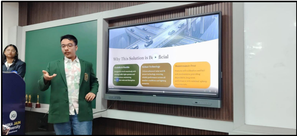
Fig. 2- Participants during the Idea Challenge