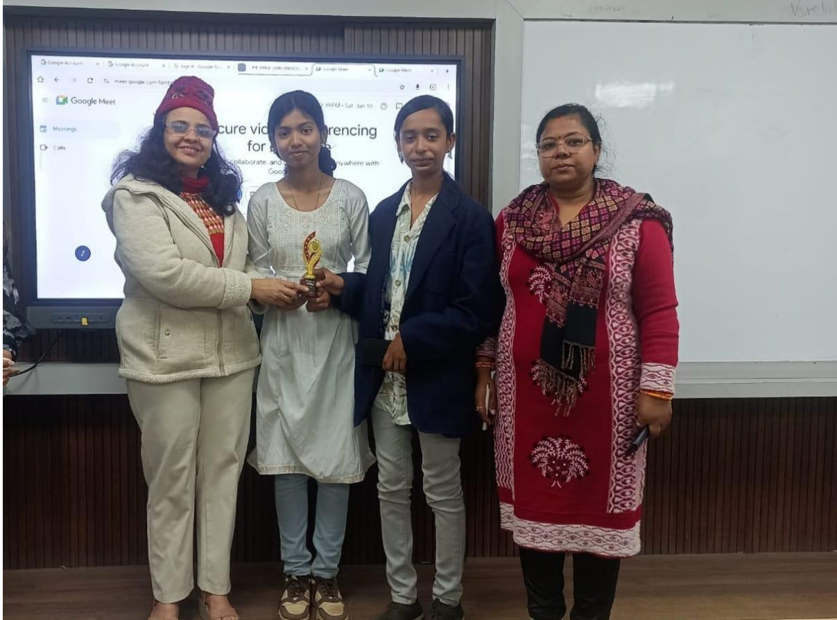
Fig. 4- Runner ups of the event