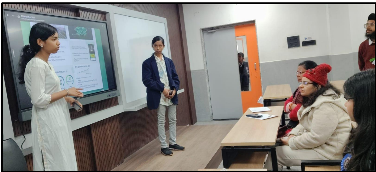
Fig. 3- Participants during the presentation