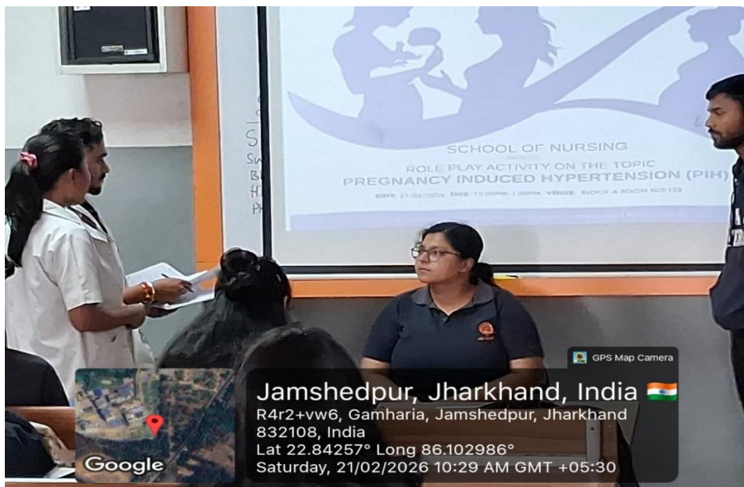
Fig 2: Students Playing act on Pregnancy induced Hypertension