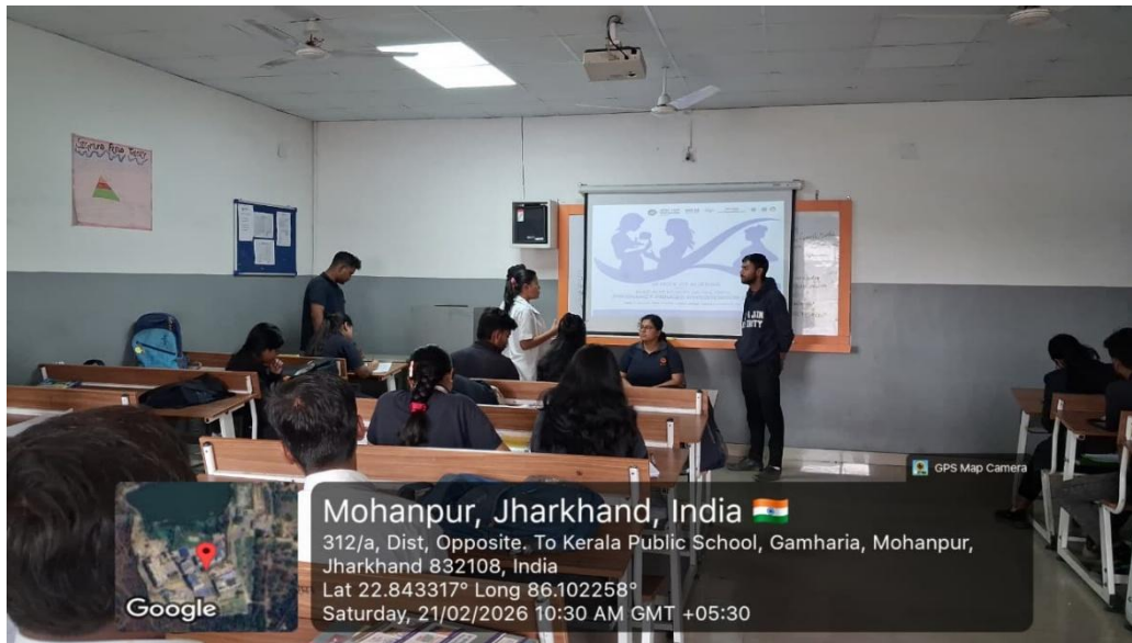
Fig 1: Role play activity by B.Sc. Nursing VII Semester Students