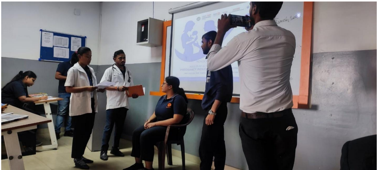
Fig 3: Students act like a doctor,Nurse and patient in pregnancy induced hypertension role play