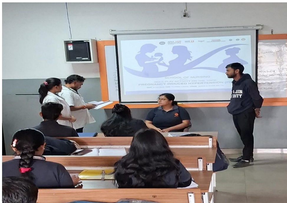
Fig 4: Students are watching role play on Pregnancy Induced Hypertension