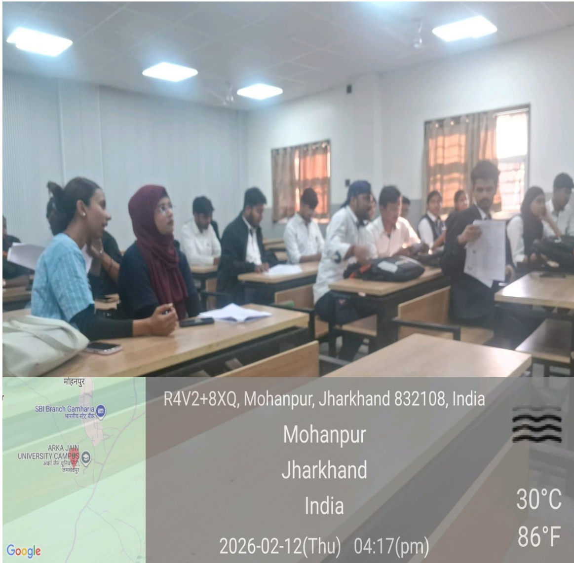
Fig. 1: Students Attending the session