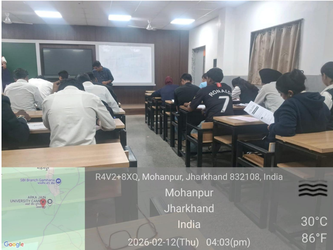
Fig. 2: Students' exam and problem-solving session