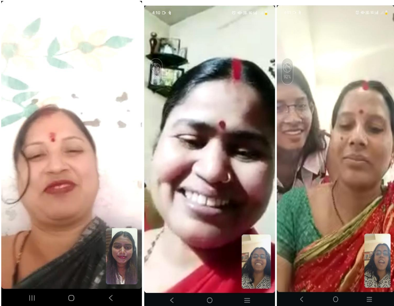
Fig No.1: Mentors are discussing regarding academic and extra curriculum activities with the mentee parents