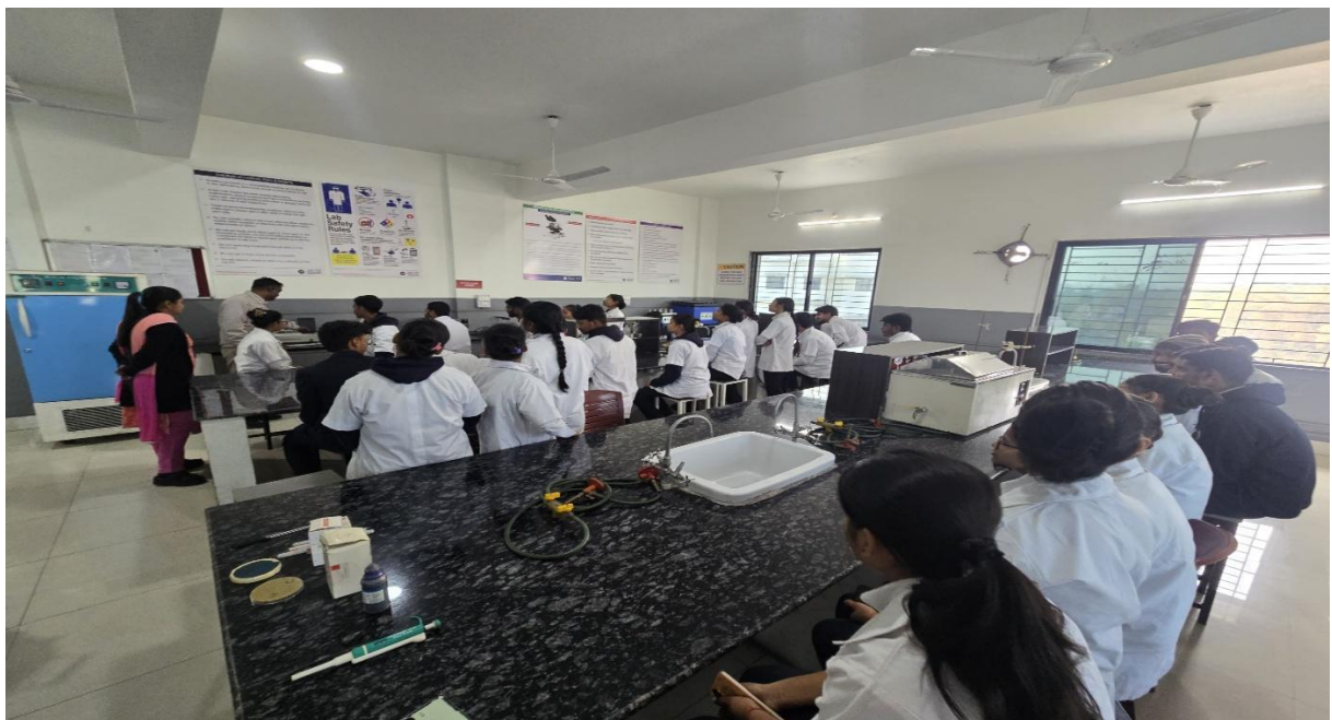
Fig-4:- Hands on practice in the lab