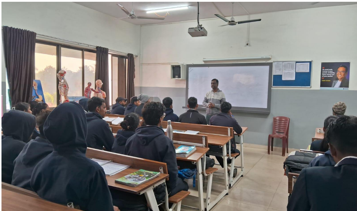
Fig:-6- Taking feedback from the students