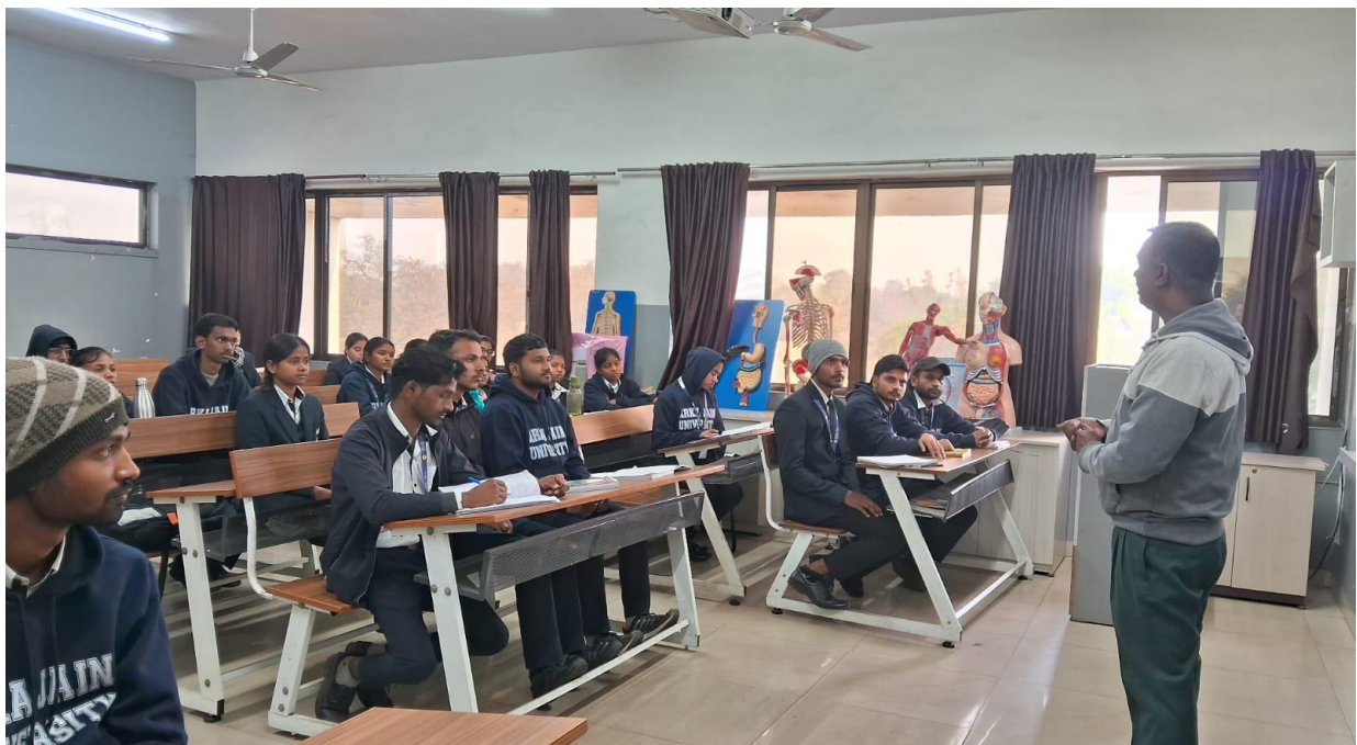
Fig:-2 students actively listening the speaker