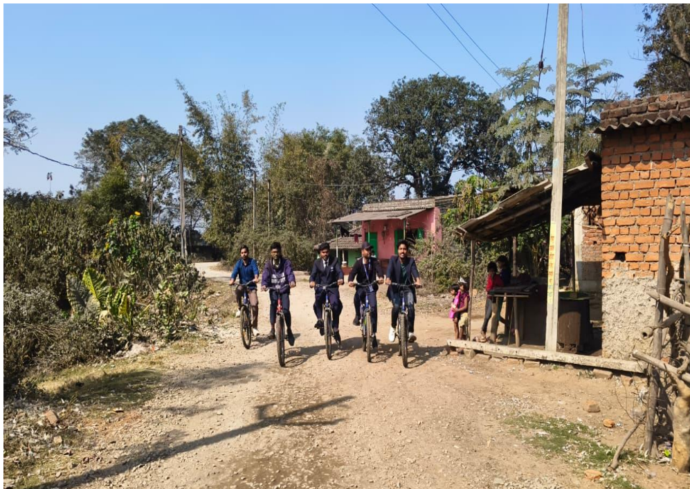
Fig. 2- Students cycling through Gamharia