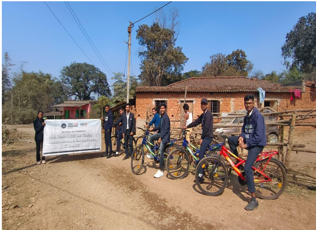
Fig. 4- Students at the streets of Mohanpur village ready for the marathon