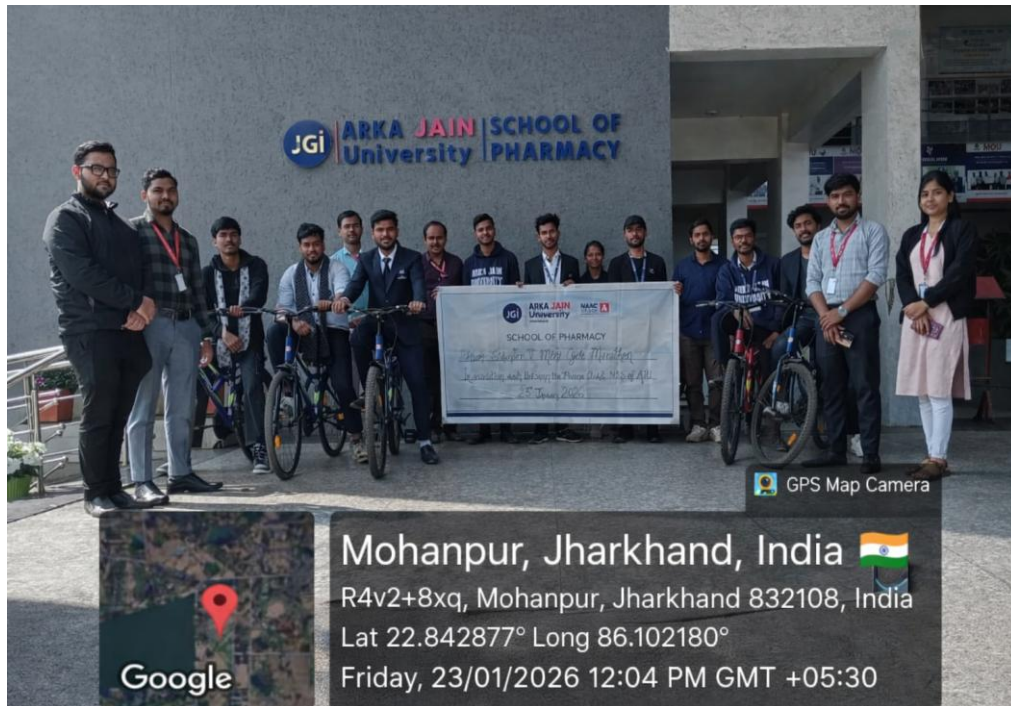
Fig. 1: Participants with Coordinators of the event