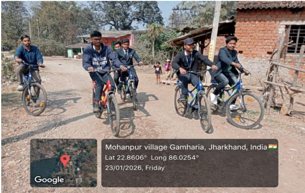
Fig. 3- Students entering the village of Mohanpur