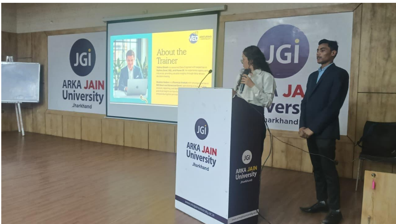
FIG 5: PHOTO of the trainers introducing themselves