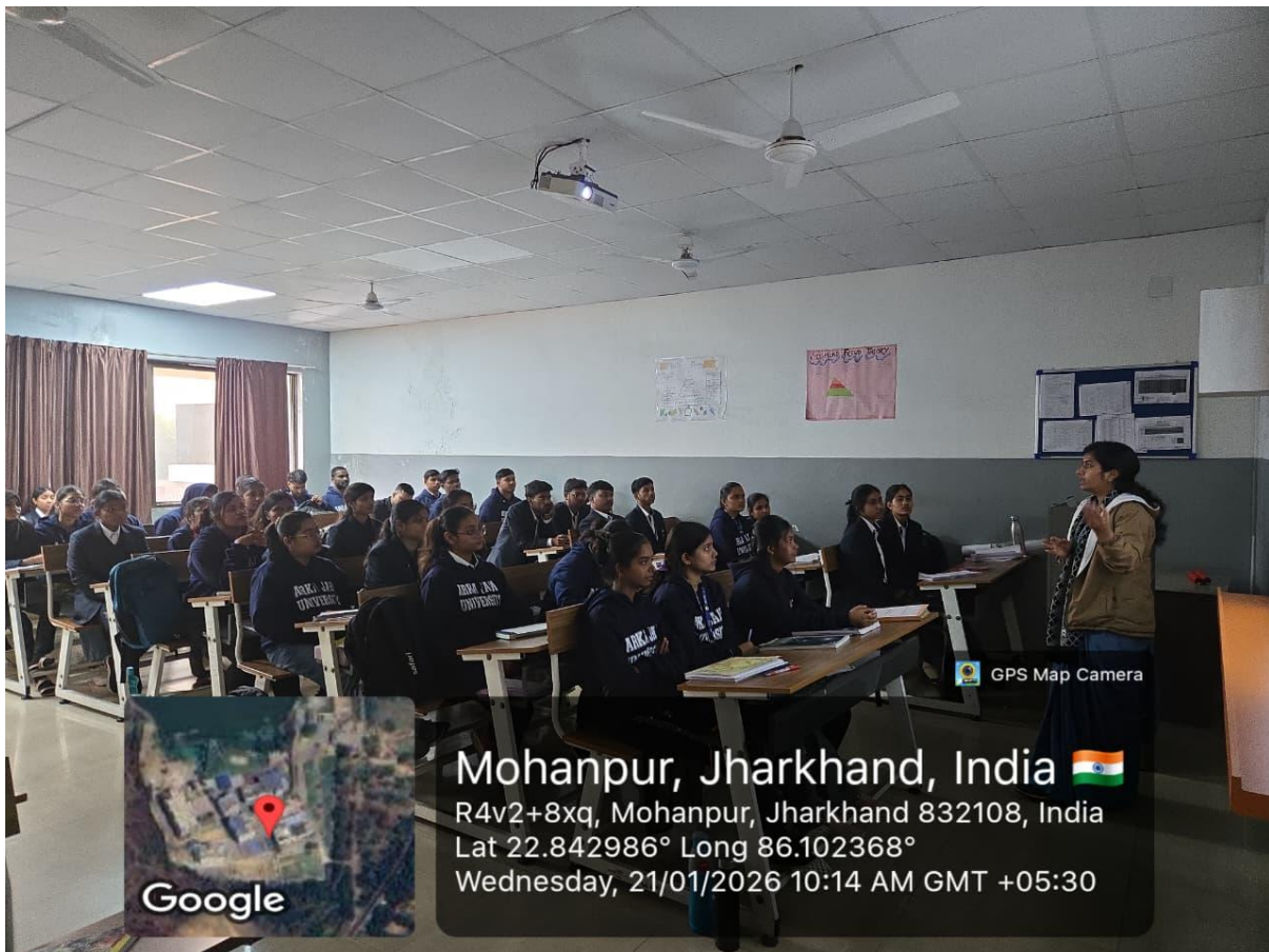
Fig. 6- Participants attending the awareness session.