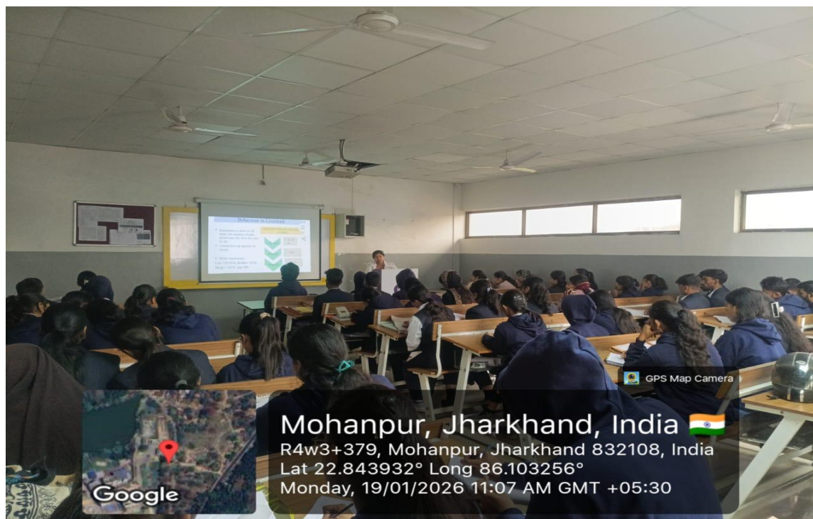
Fig. 2-Participants attending the session.