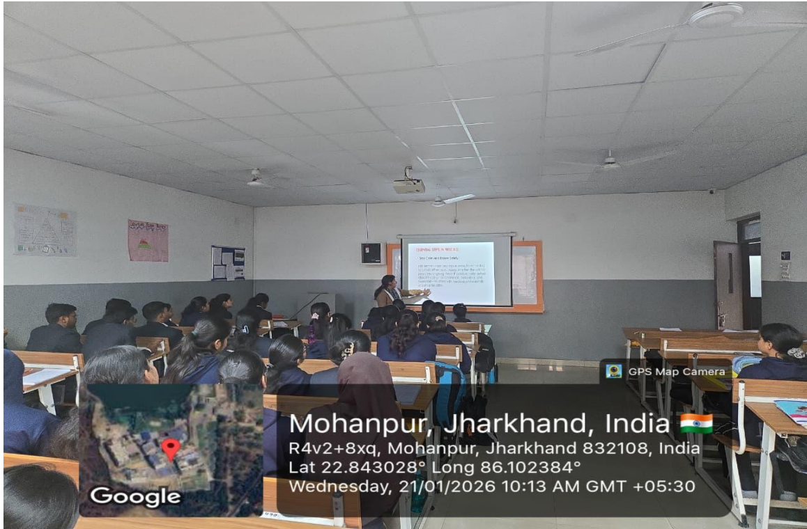
Fig. 5- Session is taking by Ms. Tanushree Dey, Nursing Tutor.