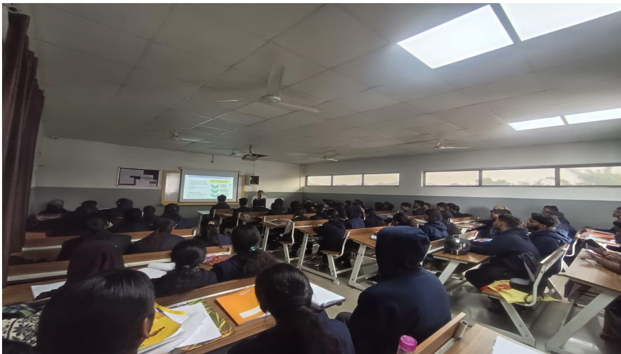
Fig. 4- Participants attending the awareness session.