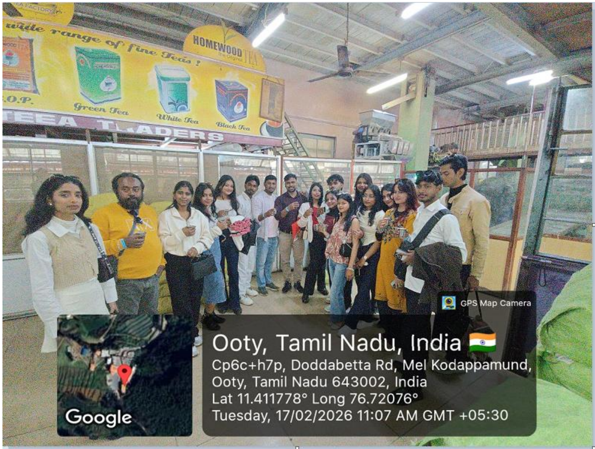
Fig 2: TEA FACTORY VISIT