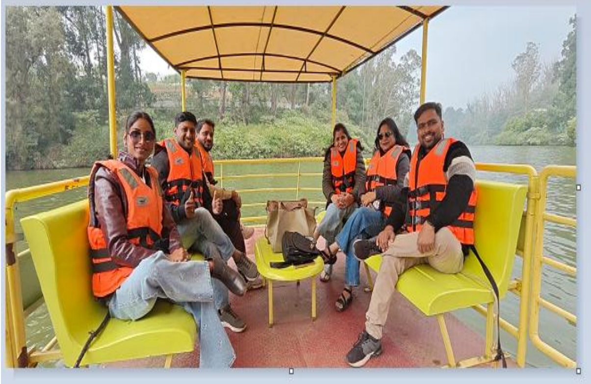
Fig 3. BOATING