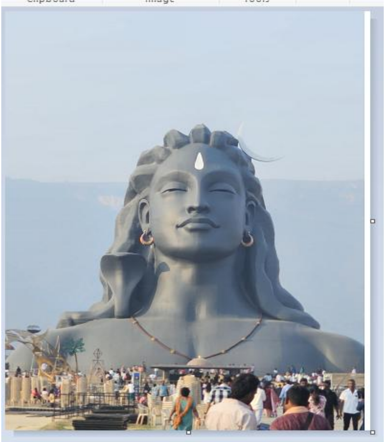
Fig 1: ADIYOGI COIMBATORE