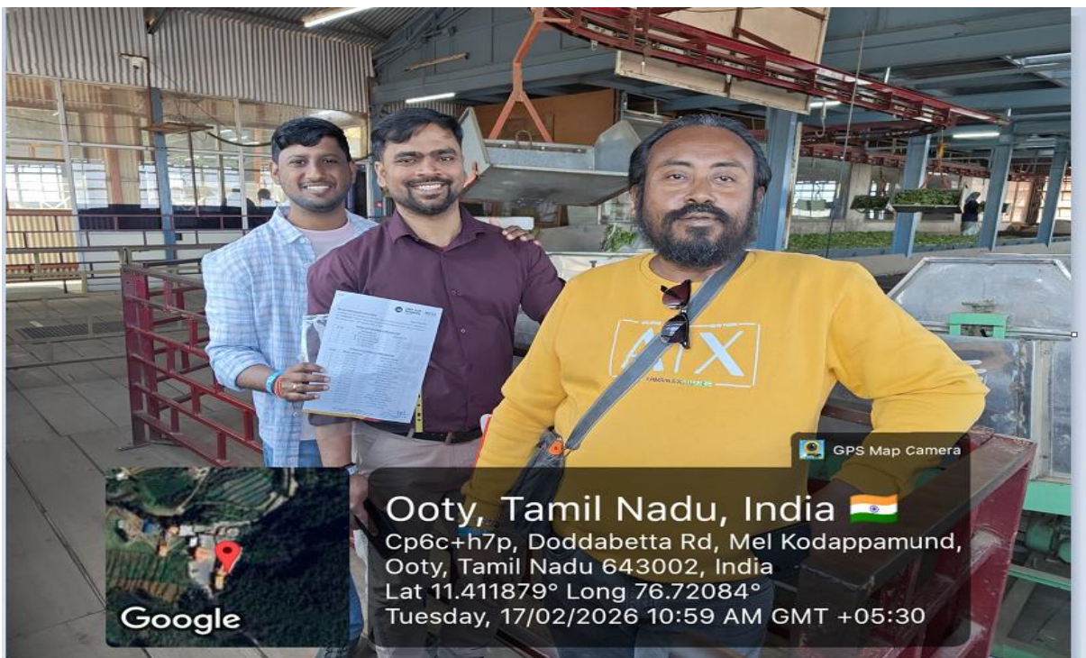
Fig 4: At Mysore Palace