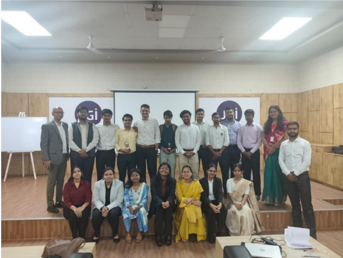
Figure 2: Students participating in plantation drive