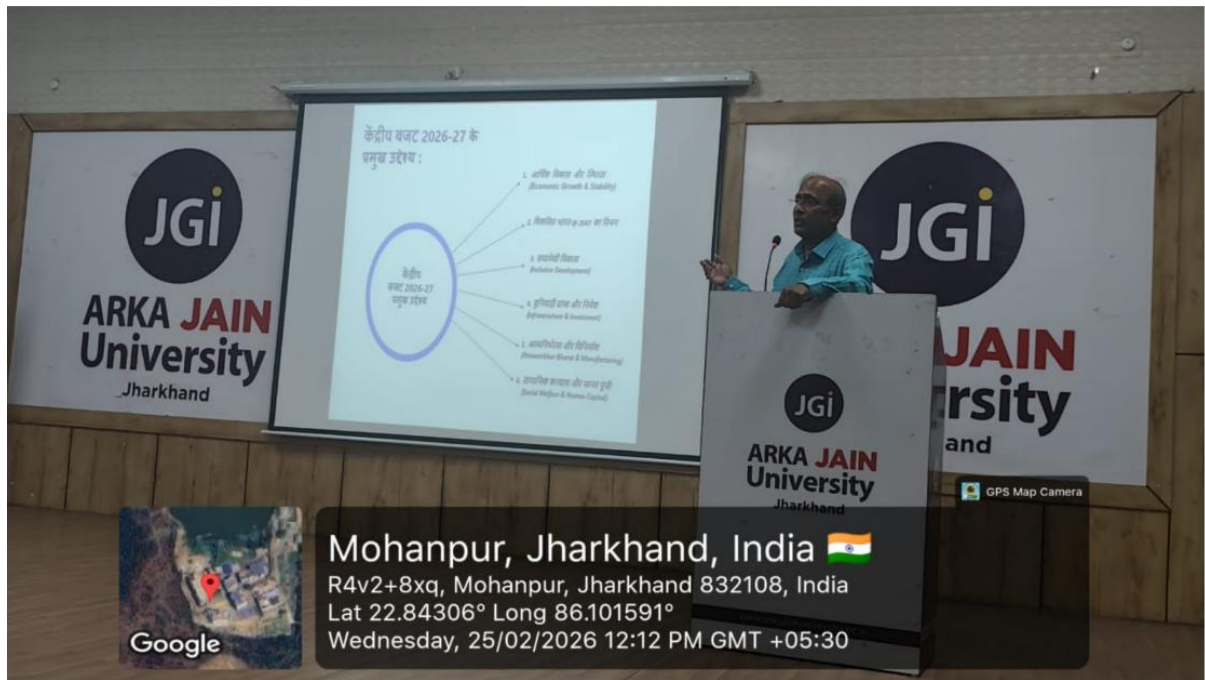
Figure 1: Speech by Guest Speaker