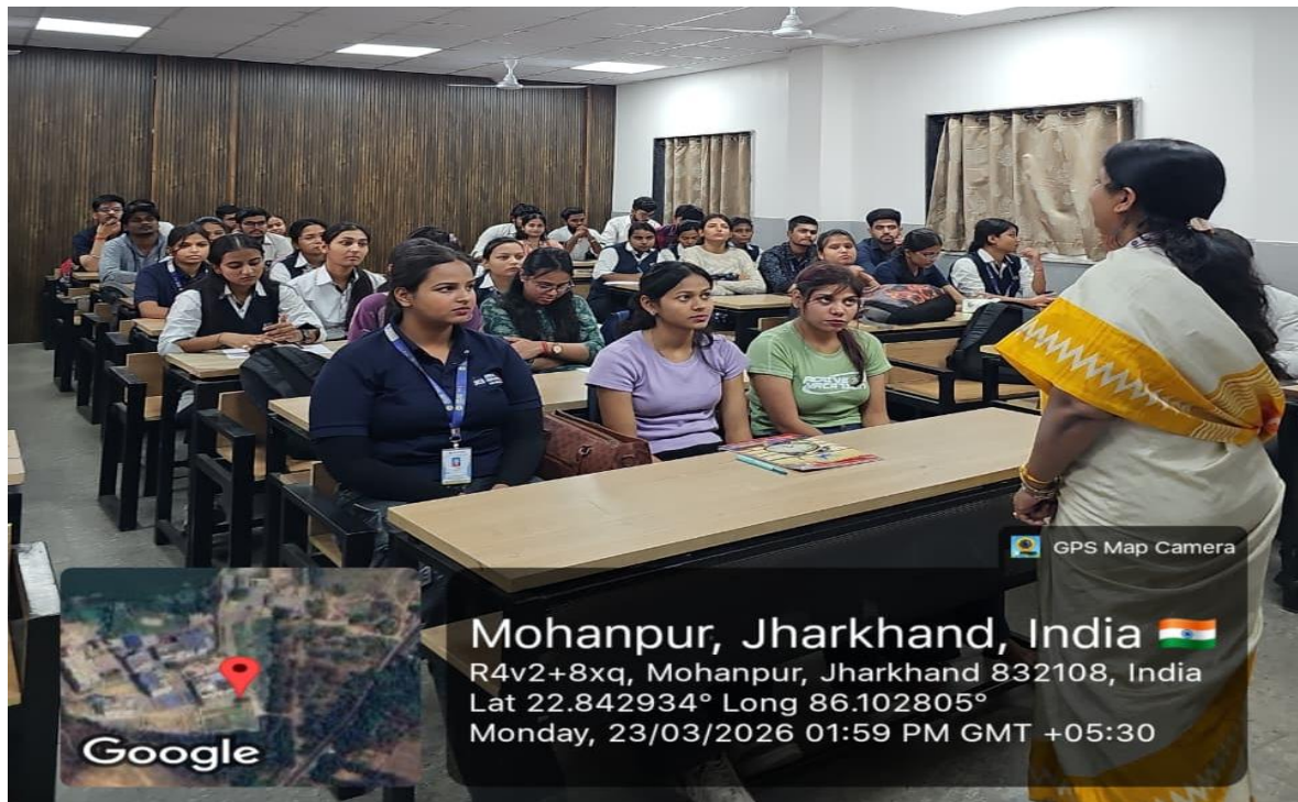
Fig. 1- Asst. Dean (UG) addressing the students during the session