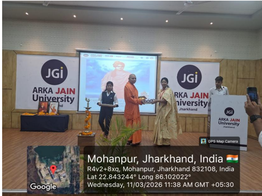
Figure 4: Felicitation of the guest