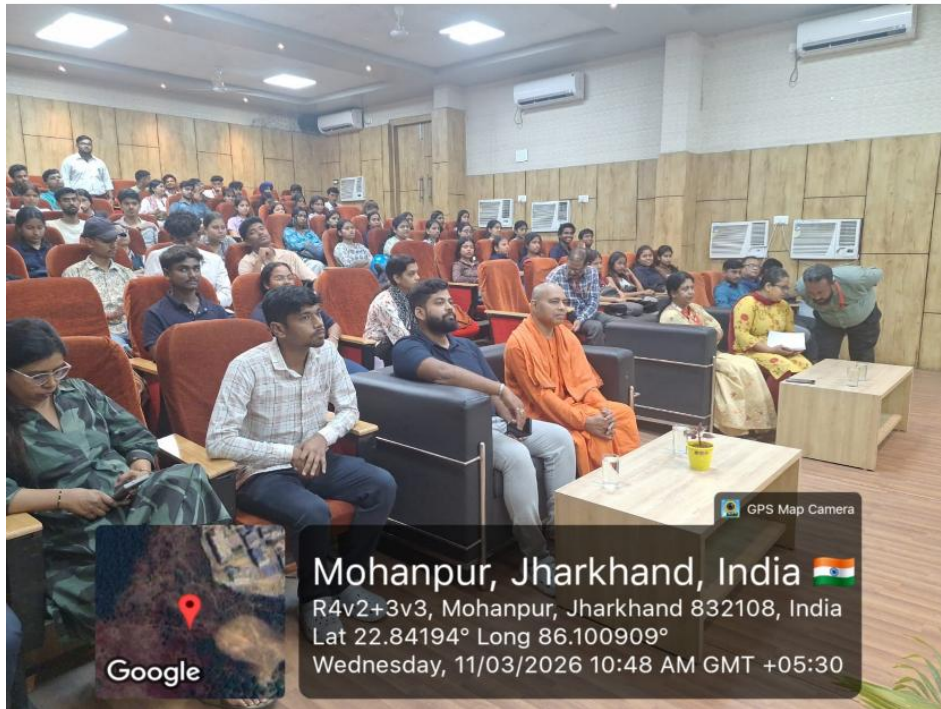
Figure 1: Guest and Audience