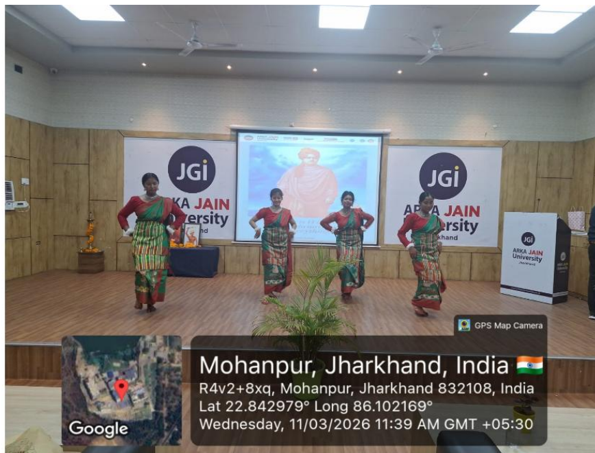
Figure 5: Cultural Dance by Student