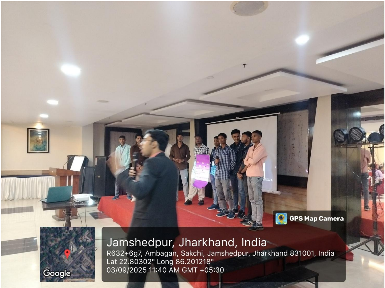
Figure 3: ONE-DAY OUTBOUND TRAINING PROGRAM REDISCOVERING SELF - EXPLORING PERSONA