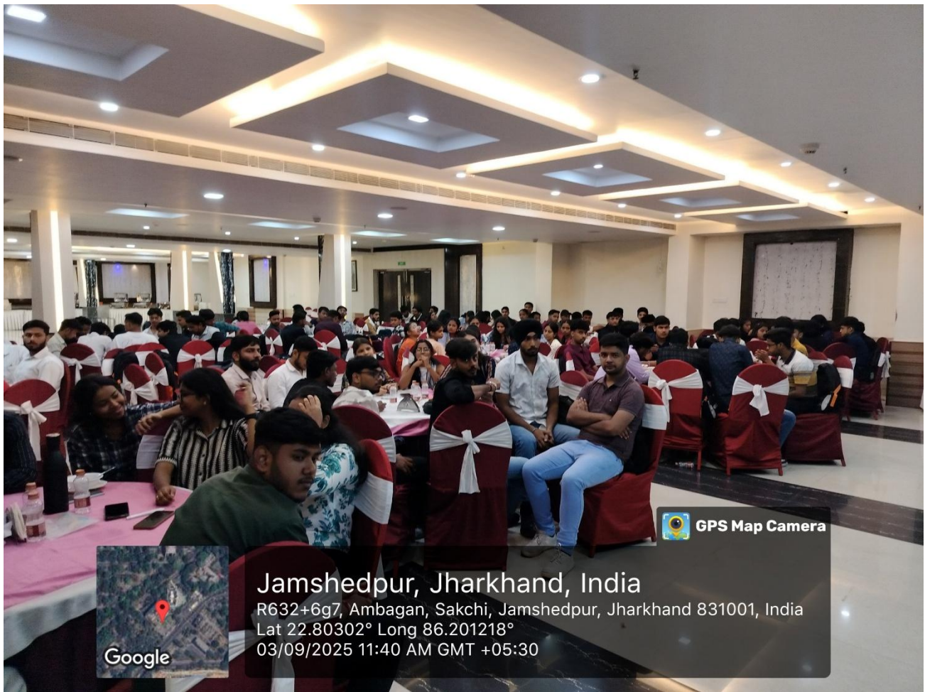
FIGURE 1: ONE-DAY OUTBOUND TRAINING PROGRAM REDISCOVERING SELF - EXPLORING PERSONA