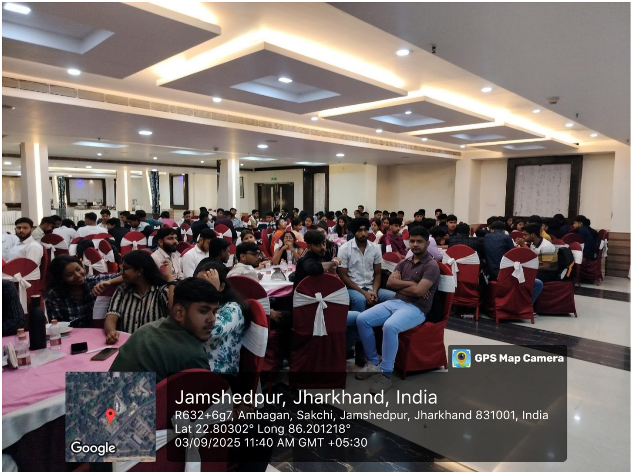
Figure 2: ONE-DAY OUTBOUND TRAINING PROGRAM REDISCOVERING SELF - EXPLORING PERSONA