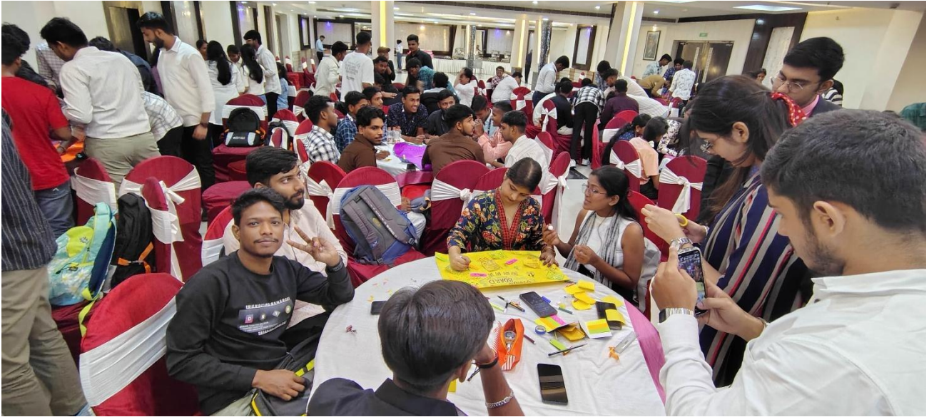
Figure 5: ONE-DAY OUTBOUND TRAINING PROGRAM REDISCOVERING SELF - EXPLORING PERSONA