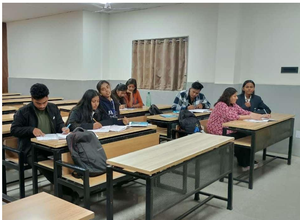
An Essay writing competition on Jharkhand Rajya Sthapana Divas Report on 14.11.2025