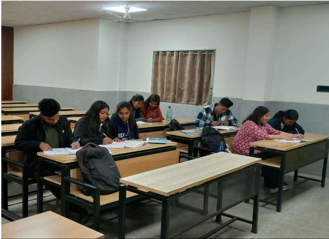
An Essay writing competition on Jharkhand Rajya Sthapana Divas Report on 14.11.2025