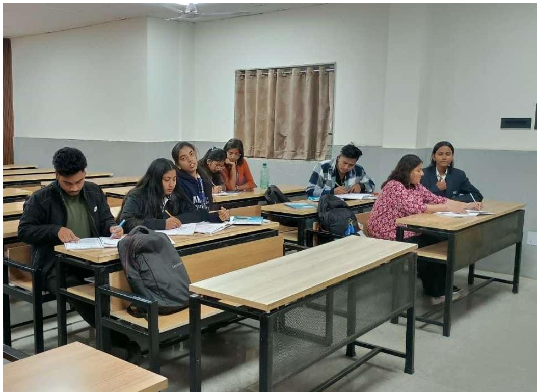
An Essay writing competition on Jharkhand Rajya Sthapana Divas Report on 14.11.2025