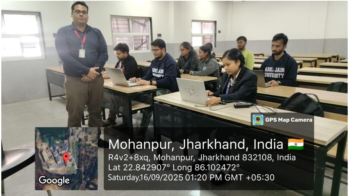
Photo 4: QUIZ COMPETITION ON “PRESERVATION OF THE OZONE LAYER” COLLABORATION WITH THE IT CLUB ON 16TH SEPTEMBER 2025