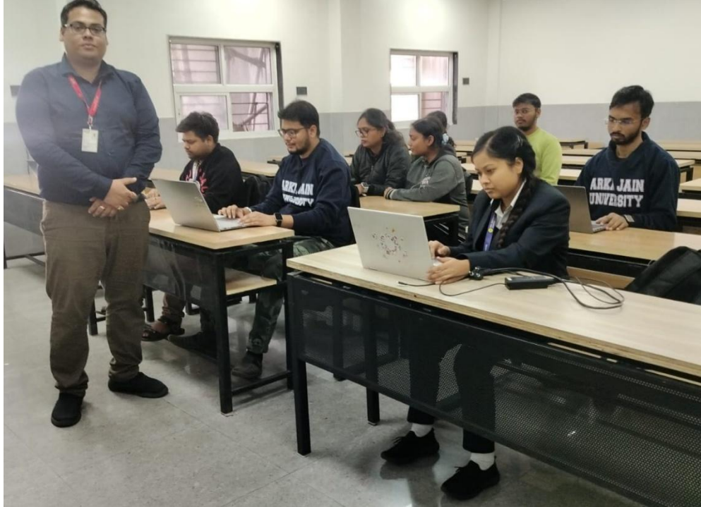
Photo 3: QUIZ COMPETITION ON “PRESERVATION OF THE OZONE LAYER” COLLABORATION WITH THE IT CLUB ON 16TH SEPTEMBER 2025