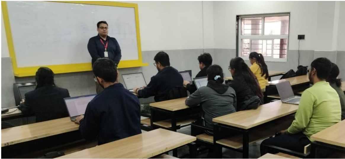
Photo 1: QUIZ COMPETITION ON “PRESERVATION OF THE OZONE LAYER” COLLABORATION WITH THE IT CLUB ON 16TH SEPTEMBER 2025