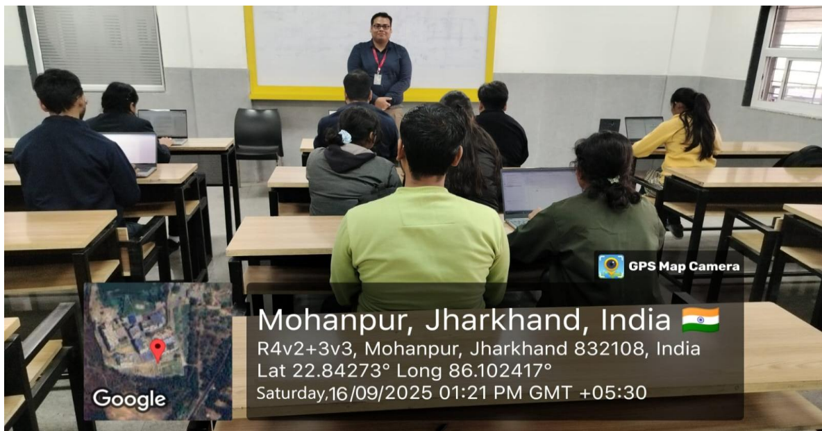
Photo 2: QUIZ COMPETITION ON “PRESERVATION OF THE OZONE LAYER” COLLABORATION WITH THE IT CLUB ON 16TH SEPTEMBER 2025