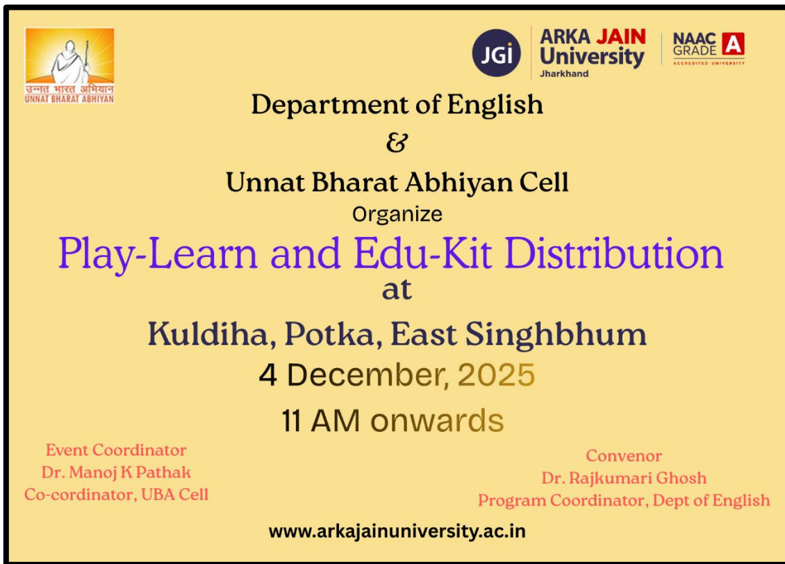
Fig.1- Poster of the Event