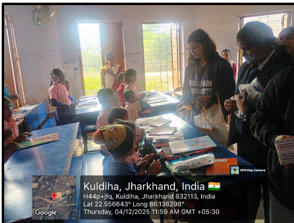
Fig.3- Distribution of Edu-kit by the UBA Cell volunteers