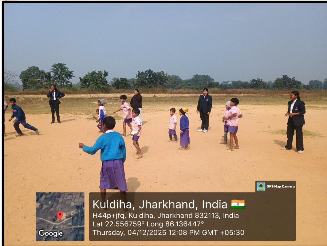
Fig.5- School kids of Kuldiha playing with AJU students