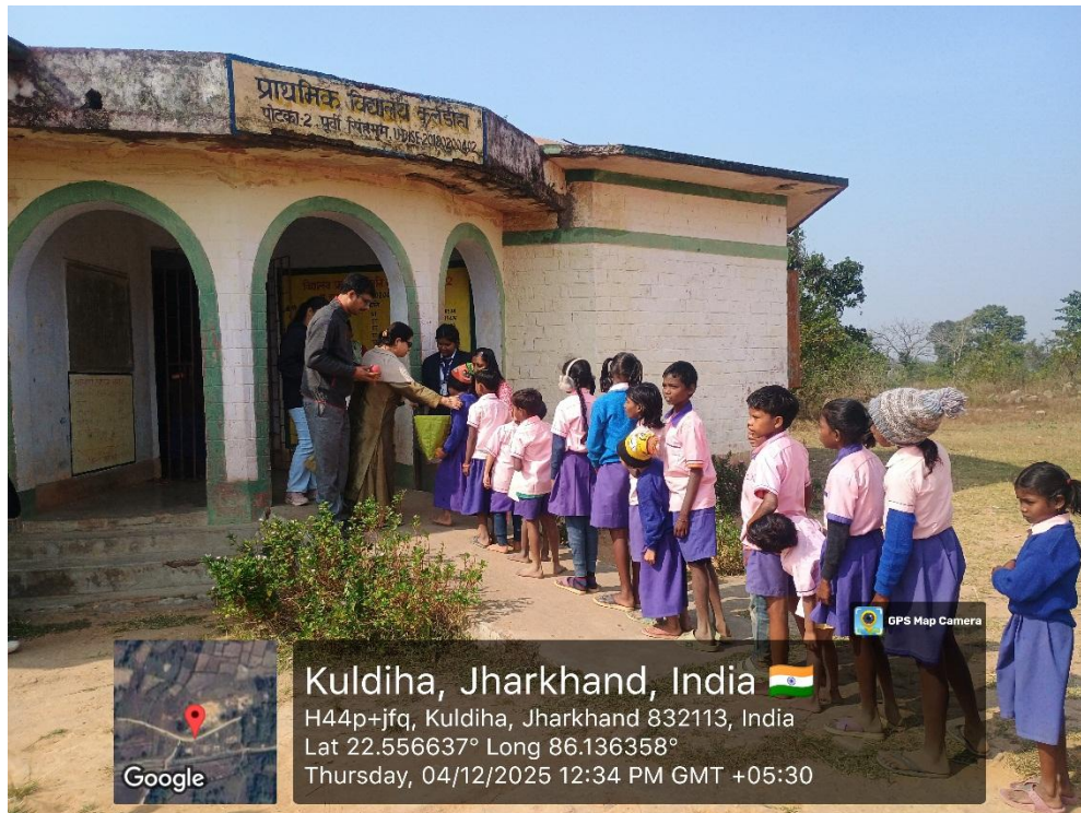
Fig.6- Kuldiha Primary School Kids taking fruits from UBA volunteers