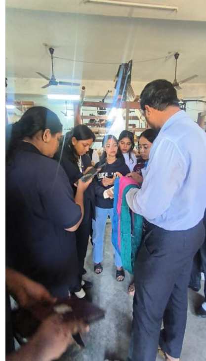
Fig 4. Dyed Yarn