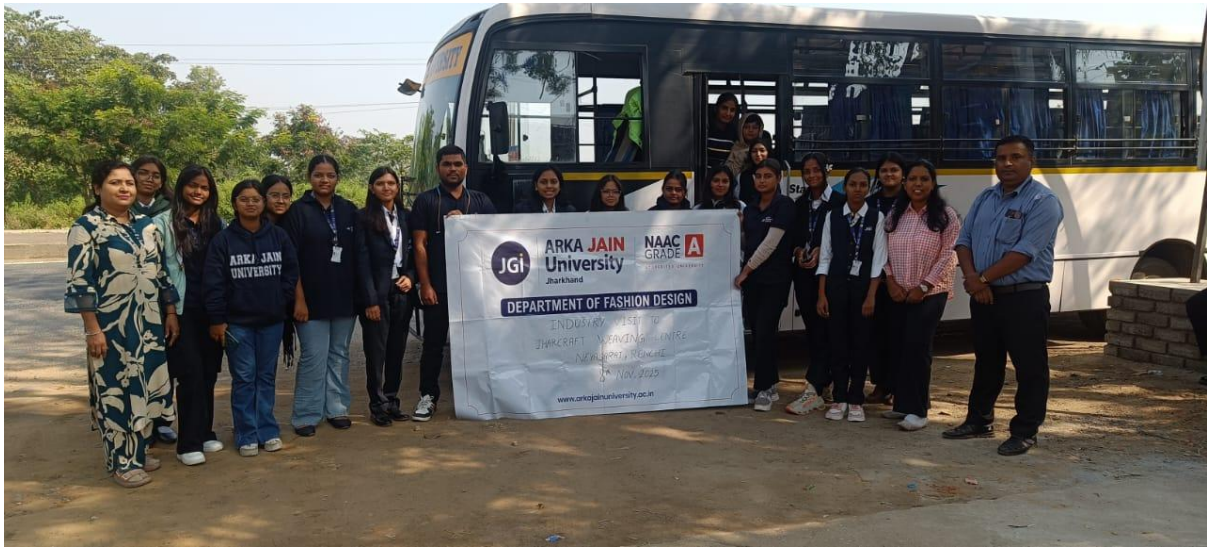
Fig 1. Ready to go for Industry Visit to Jharcraft weaving centre