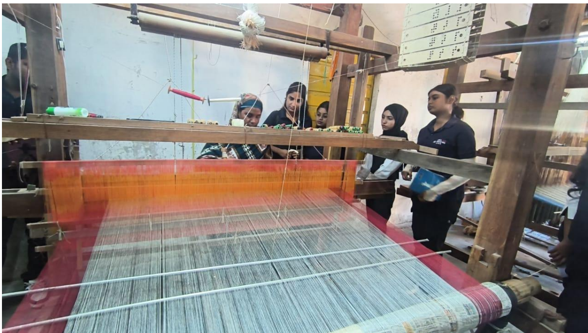
Fig 7. Student observed the process of weaving on handloom