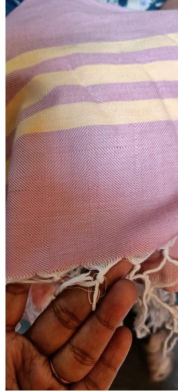
Fig 11 & 12. Final Product made through Handloom