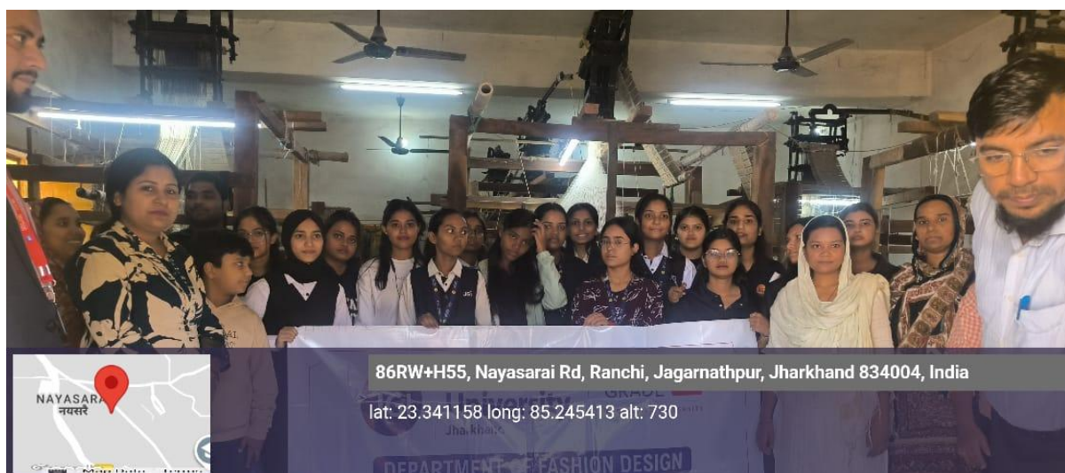
Fig 14. Group photo of students with faculties