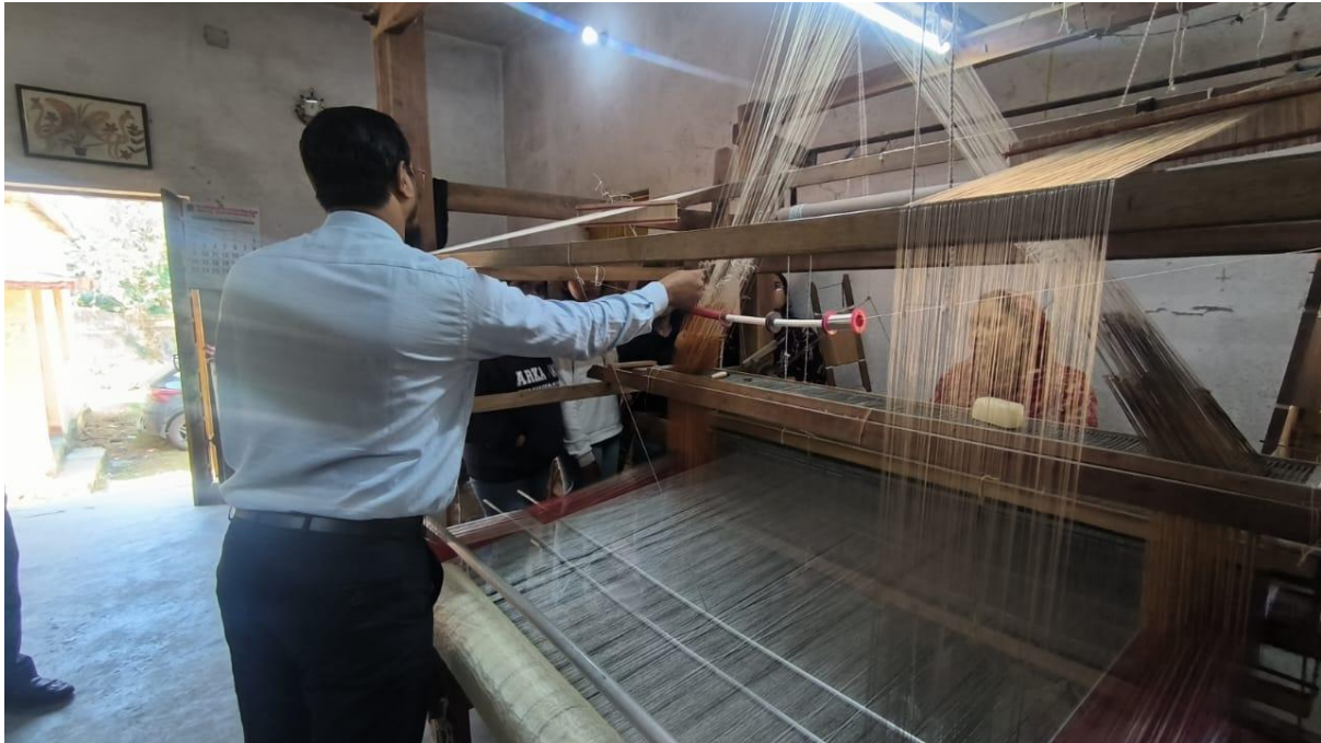
Fig 6. Demonstration about thread count by the Officer