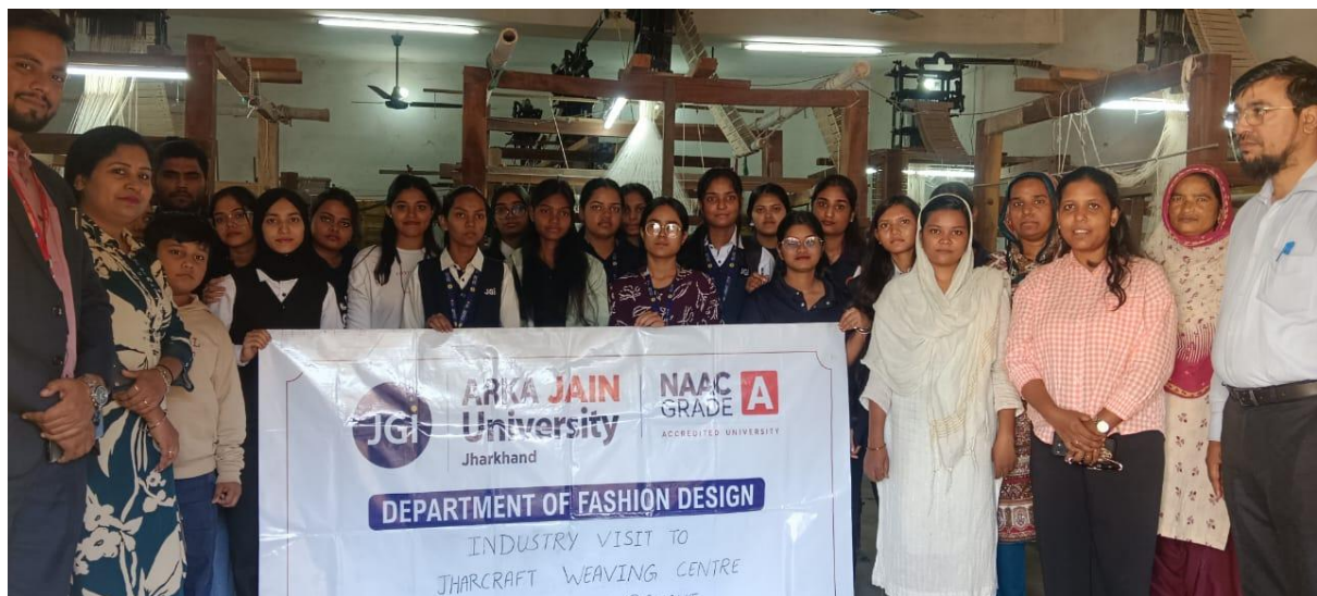
Fig 13. Group photo of students with faculties