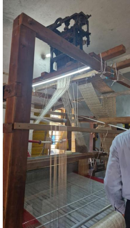
Fig 7, 8 & 9. Thread beam Preparation according to width & accurate thread count