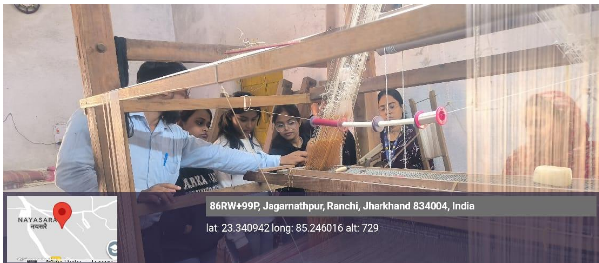
Fig 5. Demonstration about handloom by the Officer