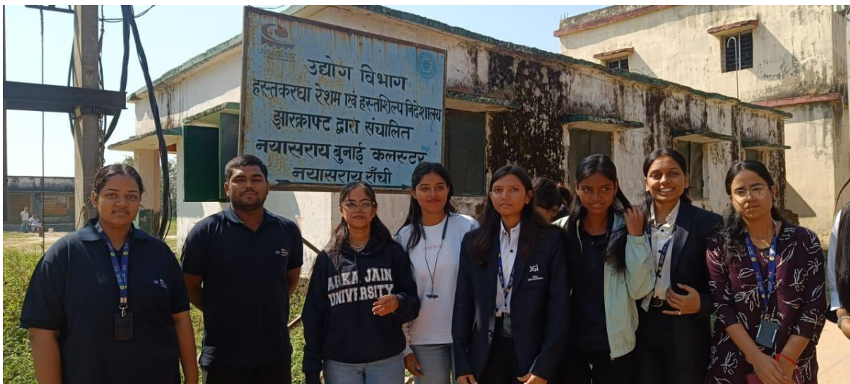
Fig 2. Student at Jharcraft weaving centre, Neyasarai