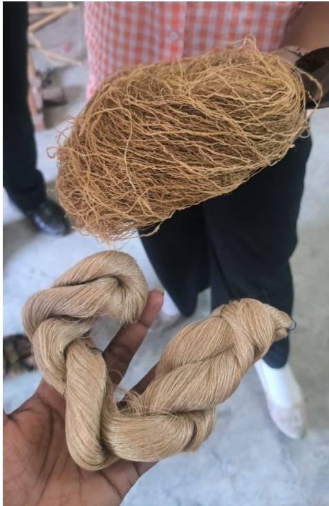
Fig 3. Silk Yarn