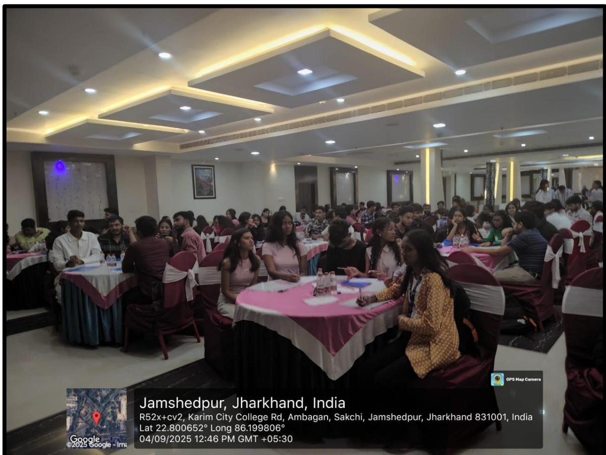
Fig. 3 Attendees of the Outbound Training Program during a team activity