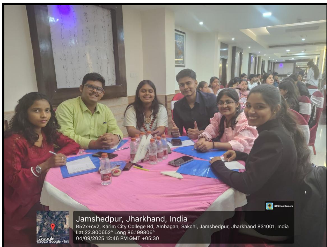
Fig. 5 Students in group working on craft work