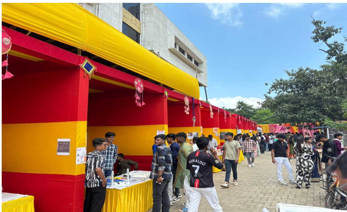
Fig 3: Food Stalls during NAVOTSAV'25