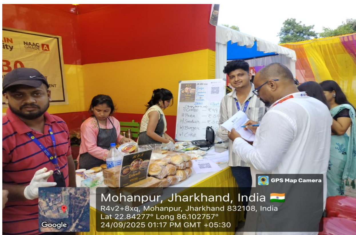
Fig 4: Judgement of Food Stalls during NAVOTSAV'25