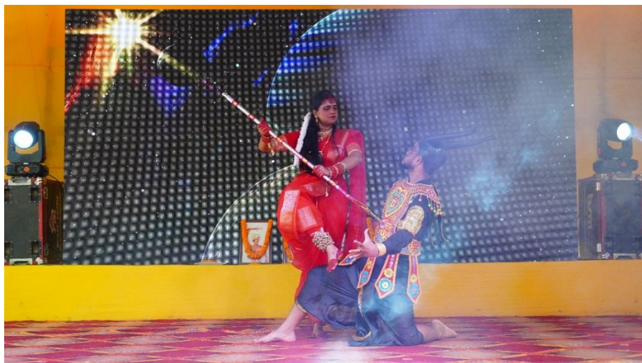
Fig 7. Dance drama on Durga