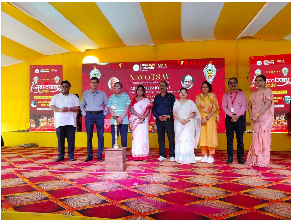
Fig 1. Inaugural lamp lighting of ARKA Literary Fest, Navras