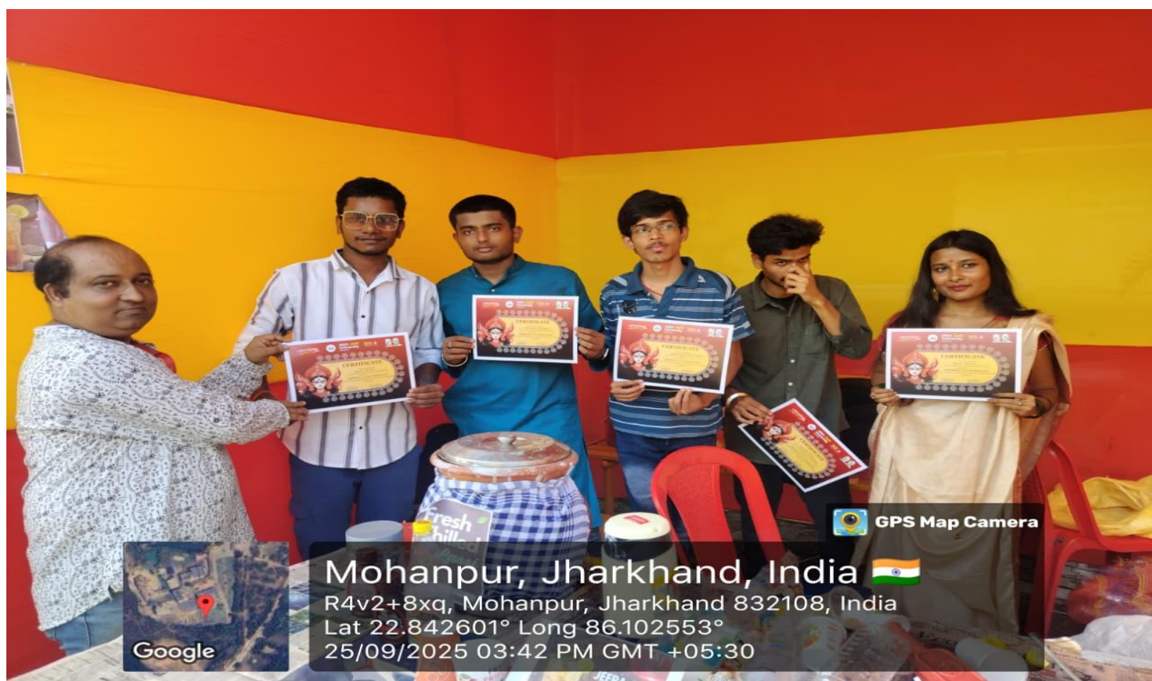
Fig 5: Certificates to the winners of Food stall during NAVOTSAV'25