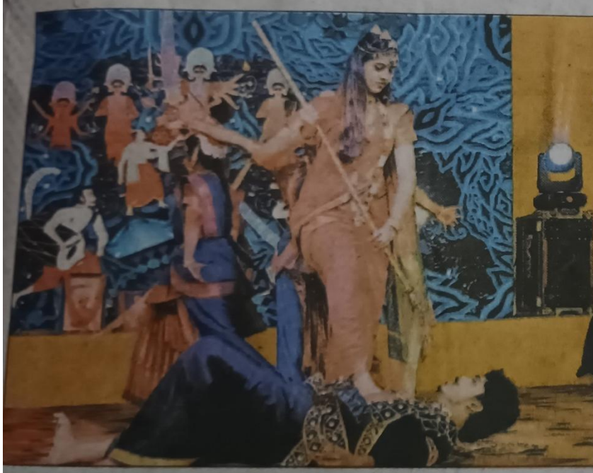
अरका जैन विश्वविद्यालय में आयोजित नवोत्सव में प्रस्तुति देती छात्राएं।