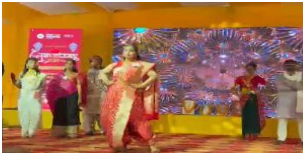
Fig 2: Fashion walk on Devi Durga costume