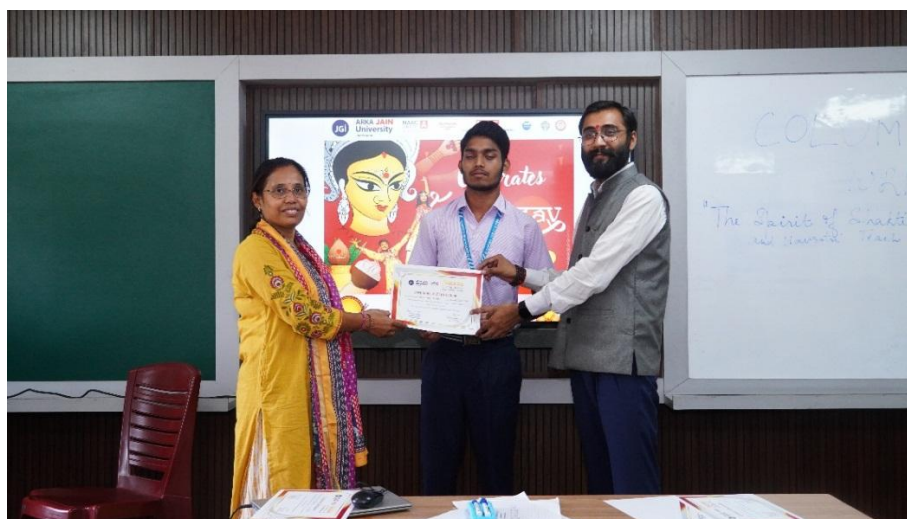
Fig 8: Winner of Column Writing