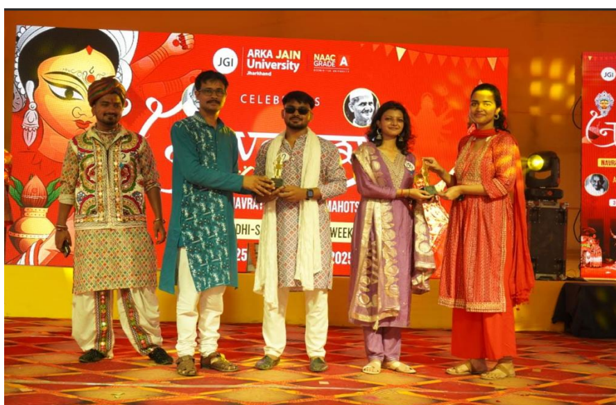
Fig 9. Winner of Traditional Fashion Walk Competition