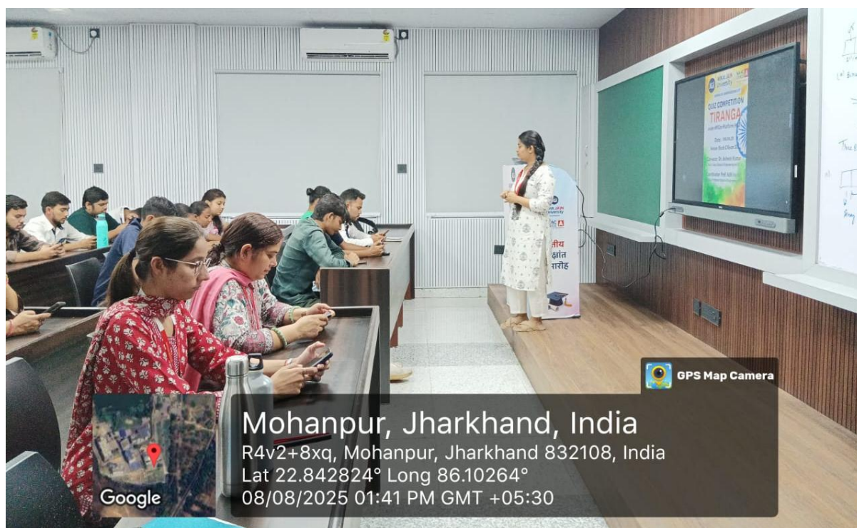
Fig. 2- Students and faculties equally participated in the quiz competition.