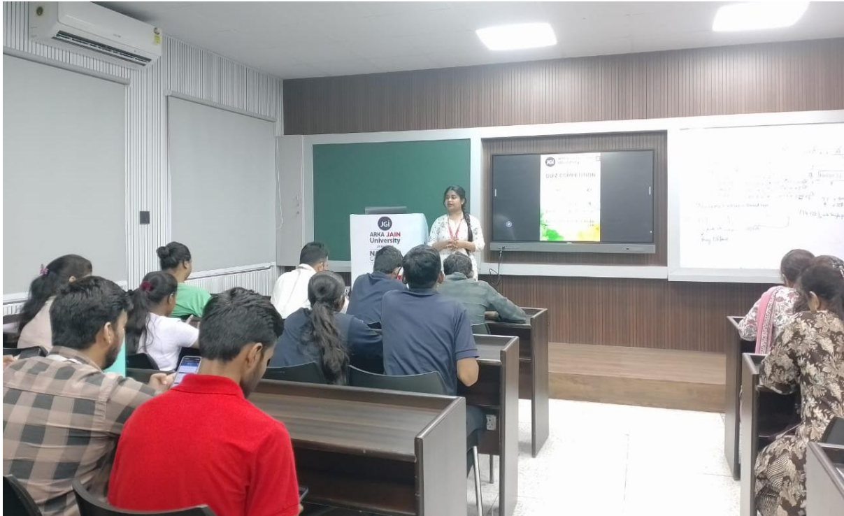
Fig. 3 – Participants enthusiastically solving the quiz.