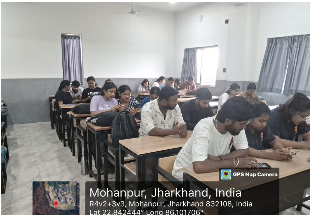
Fig. 4 – Participants enthusiastically solving the quiz.