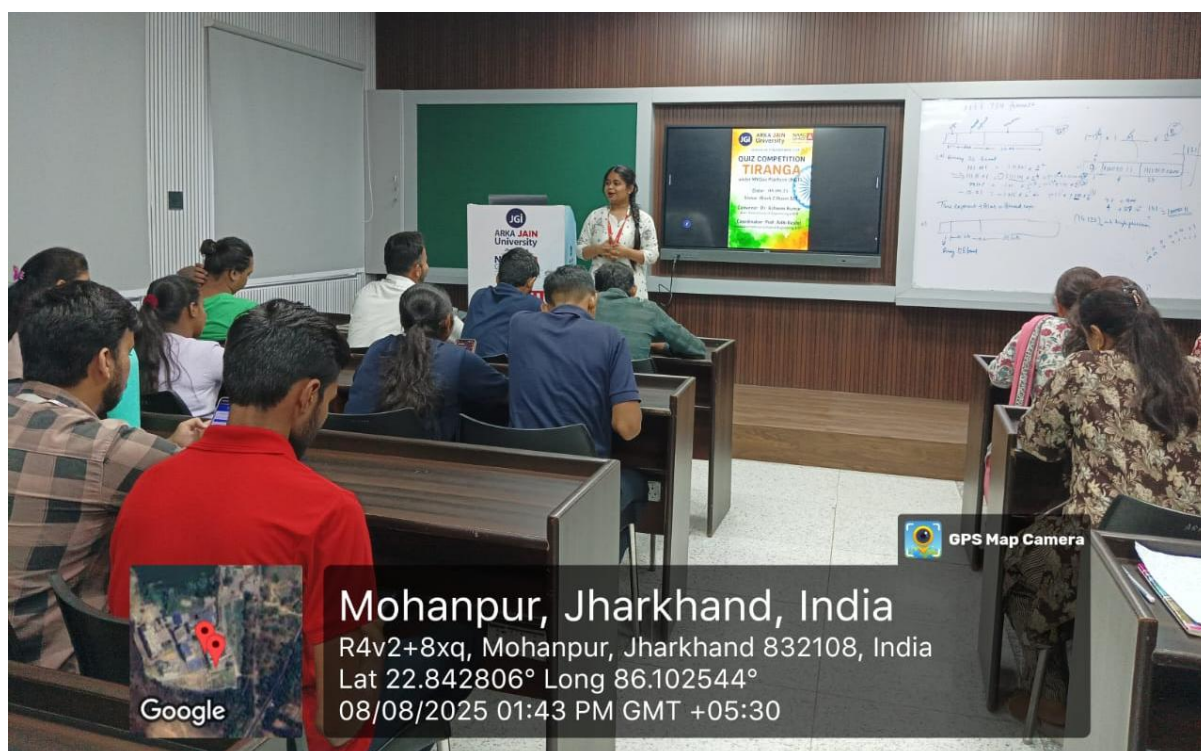
Fig.1- Event Co-Ordinator giving instructions related to the quiz.