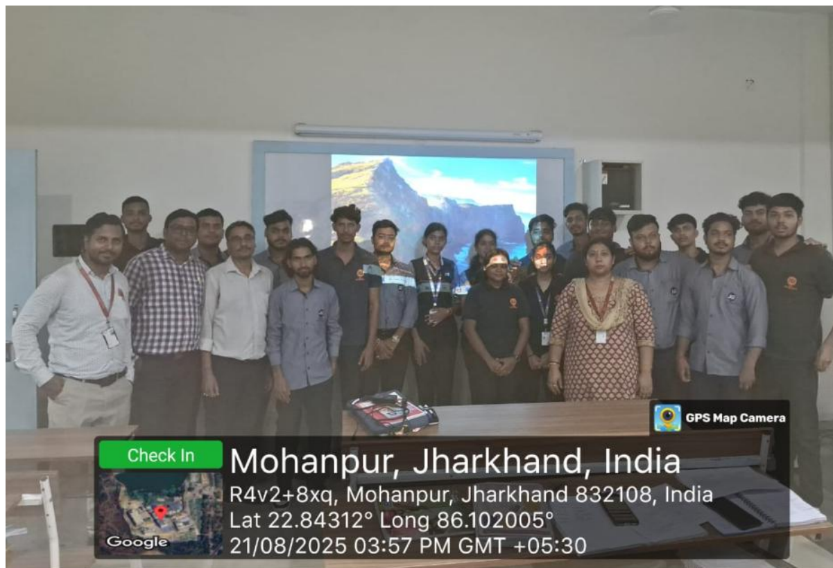
Fig.1- Celebration of World Entrepreneurs Day