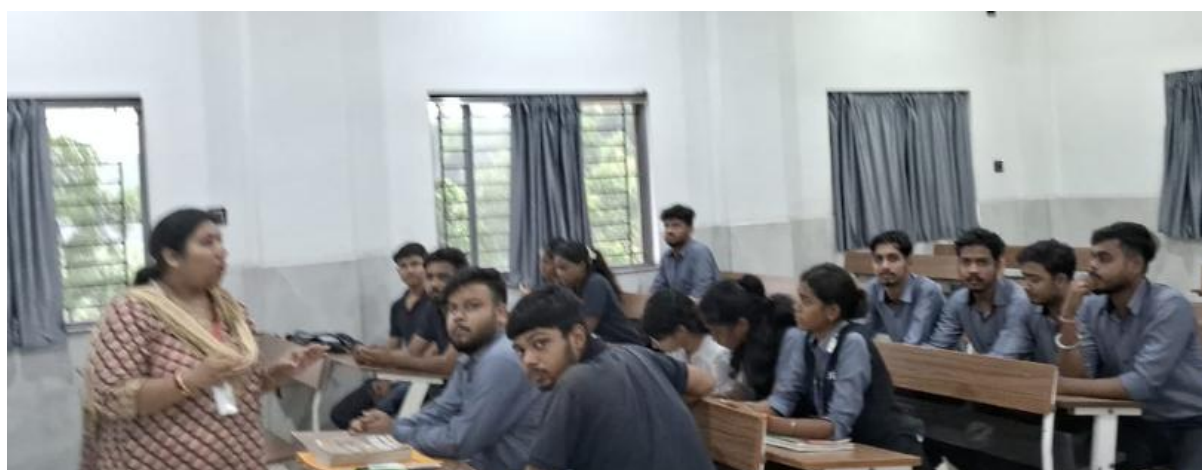
Fig. 2-Discussion about the rule of the Quiz competition on World Entrepreneurs Da