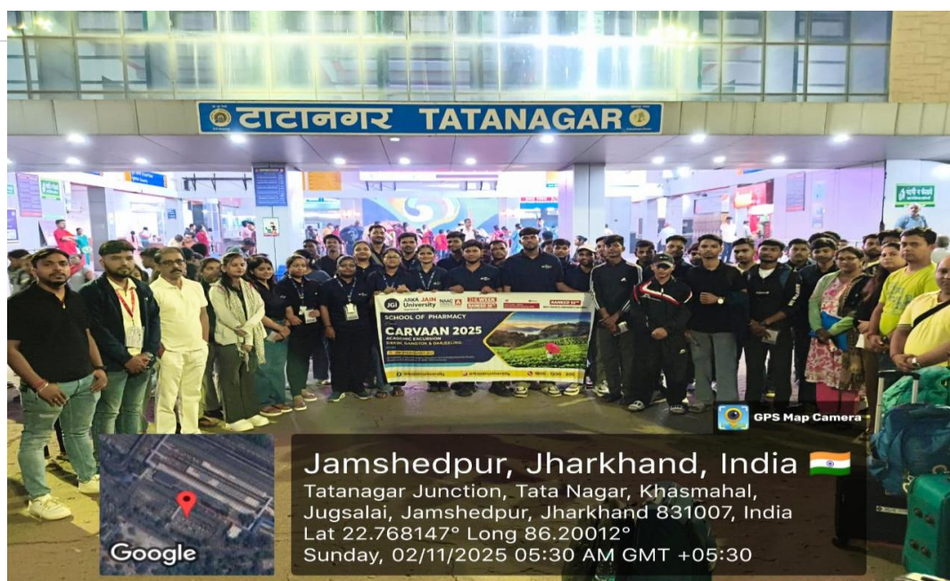
Fig.1- Students and Faculties started their journey from Tata Nagar Railway station