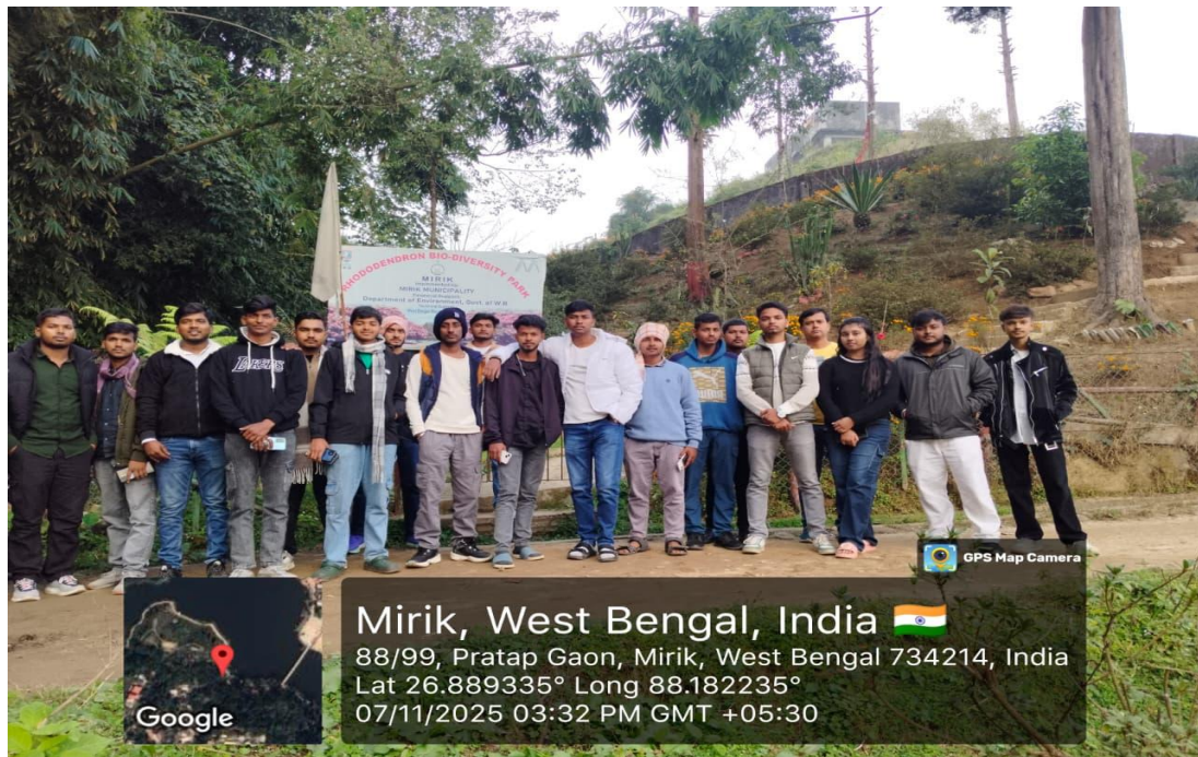
Fig.5- Students exploring the rich flora of Mirik Biodiversity Park.