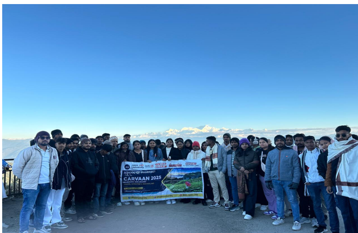
Fig.12- Students enjoying the breathtaking view of Kanchenjunga, the third-highest Mountain in the world.