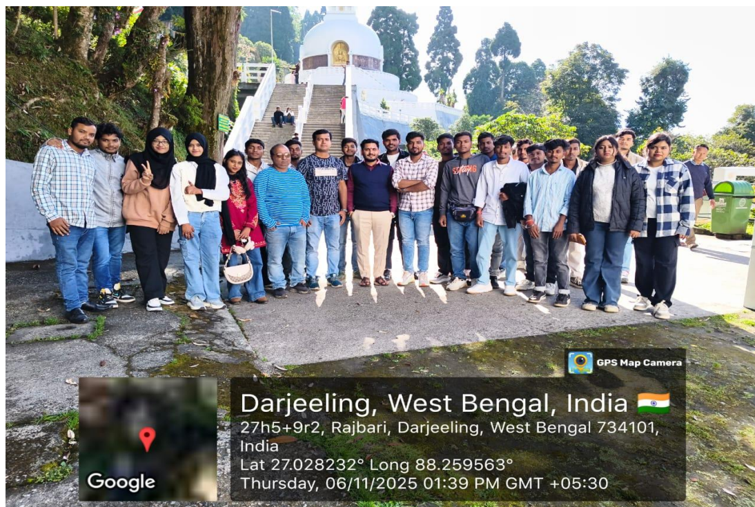
Fig.6-A serene visit to the Peace Pagoda.