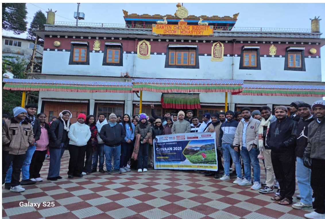
Fig.11- A cultural and educational visit to the monastery.