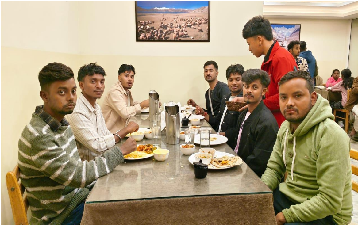
Fig.9- Students enjoying dinner during the excursion.