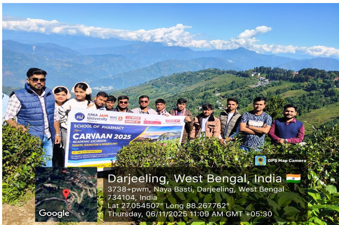
Fig.4-Experiencing the beauty of Darjeeling's tea plantations.