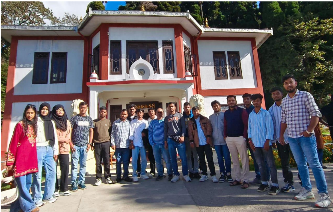
Fig.10- Students experiencing cultural heritage at the Japanese Temple.