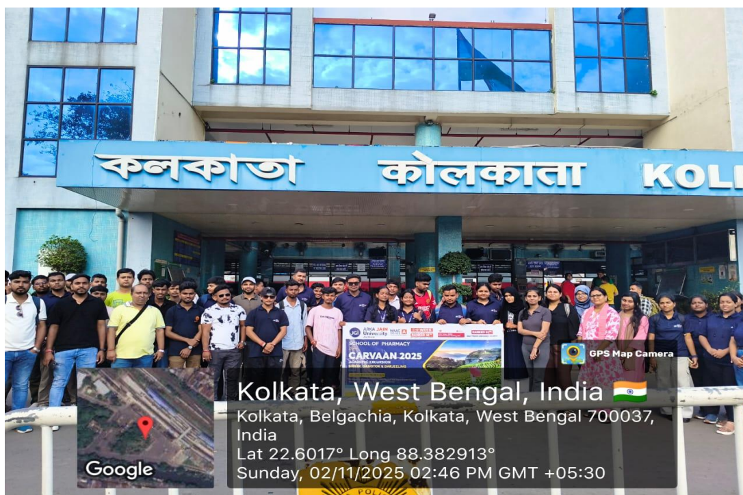
Fig.2- Students and faculty arrive at Kolkata Railway Station to begin the excursion.