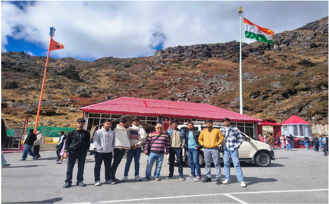
Fig.7- Exploring the heritage site: Baba Harbajan Singh Temple.