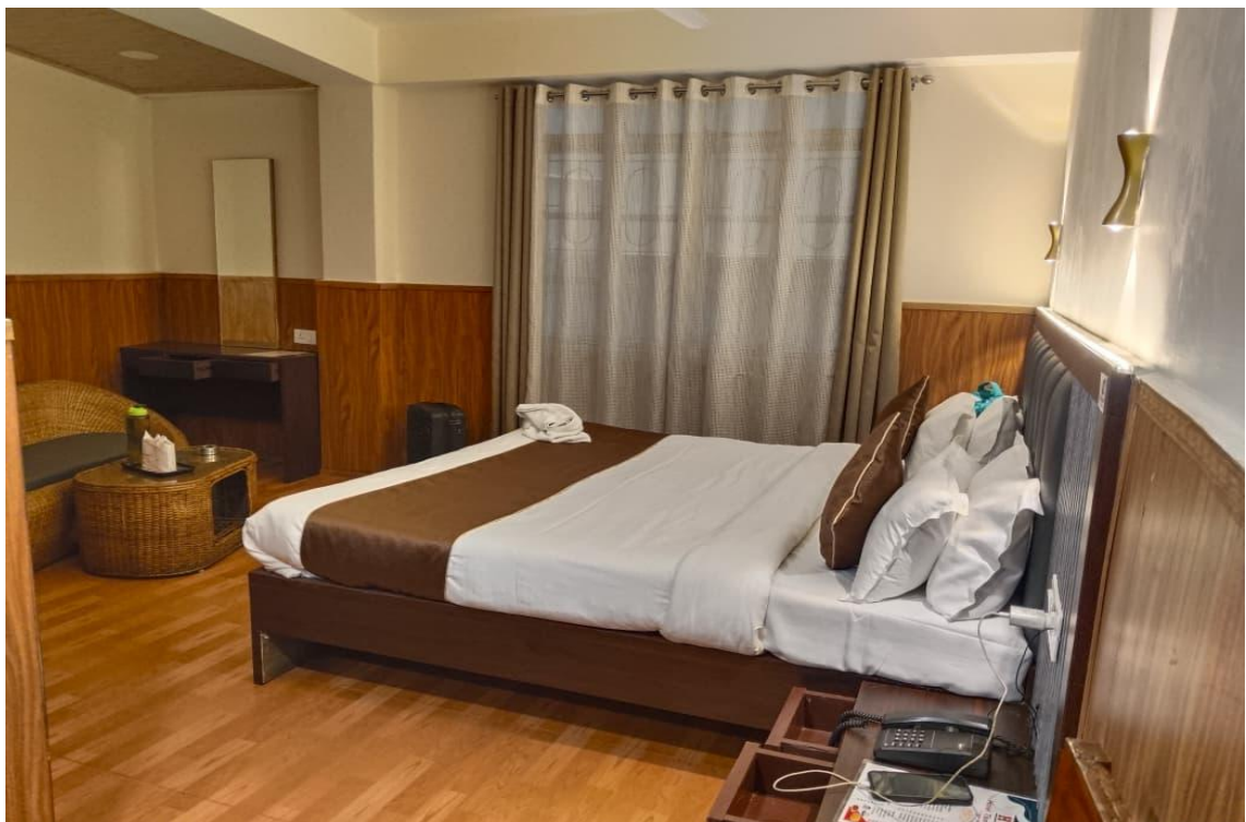
Fig 8-Students provided accommodation at Gangtok,Sikkim