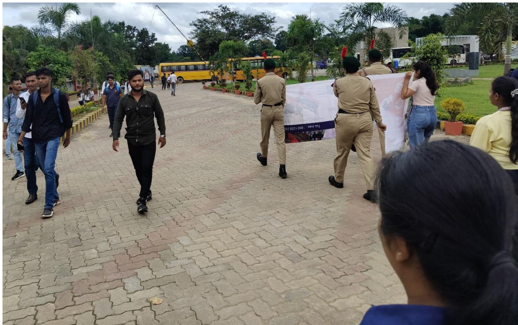
Fig. 6, The march served as a symbolic effort to spread the message of unity, dignity, and zero tolerance towards ragging.