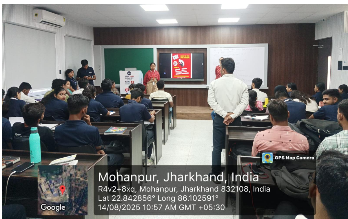
Fig. 2, session was conducted on "Seniors as Mentors: Building a Ragging-Free Environment"