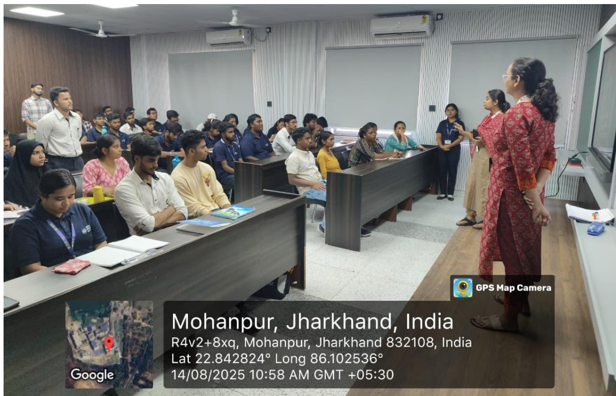
Fig. 4, Faculty spreading the message of a ragging-free campus.