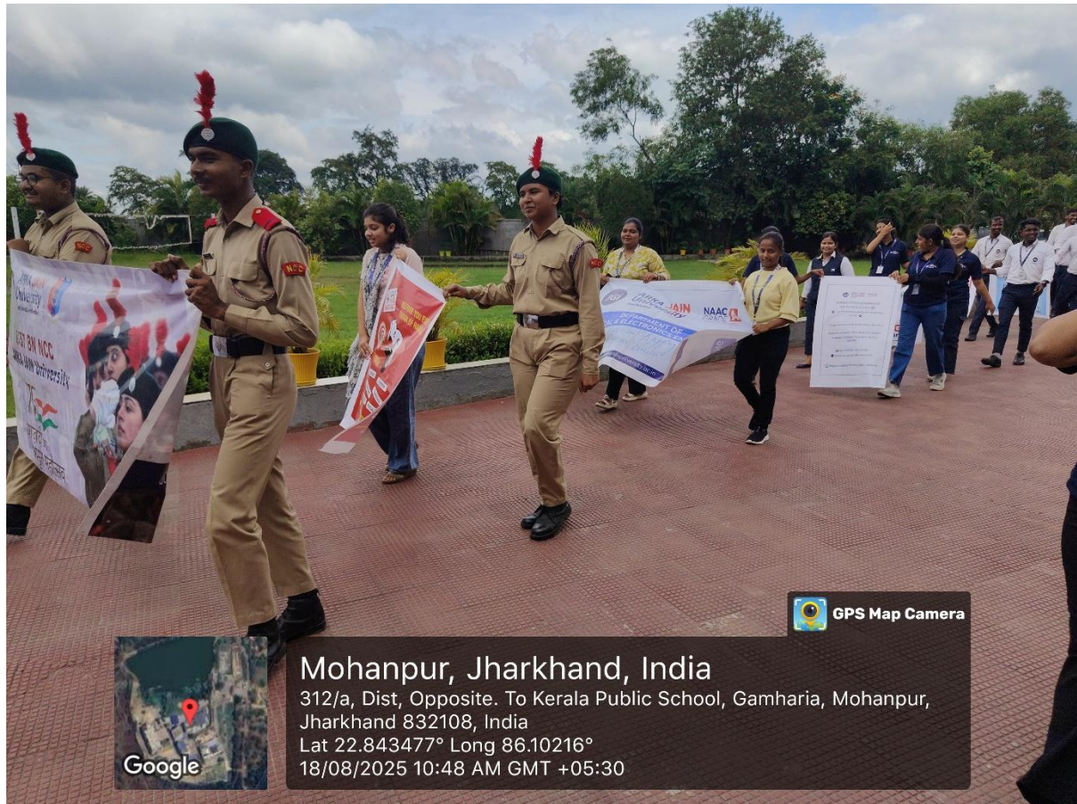
Fig. 5, Students initiative, an Awareness March on “Ragging-Free Campus Drive”