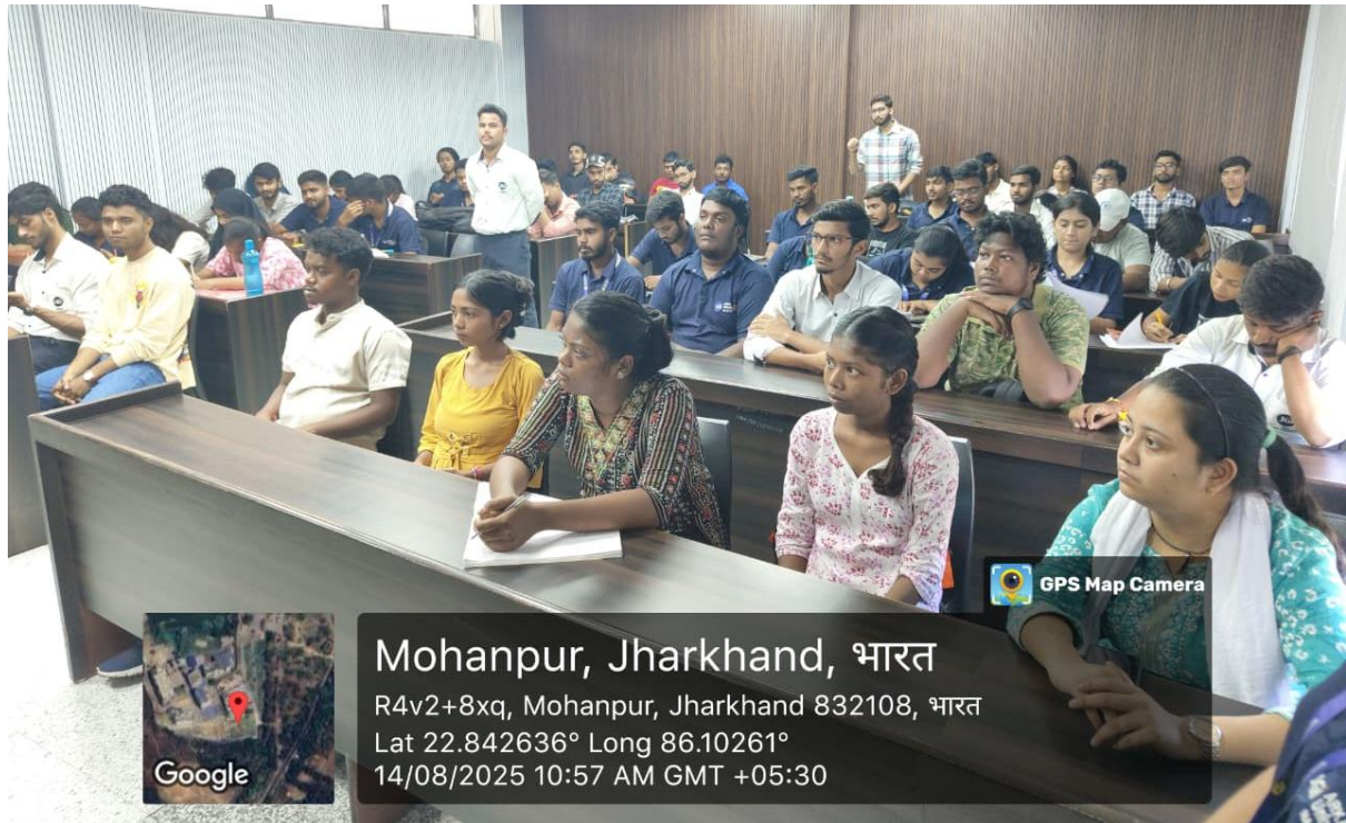
Fig. 3, Students actively reflecting their commitment to build a safe and inclusive environment.