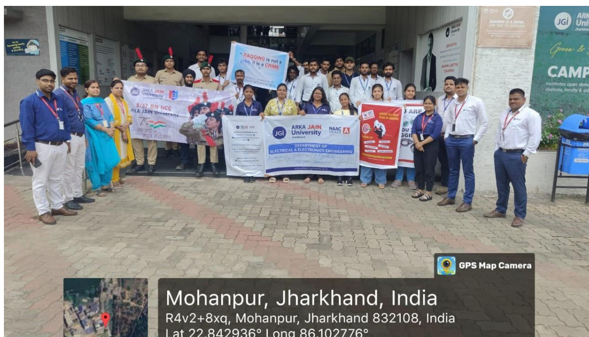
Fig. 1, Faculty & Students to commence the Anti-Ragging Awareness Program