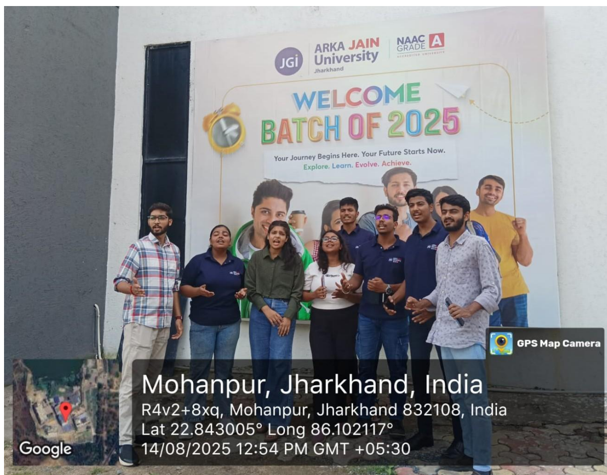
Fig. 7, Seniors whole-heartedly waiting to welcome their juniors