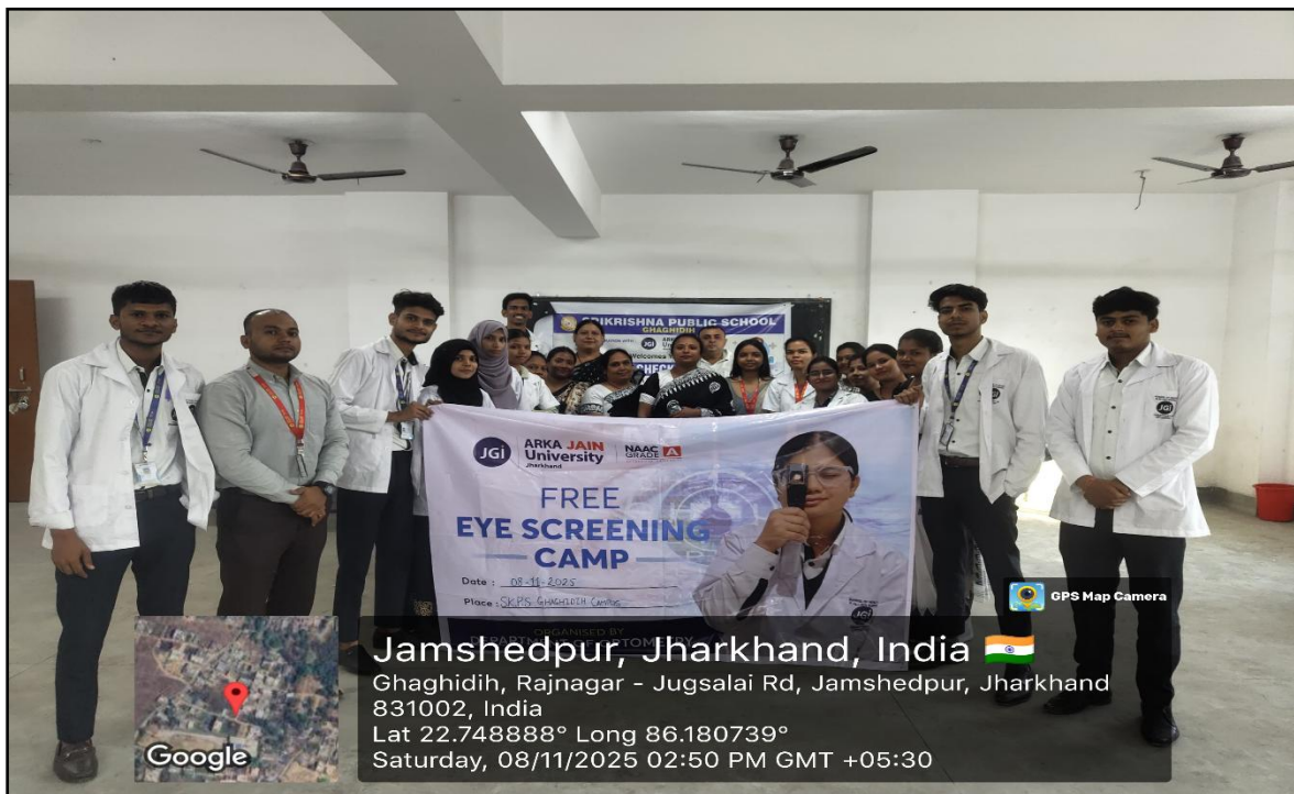
Fig 1. Awareness about the Eye Screening Camp