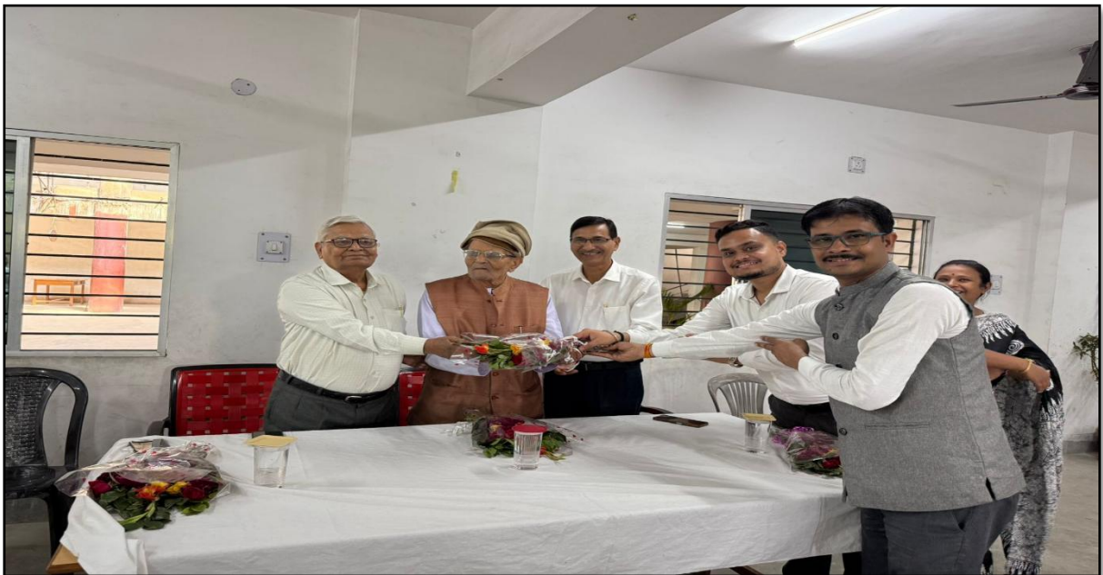
Fig 6. Felicitation ceremony after the camp