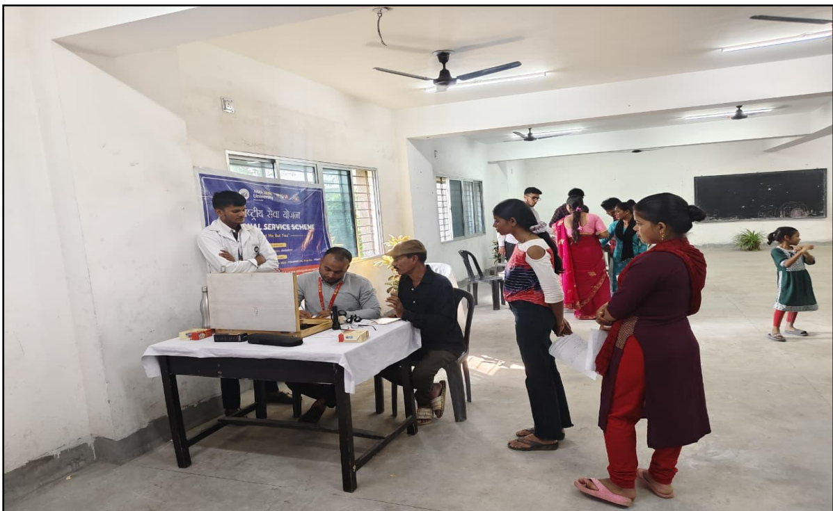
Fig 2. Eye check up and advice by the examiner