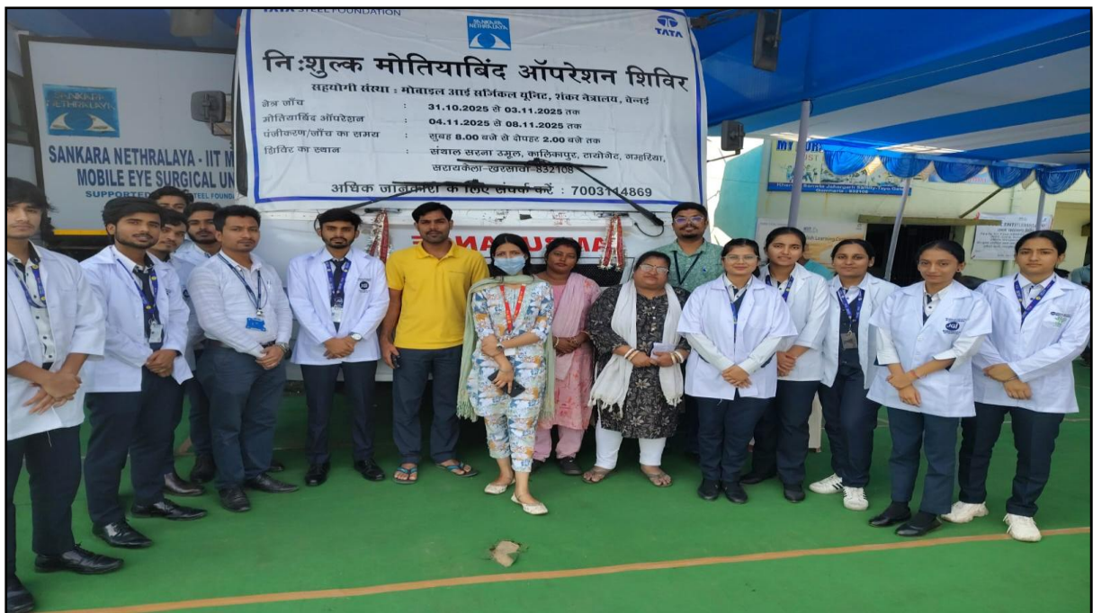
Fig 4. A group photograph with representatives from Tata Steel Foundation and Sankara Nethralaya