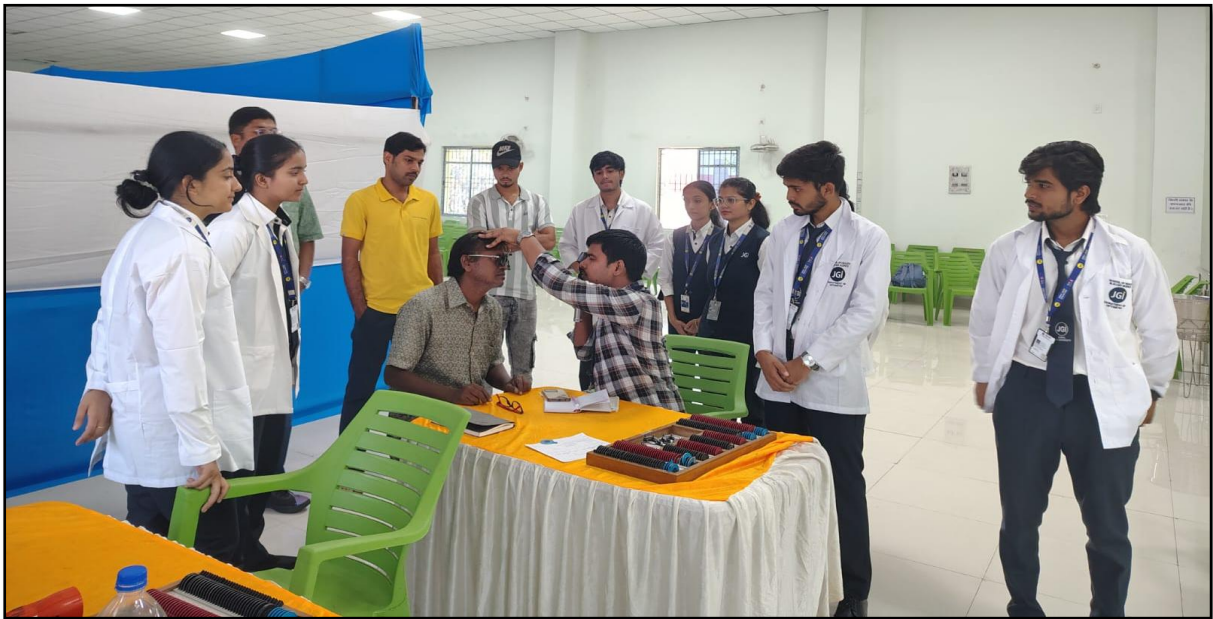
Fig 1. Students are witnessing the manual refraction being performed on a patient