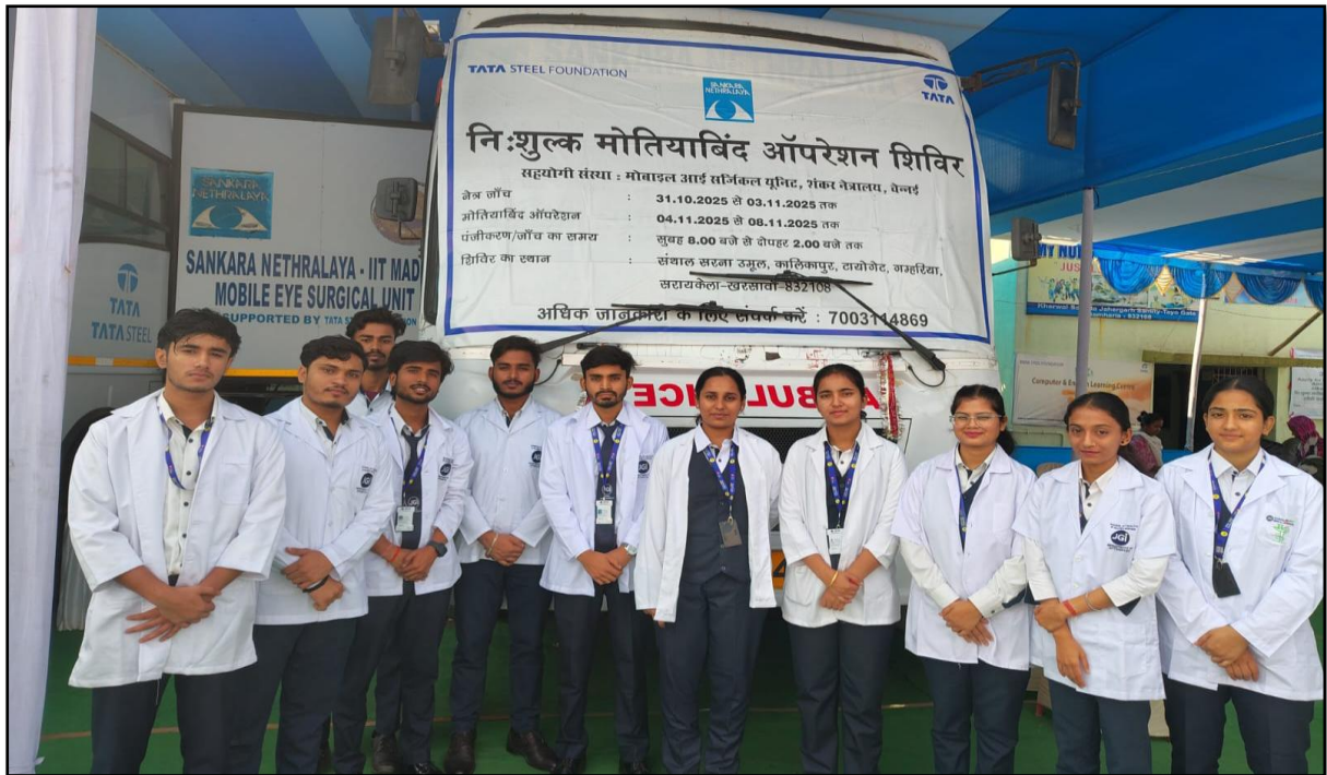
Fig 3. Group picture of students