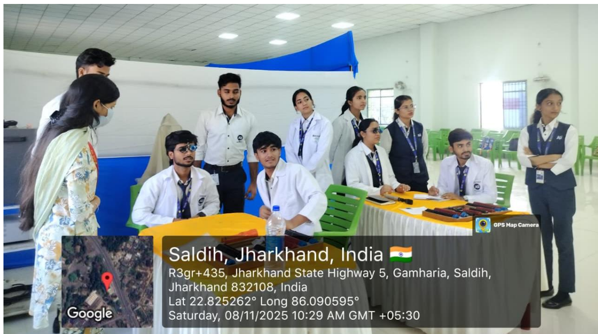
Fig 2. Students are taking vision and proceeding with the procedure