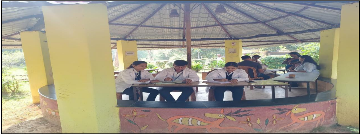
Fig 3. Registration desk of Amadubi village camp