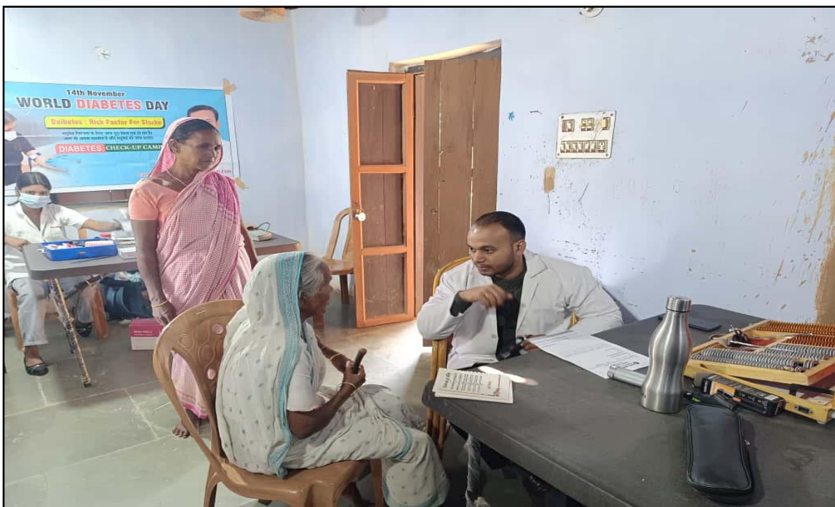
Fig 2. Eye examination by the examiner