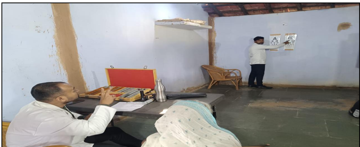
Fig 5. Evaluation of visual acuity