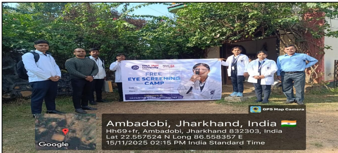
Fig 1. Eye Screening Camp