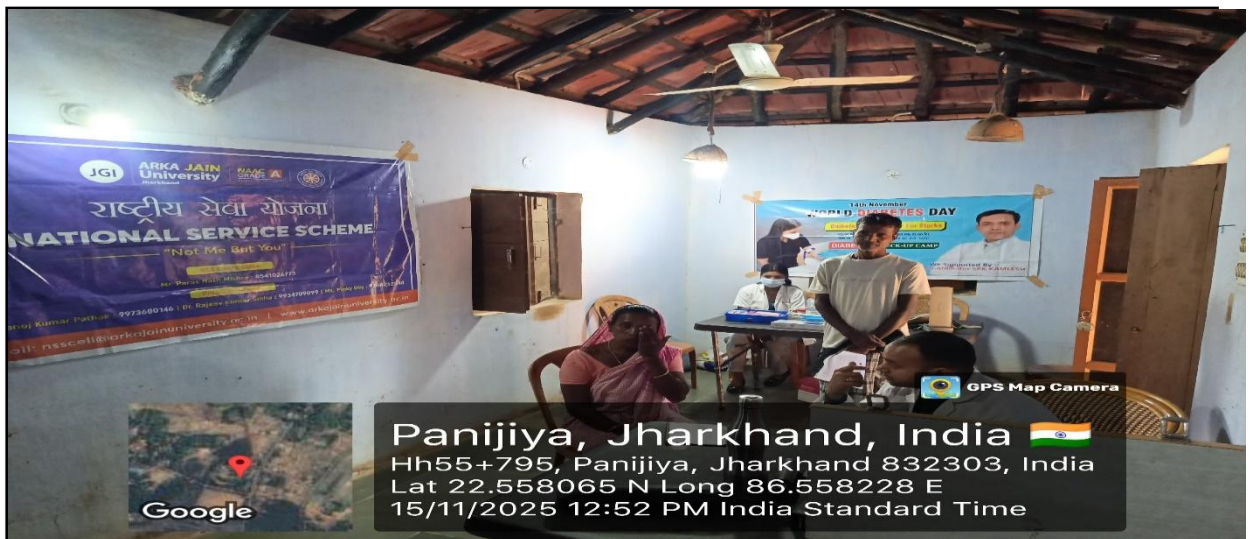
Fig 4. Eye examination by the examiner