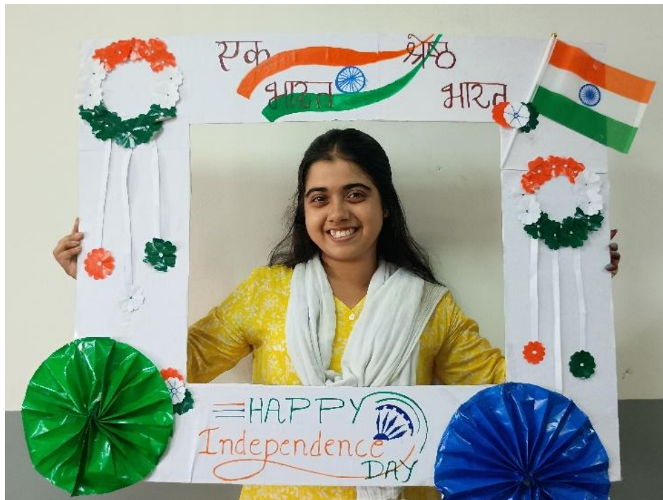
Fig. 2- students clicking their picture