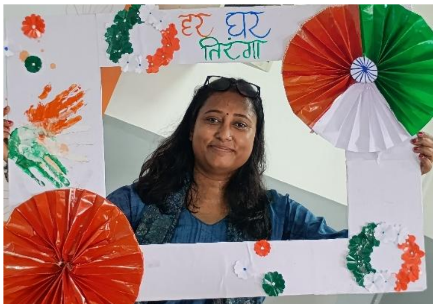
Fig. 5 – Event Cordinator of the event