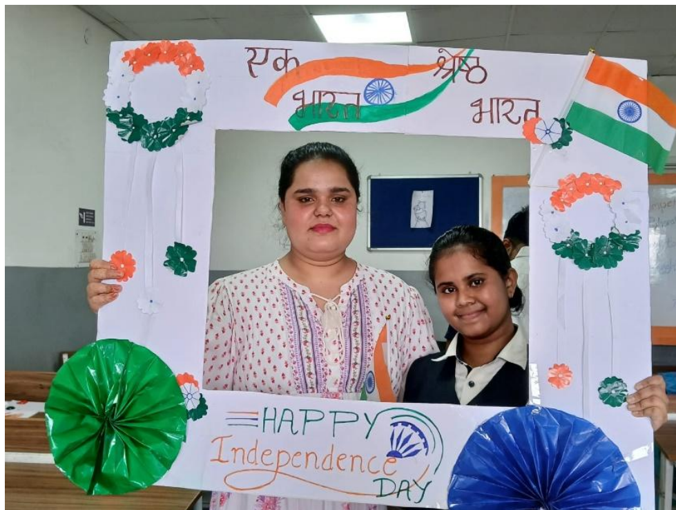
Fig. 3 – Students participating in the event