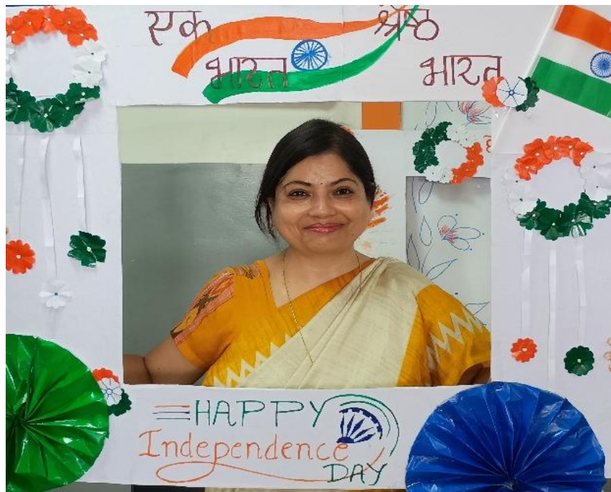
Fig. 4 Conenor of the event