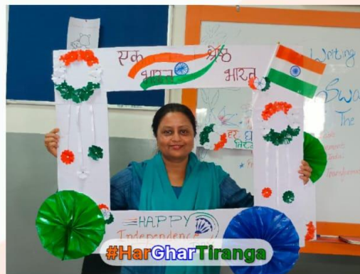
Fig 6: Photo uploaded

Note: The picture would be displayed on the portal after passing the quality check