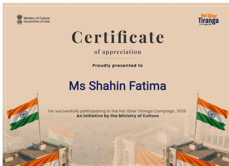
Fig 7: Certificate generated after uploading the selfie