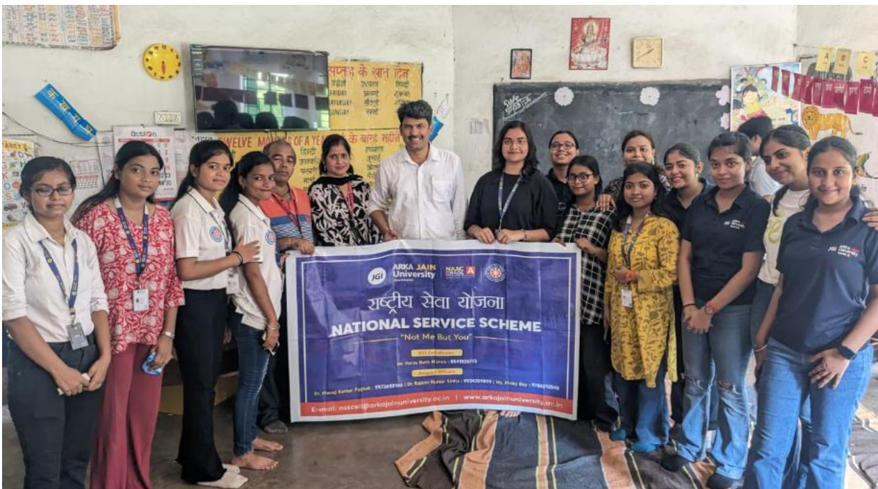
Figure 3 NSS Volunteers in the venue