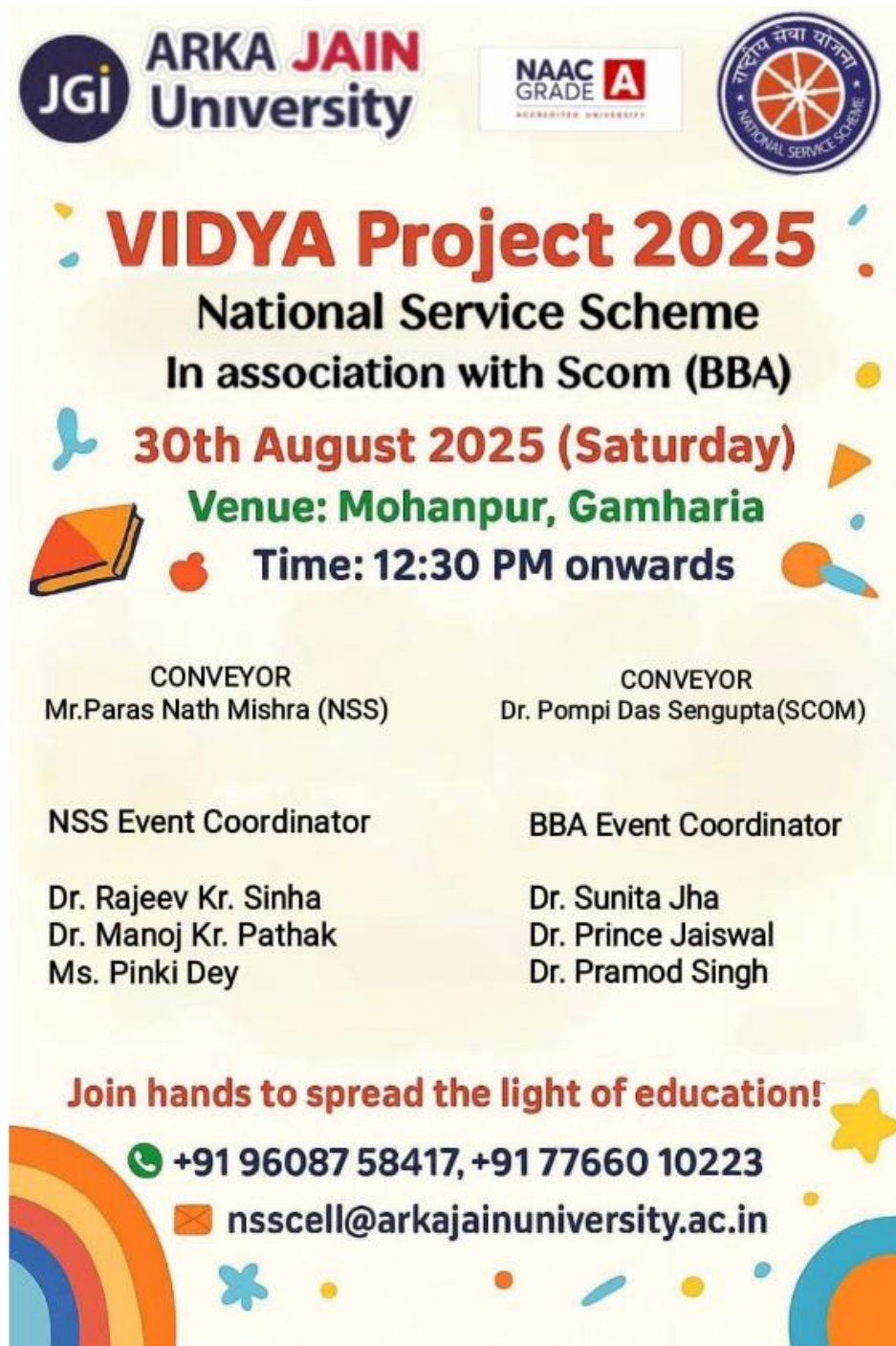
Figure 1: Poster of the event