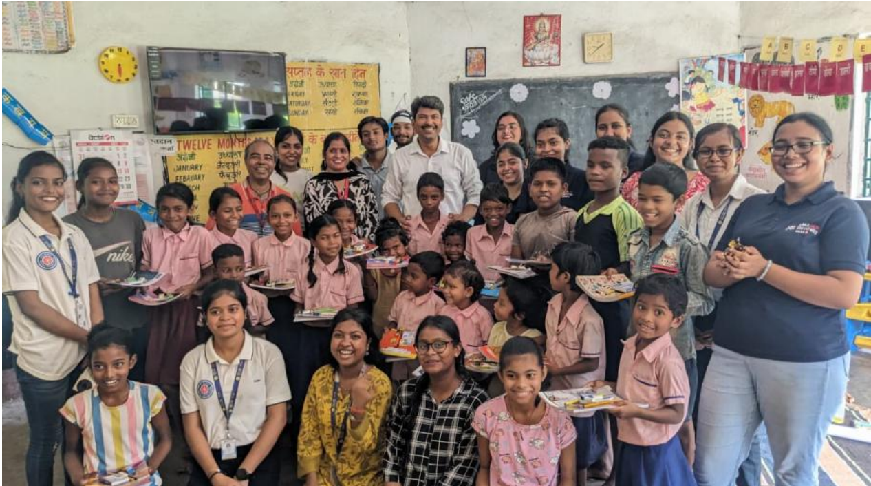
Figure 2 Educational stationery distributed among village school kids