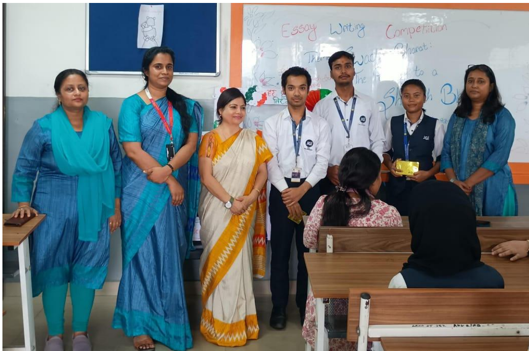
Fig.1- Prize Winners