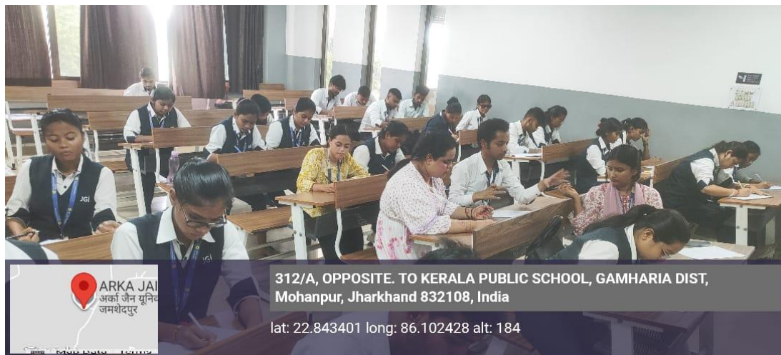
Fig. 3: Participants at the competition