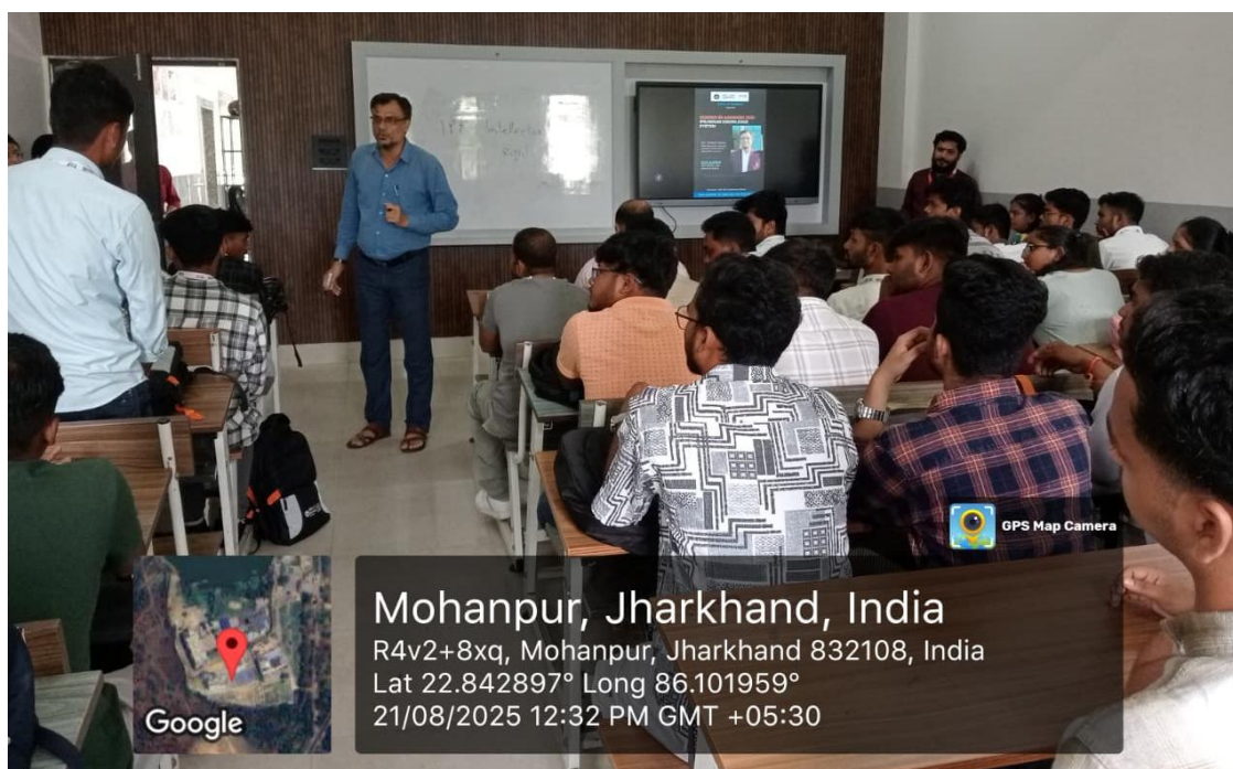
Fig. 2- Speaker interact with the students on the session