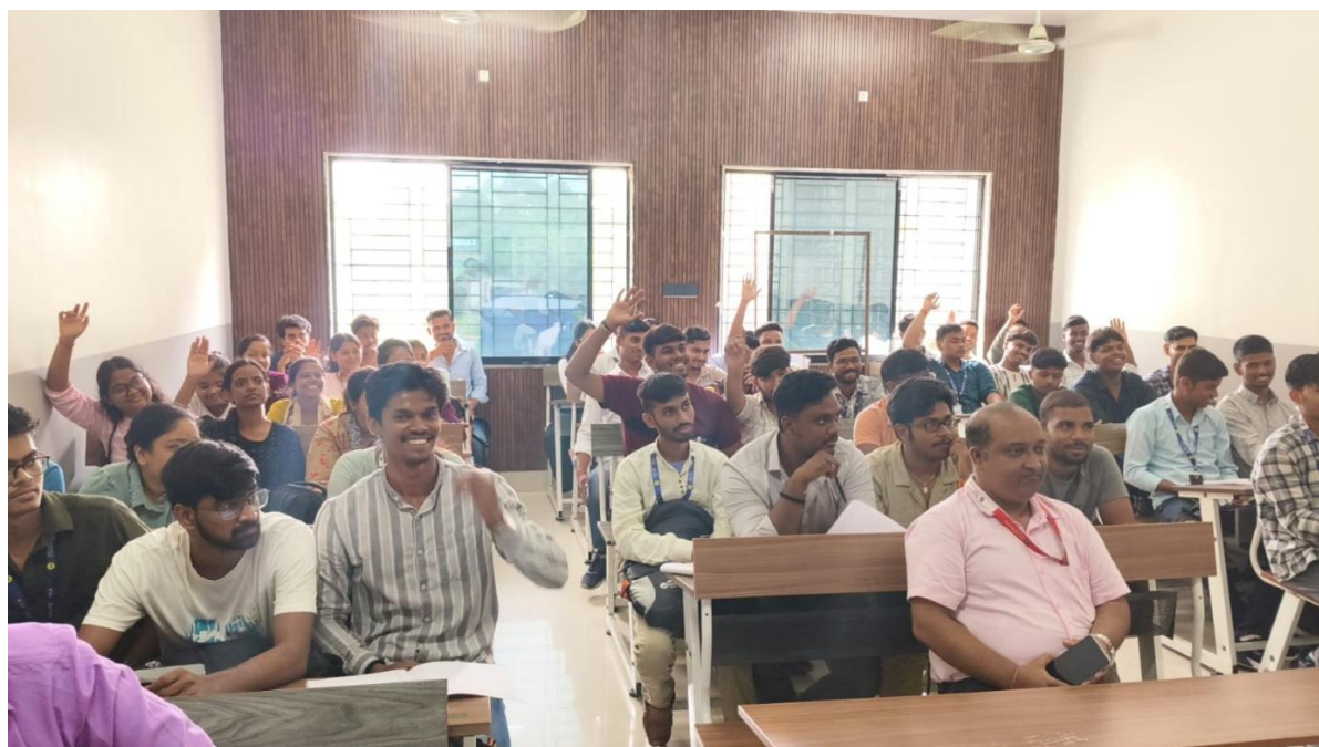
Fig. 3- Students actively participating in an interactive classroom session