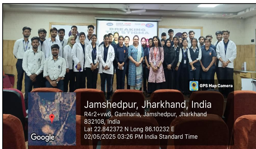
Group picture with the speaker