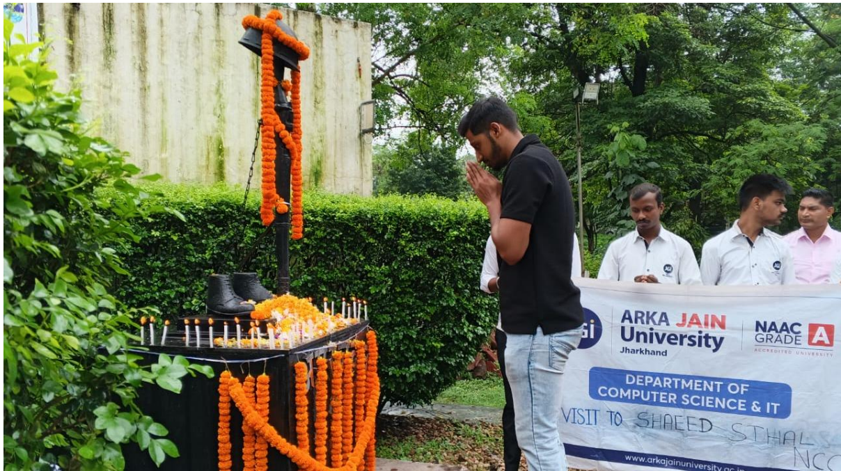
Fig. 3, Students offering prayers to the brave souls.