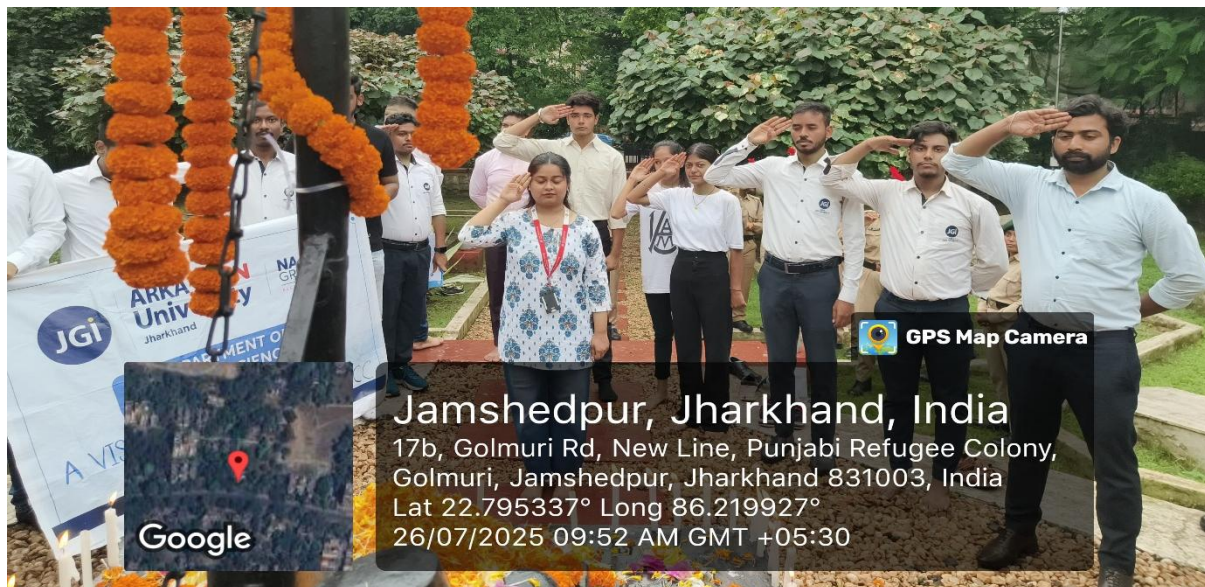
Fig. 2, Coordinator with Students offering tributary salute the brave martyrs of the Kargil War.