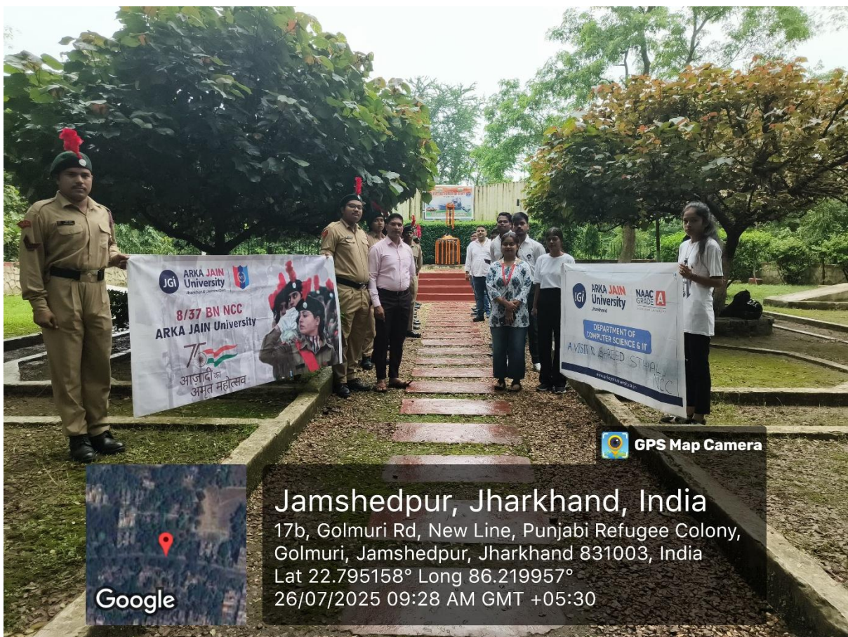
Fig. 4, Students, Coordinators and NCC staff concluded the event by singing the National Anthem.