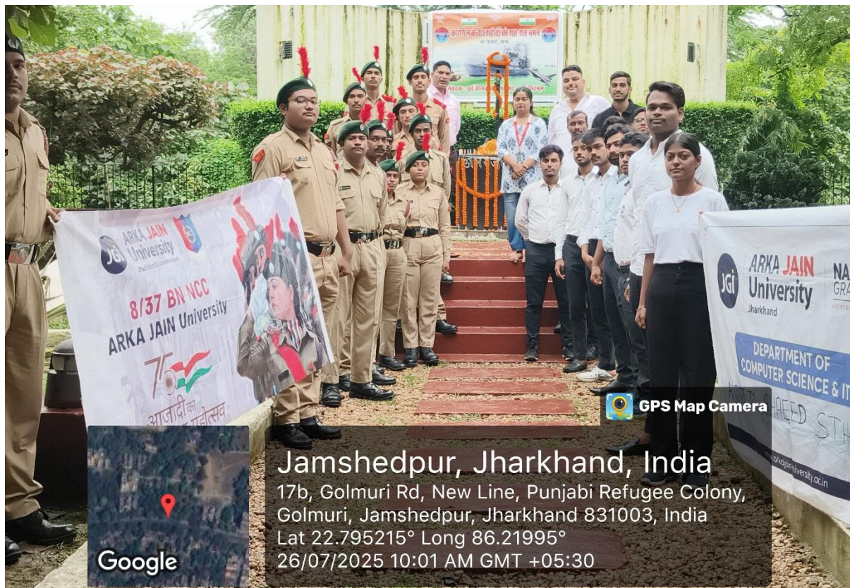
Fig. 1, Coordinators, NCC staffs & Students at Shaheed Sthal to lay down the tribute.