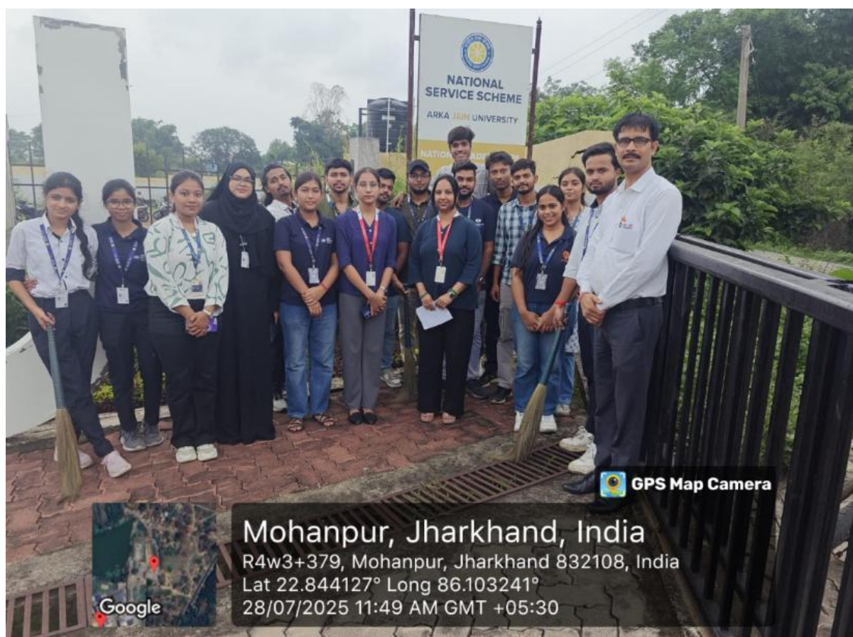
Fig. 2- Group picture of all the participants after the event.