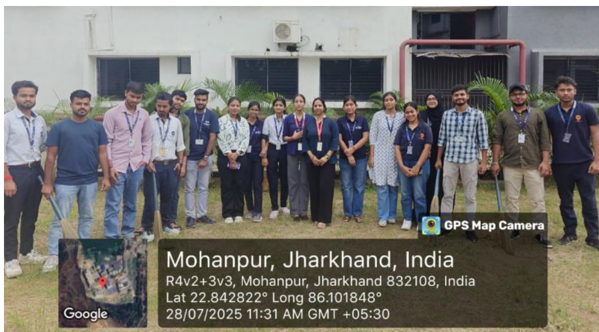
Fig.1- Group picture of all the participants with the Event Co-Ordinator.