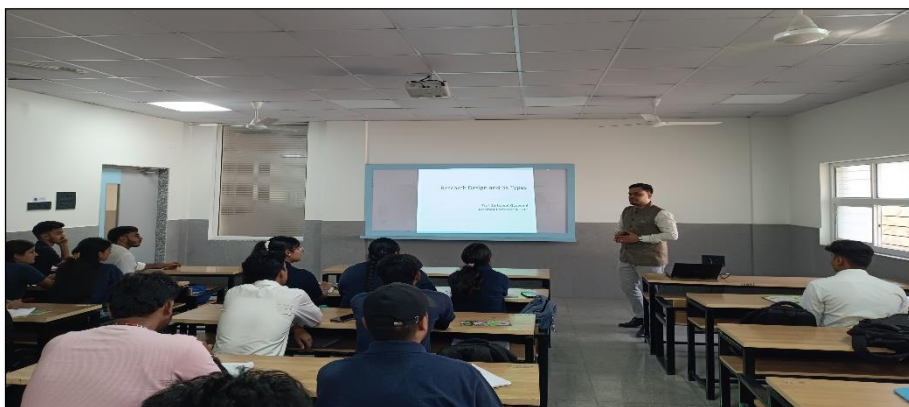
Introduction to Anti-Ragging By HOD sir