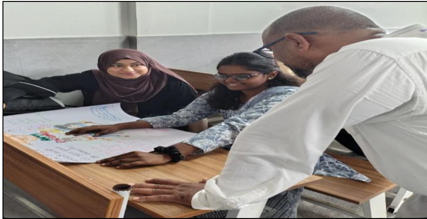
Judgement of the Poster