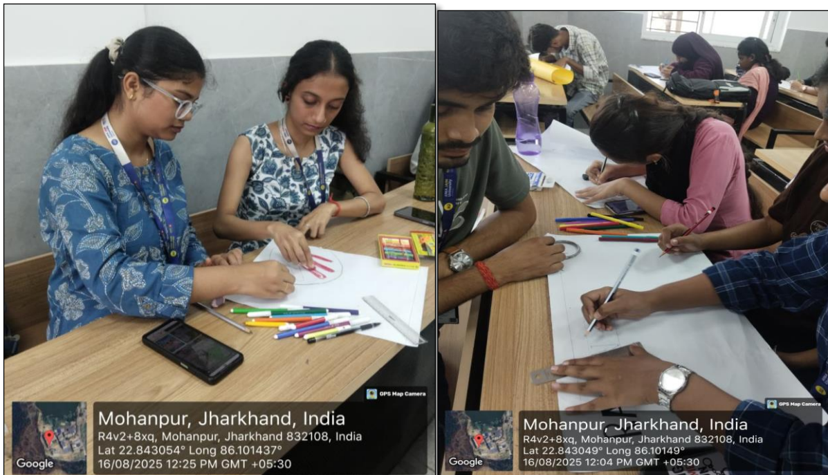
Students participating in the poster competition