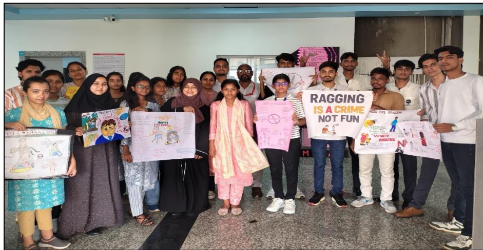
Group picture with judges, faculties, students and their poster