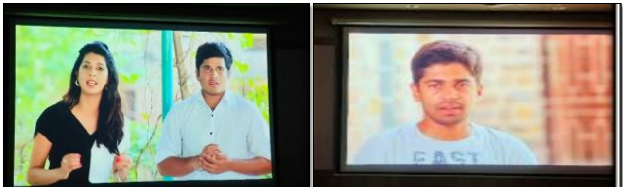
Short film streaming