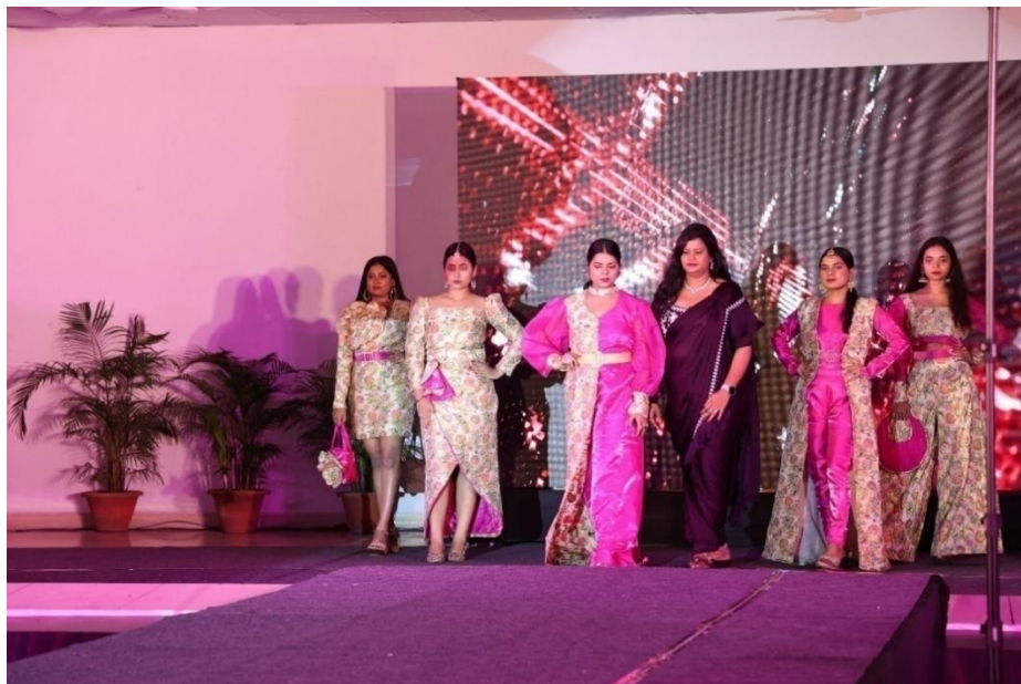
Fig 6. Collection – Desi Diversity