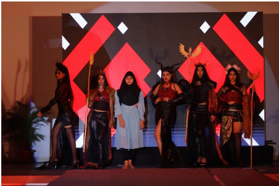
Fig 8. Collection - Gaming