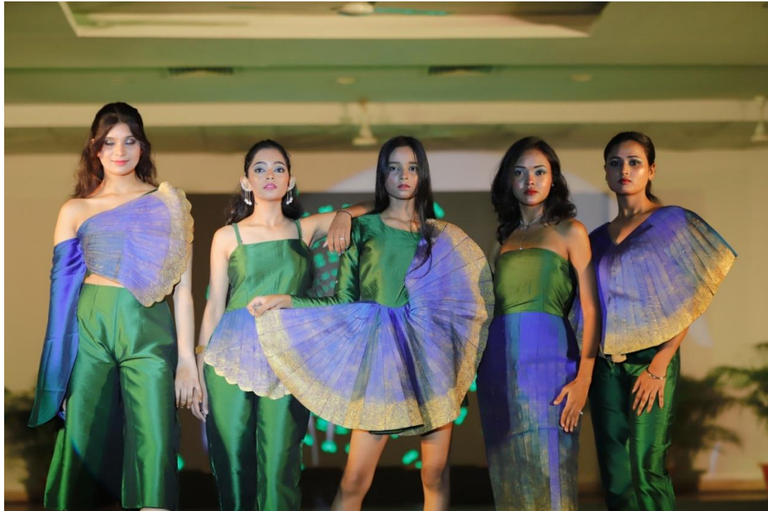
Fig 7. Collection – Recycle, Reuse