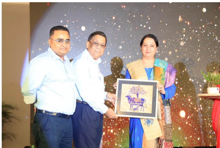
Fig 2. Guest Felicitation – Handmade Kamdhenu on water hyacinth paper