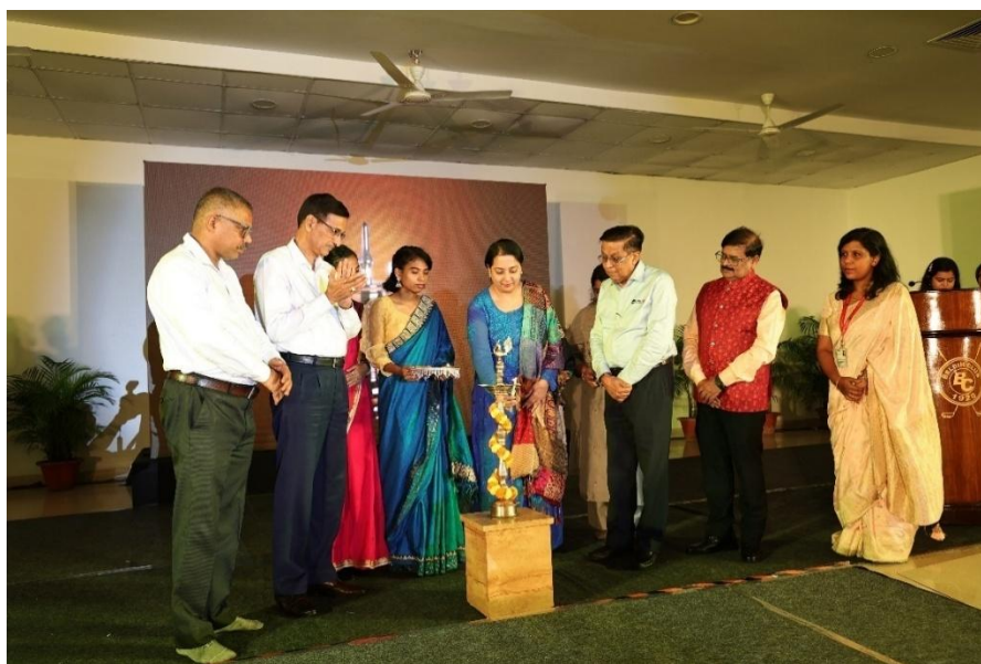
Fig 1. Lamp lighting Ceremony