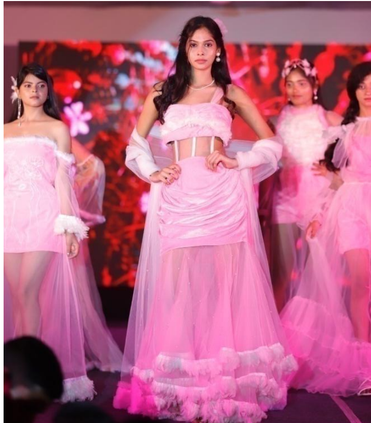
Fig 5. Collection – Diaphanous Elegance ‘Soft Girl’