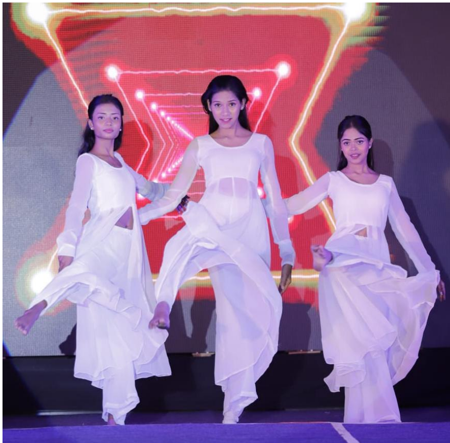
Fig 4. Welcome Dance - Kandisa