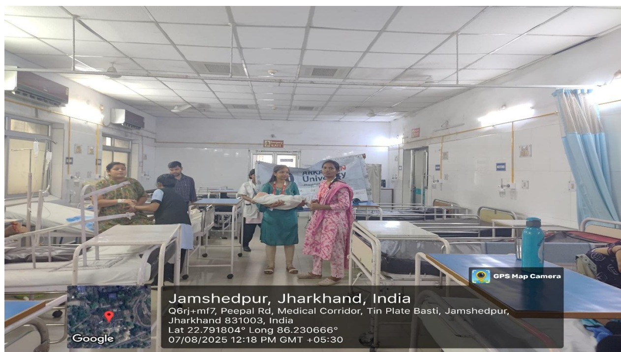
Fig.1: Faculties explaining the different positions of Breastfeeding