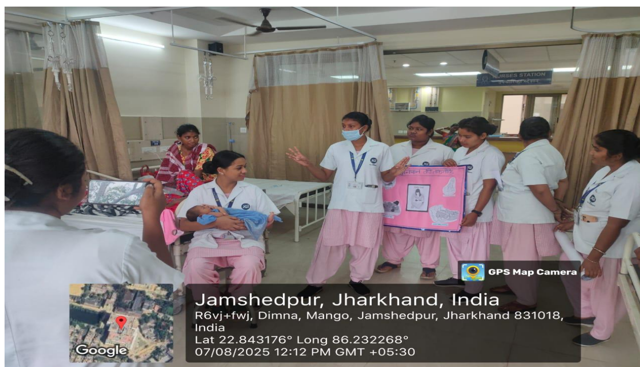
Fig.2: Students are showing demonstration on techniques of Breastfeeding