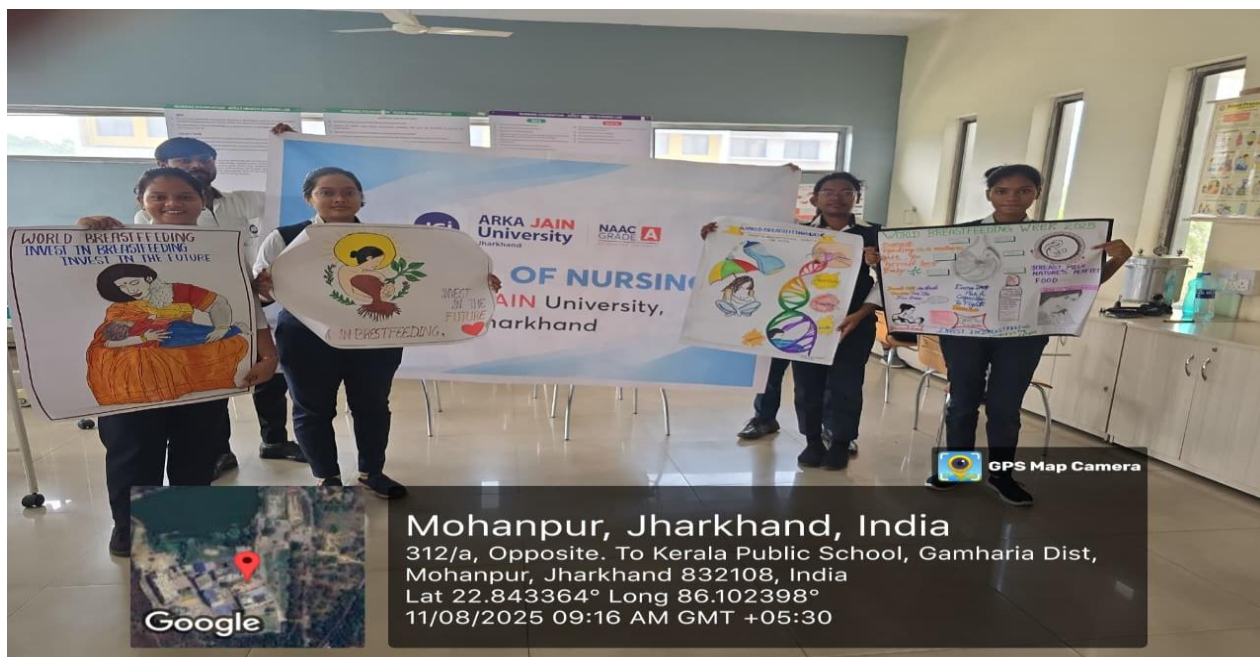
Fig.3: Students Taking part in poster competition related to Breastfeeding theme