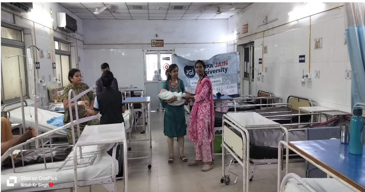
Fig.6: Faculties showing demonstrations on Breastfeeding