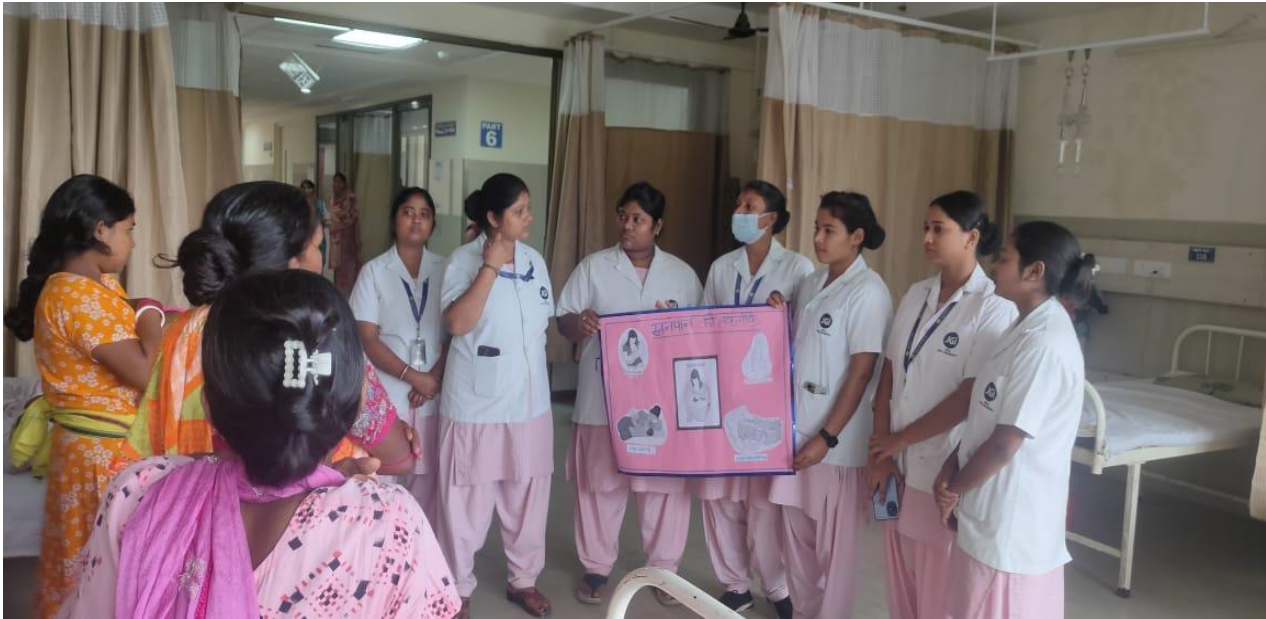
Fig.5: Students providing Health Education regarding Breastfeeding