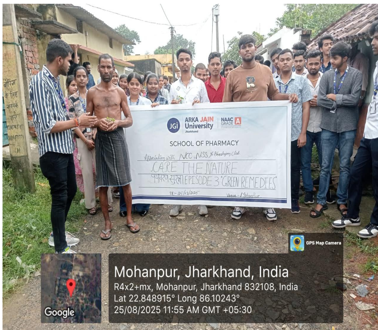
Fig1: Students interacting with the villagers.