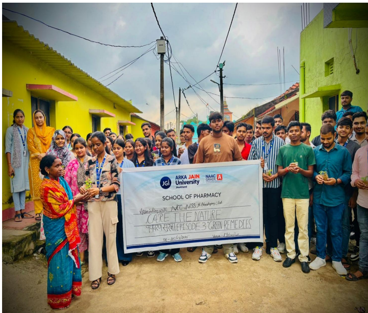
Fig2: The Students giving medicinal plants to the local villager.