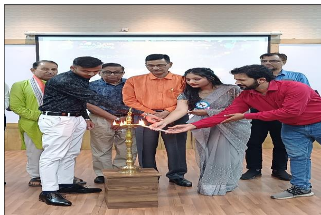
Traditional Lamp Lightening