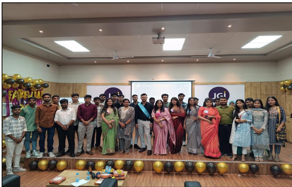
Faculty Members along with all the batch students with Mr. and Ms. Farewell