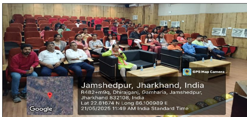
Participants for the celebration of the joyful event