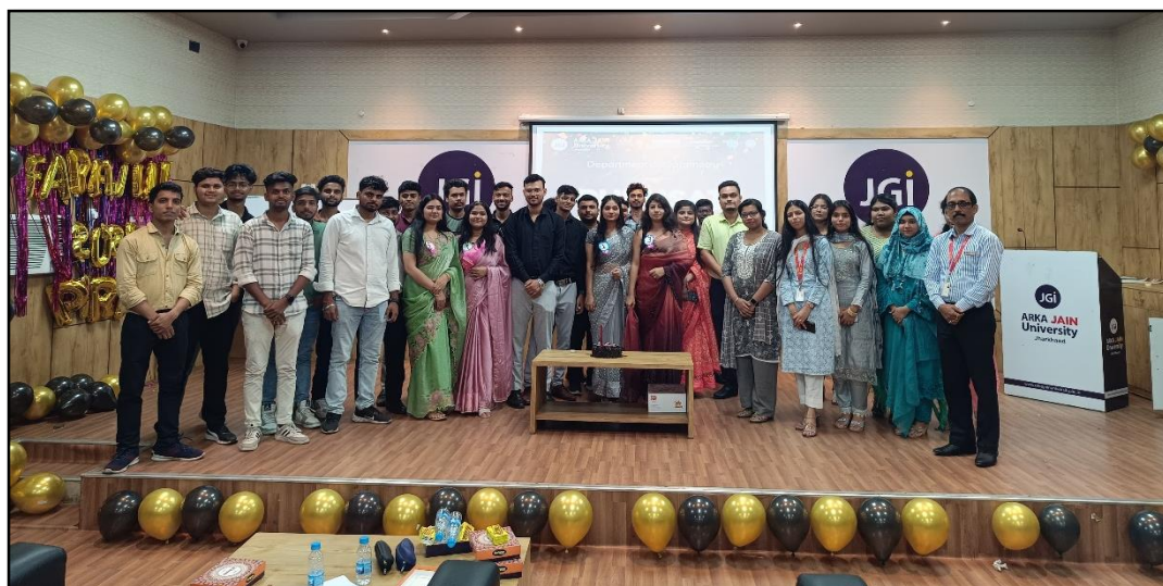
Group photograph with Dean Sir, HOD sir and other faculty members